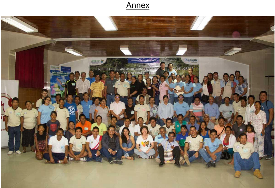
First Meeting of the Regional Protected Areas of Loreto, 5,6 and 7<sup>th</sup>, March, 2019