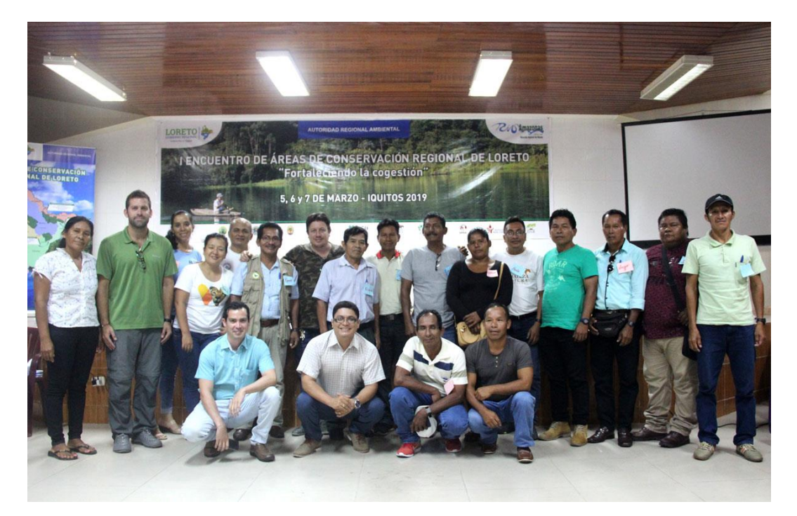
First Meeting of the Regional Protected Areas of Loreto, 5,6 and 7<sup>th</sup>, March, 2019