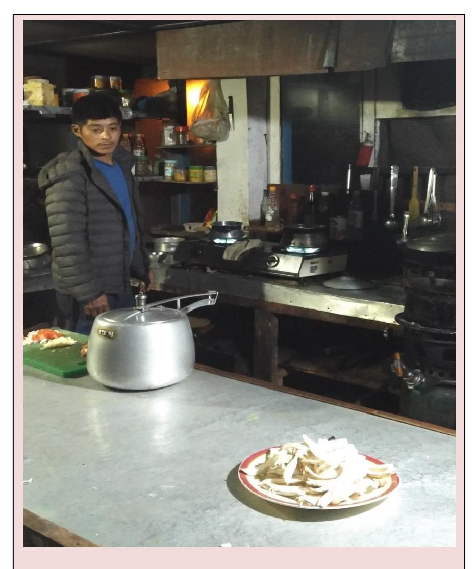
Fig 5: Picture showing a freshly collected and ready to cook wild mushrooms ( Termitomyces eurhizus ). This species is very common, and widely consumed among all the ethnic communities and age groups in Annapurna Conservation Area. In this study, we have identified five localities from Birethanti (1000m) upto Upper Sinuwa (3000m) with their rich occurrences and distributions. Location - Bamboo, ACA).

In parallel, another major outcomes from this aspect is we have brought three types of