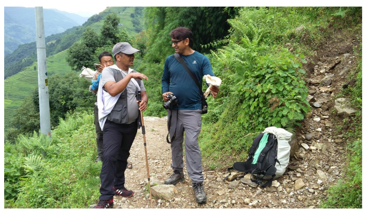
Showing a freshly collected specimens and discussing about locals vast array of knowledge is an important part of ethnomycological survey. This helps to understand ILK on natural resources among the IPLCs. In the mean time, we could also share our knowledge on mushrooms to make them aware and attentive on mushrooms poisoning.