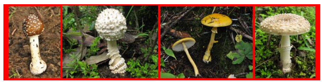
Fig 3. Locally dominated poisonous mushrooms from the southern flanks of Annapurna Conservation Area (Amanita pantherina, A. concentrica, A. hemibapha and an unidentified Amanita sp. from L to R).

In the end, it is worthwhile to mention that, our team collaboration and socio-economic cum ethnomycological survey was greatly done by the presence of women socio-economic analyst (Research Associate - Ms. Poudel) in a team. Clear linkage with local mothers groups, elderly people and the way she was supporting a team are few of the evidences concerning the effect of gender diversity on team performance and positive practical consequences for knowledge system. With this lesson and evidence, now we can strongly argue that gender balance is important to increase the productivity of team collaboration and which we happily minimised such gap.