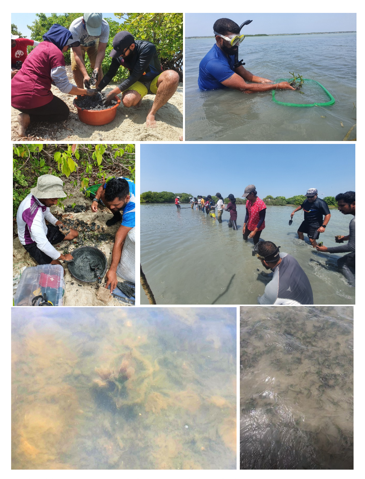
Top left: Mixing up muddy sand from donor site and fertilizer, Top right: Collecting donor seagrass plugs, Bottom left: A plug of seagrass replanted in a hessian bag – after 3 months (underwater), Bottom right: A patch of restored seagrass – after 1.5 years.