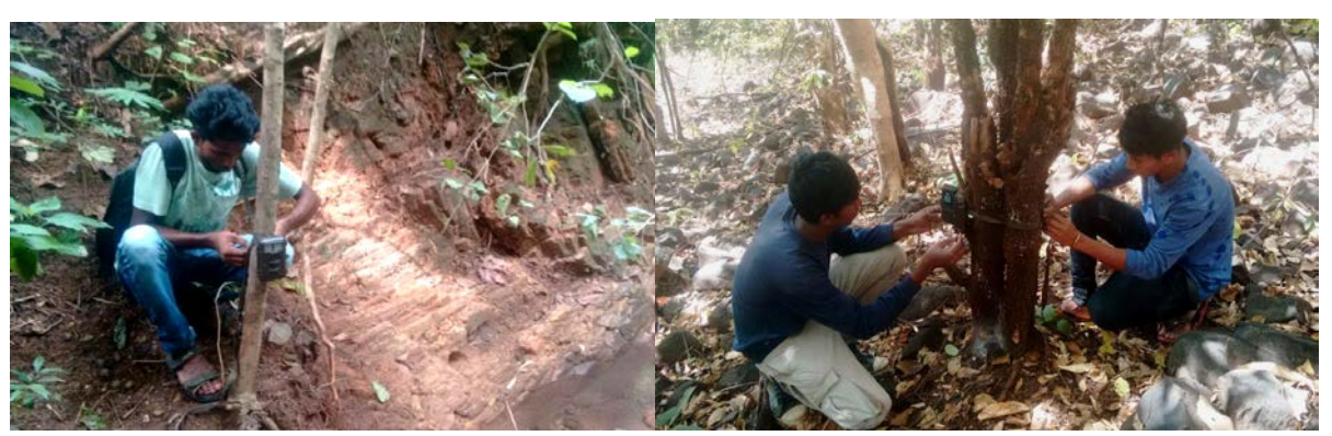
Figure 13-14: Project staff Aravind Turram and volunteer Mahesh setting up camera traps near potential pangolin burrows