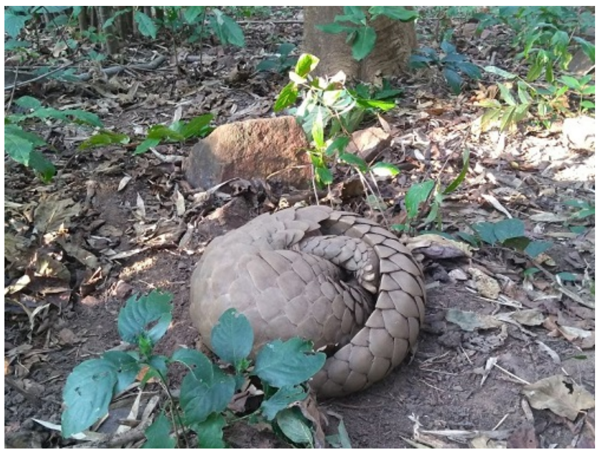
Figure 3: A pangolin successfully rescued and released by the project team in cooperation with the Andhra Pradesh Forest Department