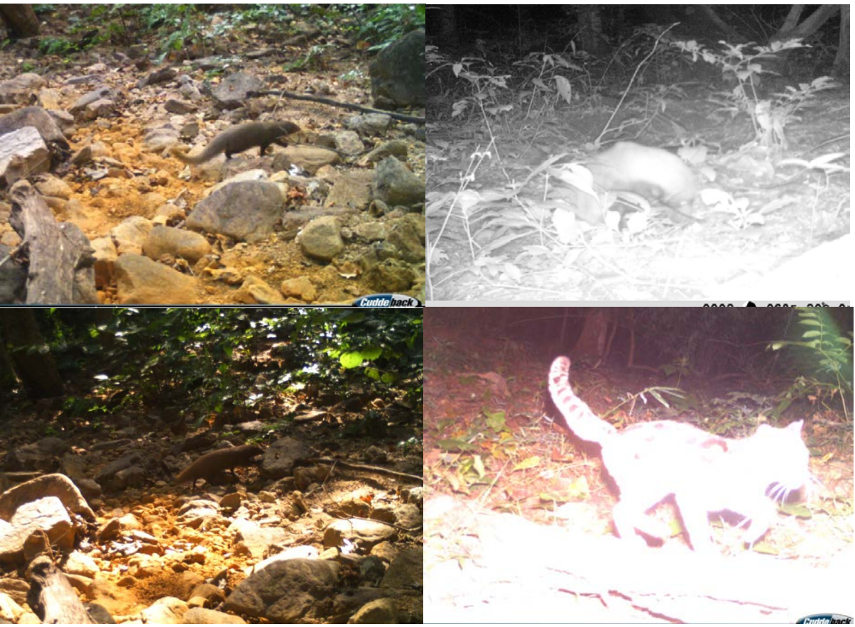
Figure 4-7: Camera trap images of a few carnivores captured during the course of the project, clockwise 4) Grey mongoose, 5) Honey badger recorded for the first time, 6) Leopard cat, 7) Ruddy mongoose