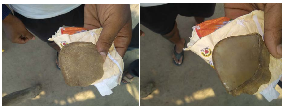
Figure 1 and 2: Scales of pangolins hunted in the local area