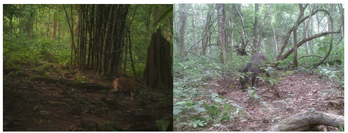
Figure 8-11: Camera trap images of a few herbivores captured during the course of the project, clockwise 8) Sambar, 9) Indian muntjac, 10) Indian wild pig, 11) Four horned antelope