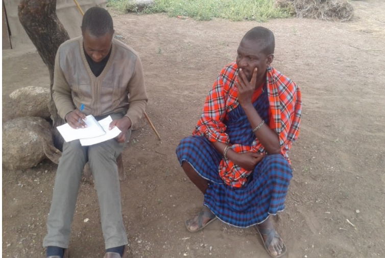
Pre Testing of the household questionnaires