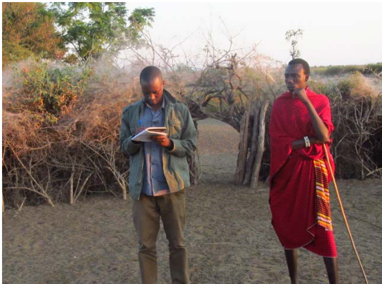
Pretesting of the household questionnaires in Olasiti village.