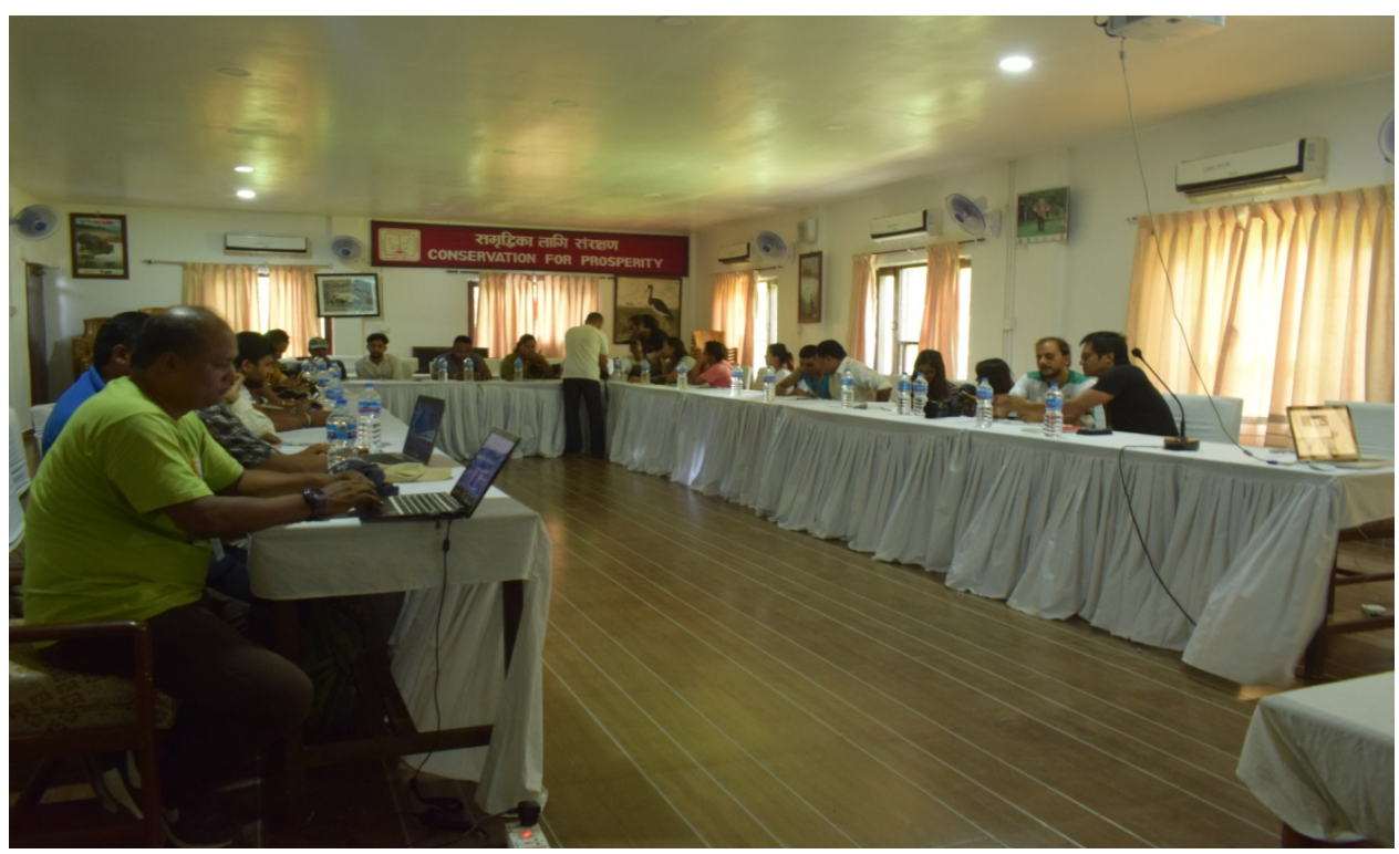
Program venue (NTNC Sauraha) - with 26 participants and instructors