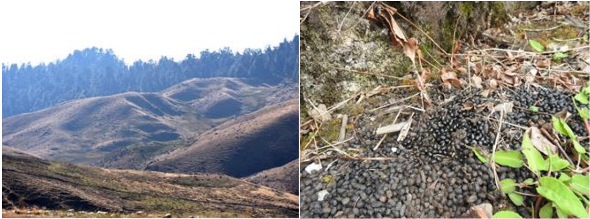
Photo 11: Habitat of Musk Deer in KNP. Photo 12: Musk Deer defecation site in KNP.