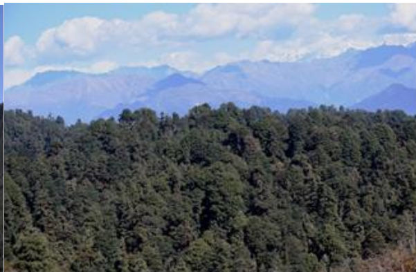
Photo 9: Habitat of Musk Deer in the KNP. Photo 10: Habitat of Musk Deer (North Phsae) at KNP.