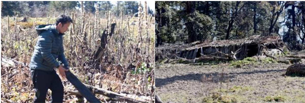
Photo 13: Researcher showing burning wood inside the KNP. Photo 14: Cowshed (Gotha) inside the national park.