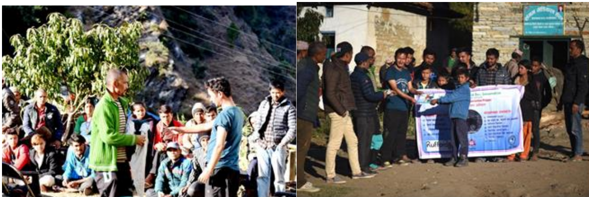
Photo 3: Conservation awareness materials such as T-shirt distribution to the local people. Photo 4: Researcher distribution outreach materials to the students of Chhanna Village of KNP.