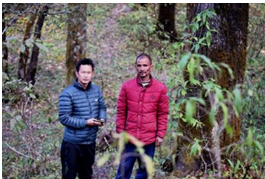
Photo 16: Researcher with MDIC co-ordinator during the field survey.