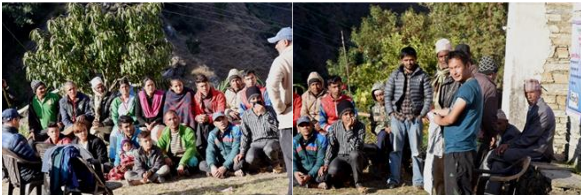
Photo 1: Participants during conservation awareness program in KNP. Photo 2: Conservation awareness materials such as T-shirt distribution to the local people.

I would like to thank Rufford Foundation for financial support to carry out this project. And, I am looking forward the similar kinds of invaluable support from the Foundation in the near future. The special thanks go to Himalayan Biodiversity Network Nepal for equipment support and Department of National Park and Wildlife Conservation (DNPWC) for the permission to the project. I would like thank to people of the Chhanna Village of Bajhang district.