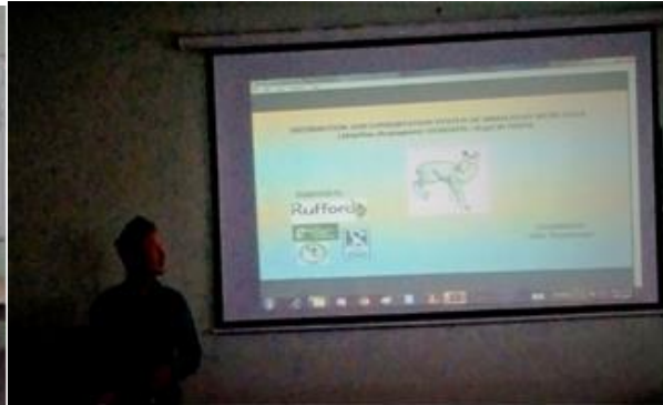
Photo 7: Biology students of Nepal Don Bosco College, Lalitpur, Nepal. Photo 8: Presentation on Musk Deer conservation with student of Nepal Don Bosco College, Lalitpur, Nepal.