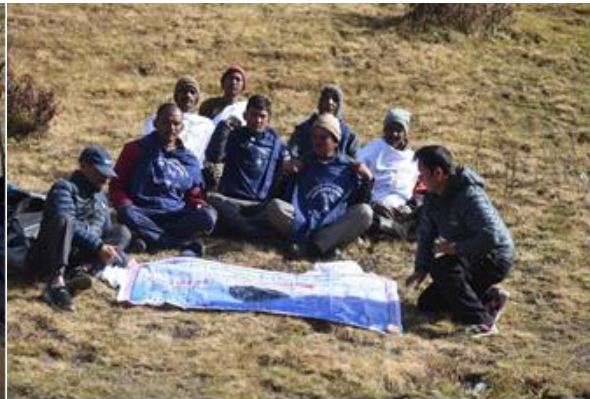
Photo 5: Researcher distribution outreach materials to the students of Chhanna Village of KNP. Photo 6: Researcher with Park staff and survey team.