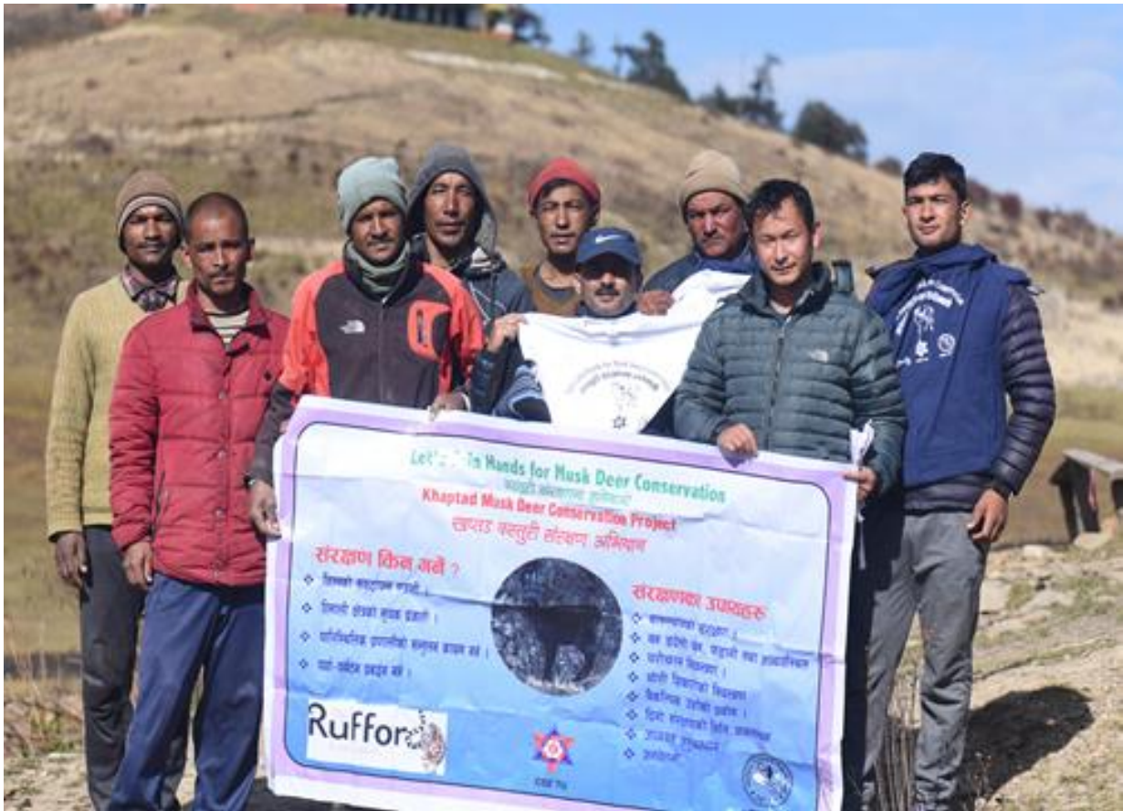
Survey team (MDIC, Park staff and local people).

The conservation and awareness program, distribution of the outreach materials, radio program and drawing competition within the school level students will be conducted in the second phase of the project.