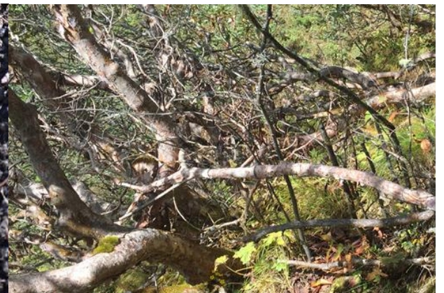
Left: Musk Deer defecation site. Right: Poaching site (The place made for wire snare).