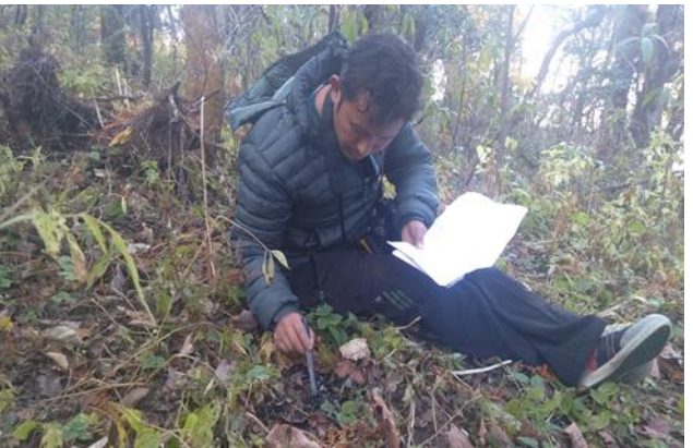
Left: Questionnaire survey with Parks' staff and local people. Right: Observation of pellet (Musk Deer).