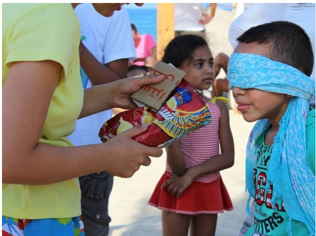
"Turtle Day" for El Quseir children: marine turtle related games and activities on the beach.