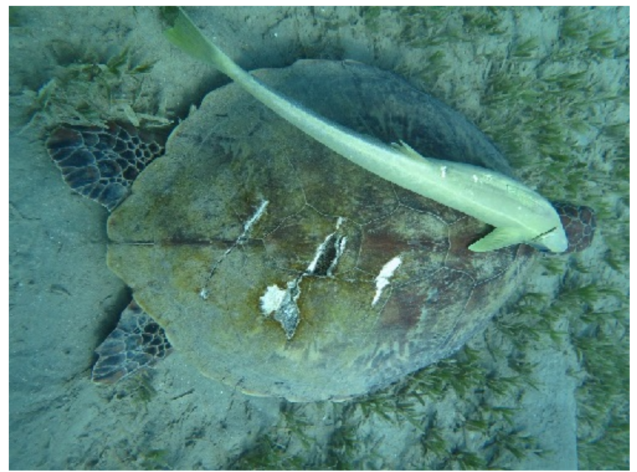
Most recently spotted injured turtle resident in Marsa Abu Dabbab.