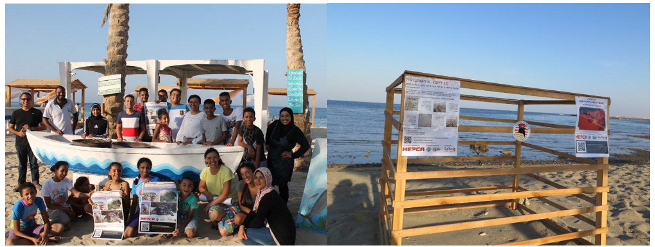
Left: "Turtle Day" for El Quseir children: the group who took part in the awareness event. Right: Nest in Equinox, Extra Divers dive centre protecting a nest reported to TurtleWatch – Egypt.