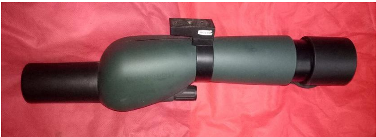
Figure 3: Spotting scope (supported by Idea Wild Foundation)

Our Spotting scope and tripod were broken during monitoring in winter.