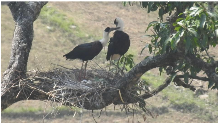
Figure 7: A pair of Asian Woollyneck in Nest

Project would not have been initiated without official permission from Department of Forest, Babarmahal Kathmandu. Bird Conservation Nepal (BCN) have been our supervisor. Pokhara Bird Society (PBS) technically helped us throughout the project. Idea Wild Foundation deserves credit for providing Spotting scope and GPS.