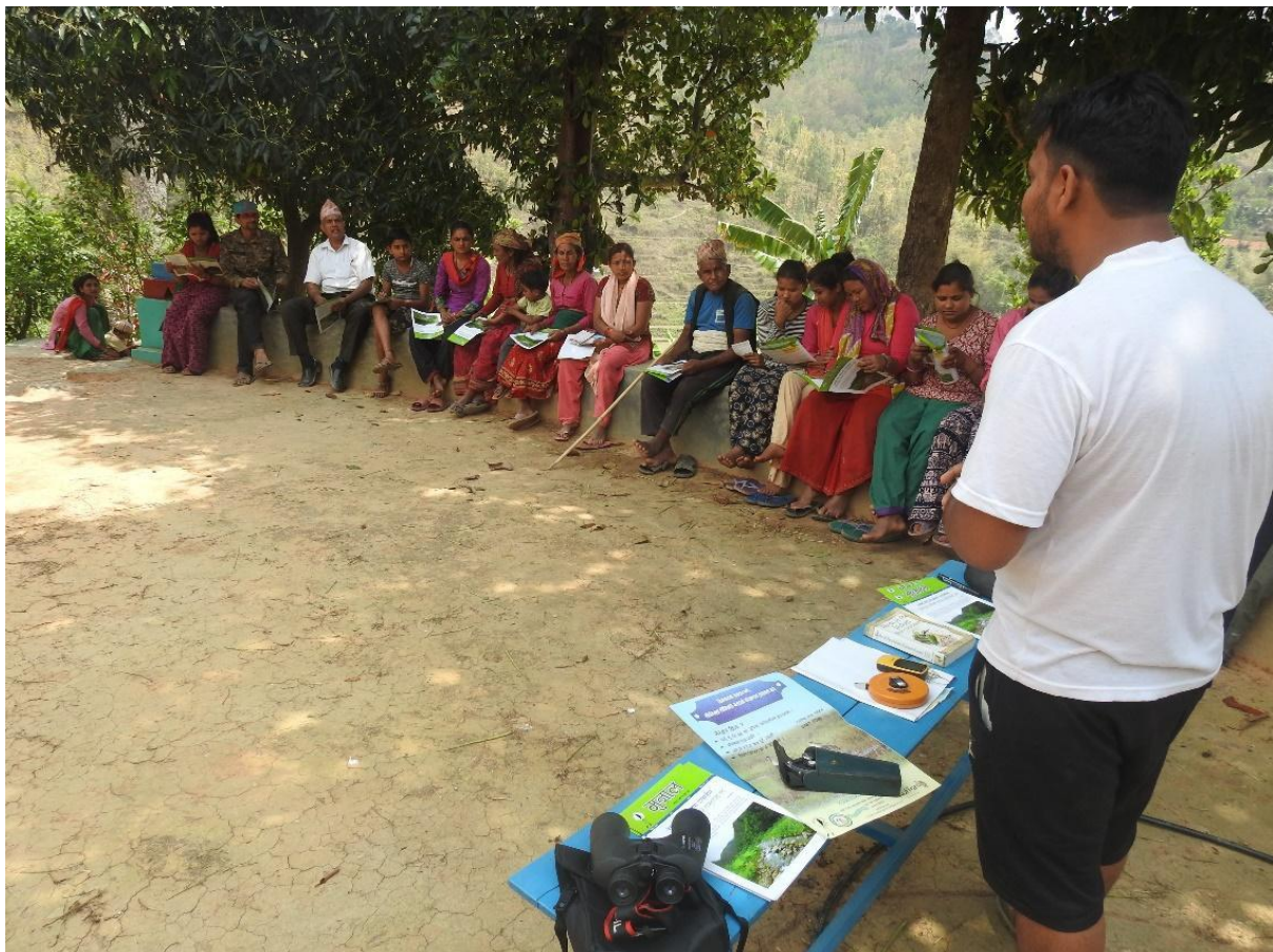
Figure 6. Displaying research instrument and discussing with locals

Negative believes regarding birds prevailing in communities were clarified with scientific information which has certainly brought positivity. Local youths were mobilized to monitor nesting status where they learnt about scientific practices. Our posters and leaflets also benefitted people for understanding Asian Woollyneck in detail.