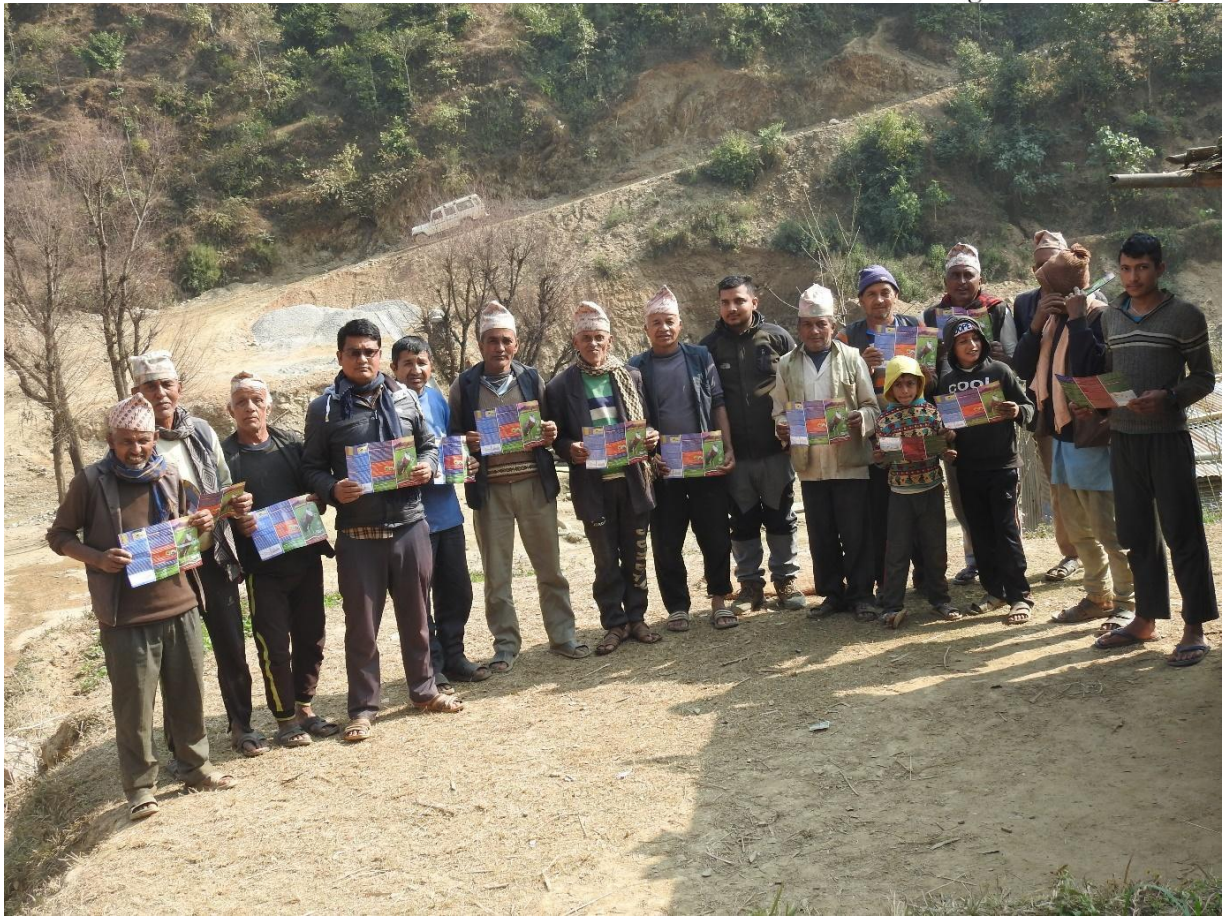
Figure 2: Group photo after discussion with local

Our Spotting scope and tripod were broken during monitoring in winter.