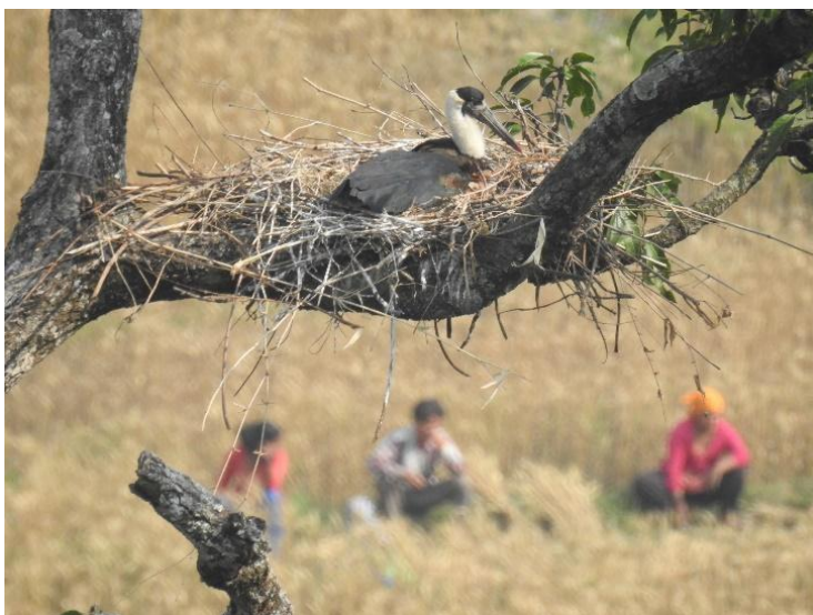
Figure 8: Asian Woollyneck incubating eggs (And farmers sitting nearby)