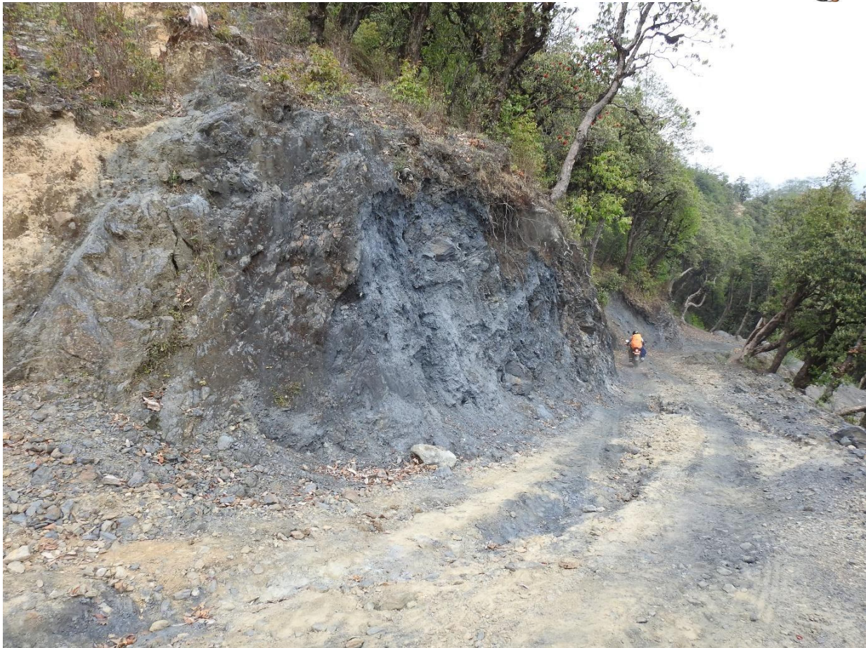
Figure 1: Road condition of study site

Study area is in mid – hill of the country where emigration is sharp. Youths are moving to cities and abroad while the villages are left with school children and old aged people. This has limited active conservation intervention around nesting locality. Thus, Active conservation efforts is limited. To broaden our impact, we conducted our conservation campaigns with local women's group, local cooperatives organizations, and small farmers groups.