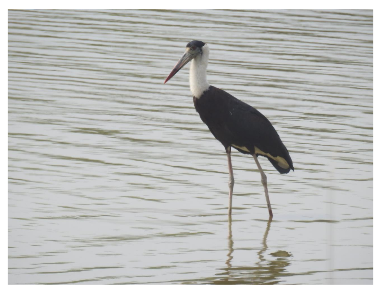
Details: Photographed in 21<sup>st</sup> July 2018 at Gaidahawa lake, Rupandehi District