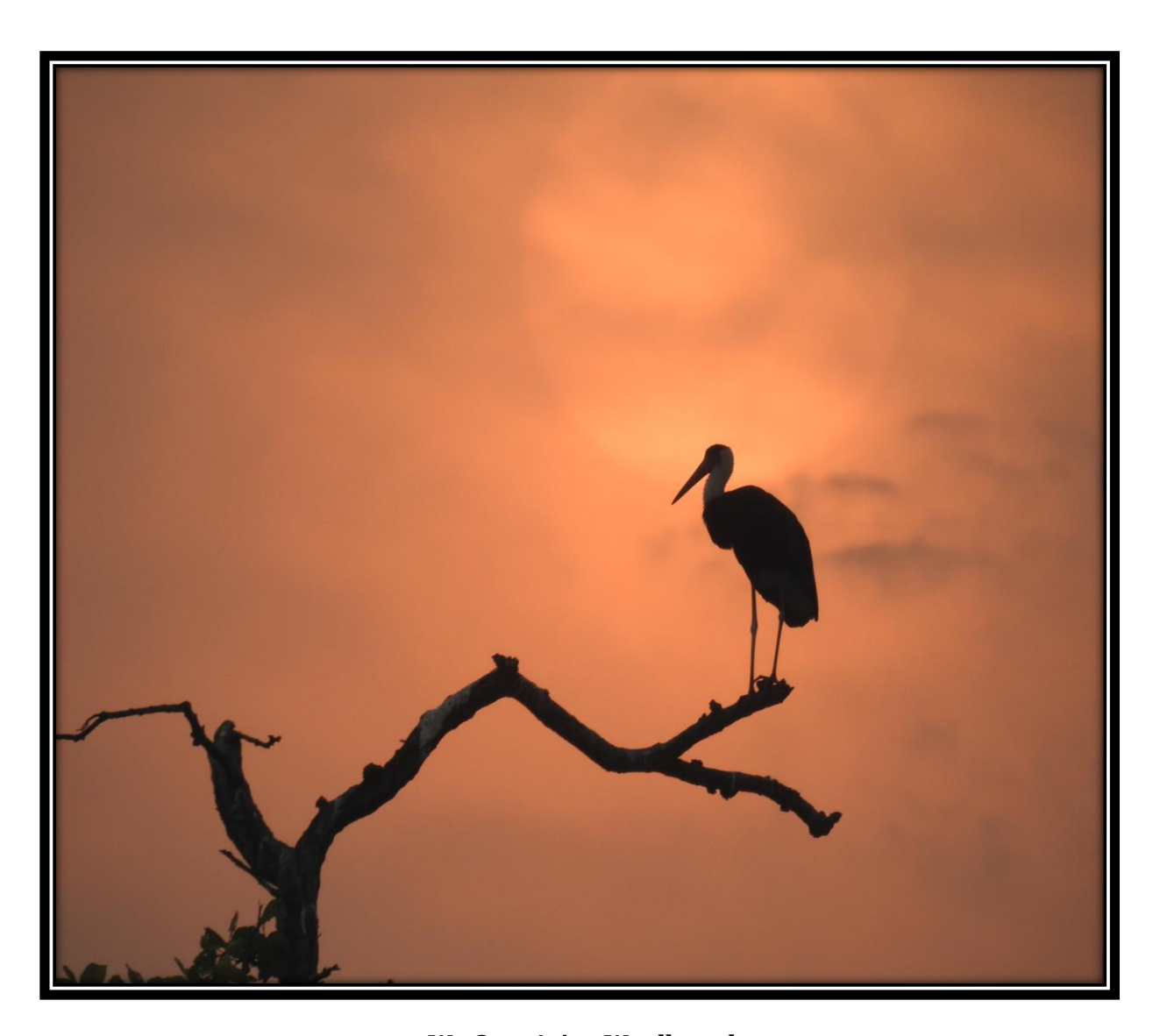
We Care Asian Woollyneck