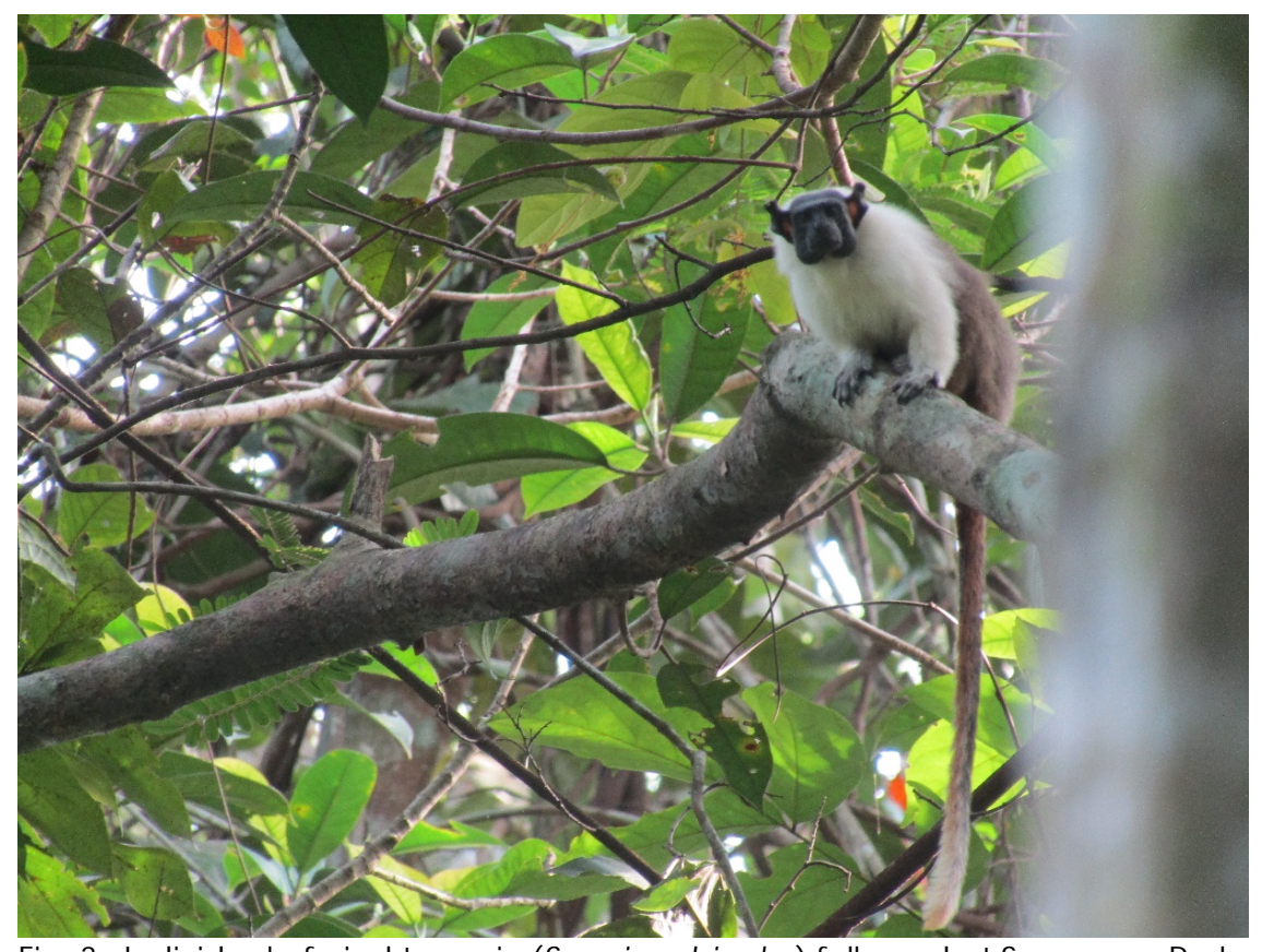
Fig. 3. Individual of pied tamarin (Saguinus bicolor) followed at Sumauma Park.