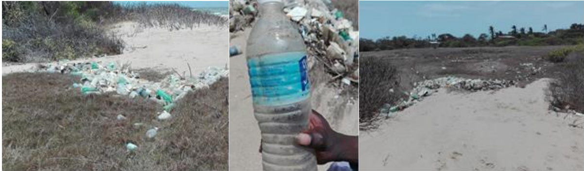
A bottle from Kerala India to Kalpitiya Sri Lanka