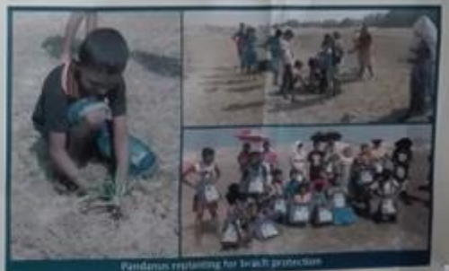
Pandanus replanting for beach protection