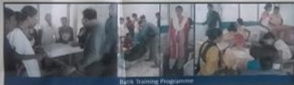
Basic Training Programme

The aims and objective of this programme is to encourage the fisher's families for the conservation of sea turtles and coastal biodiversity while continuing BCSL education and awareness programmes. However, it was identified that only awareness programmes not enough get the attention of the coastal communities. So we have initiated some welfare programme parallel to the awareness programmes in order to increase active participation of the communities.