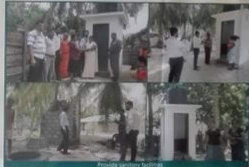
Provide sanitary facilities

Although many families having toilets still there are some families among fishers doesn't have proper toilet facilities. It is a big problem for the sanitary condition of the villages as well as it is badly affect to the environment and beauty of the nature in the area. So we have built 20 toilets for the needy fisher's families in the Kandakuliya village. Moreover, we have conducted Basic training programme for the ladies in the fisheries community. They can earn additional income for their day today living expenses by selling the Batik garments. While uplifting their living condition we are expecting their support for the sea turtle and coastal biodiversity conservation activities. Moreover, we have continued our awareness programmes for the fisheries community on sea turtle and coastal biodiversity conservation. Field activities such as beach cleaning and Pandanus (Creeper) replanting in the beach were conducted with the support of community members. The active participation of coastal communities for the conservation activities increased due to welfare programmes. When comparing their living conditions, actually welfare programmes are not bribes and just encouragement for the conservation.