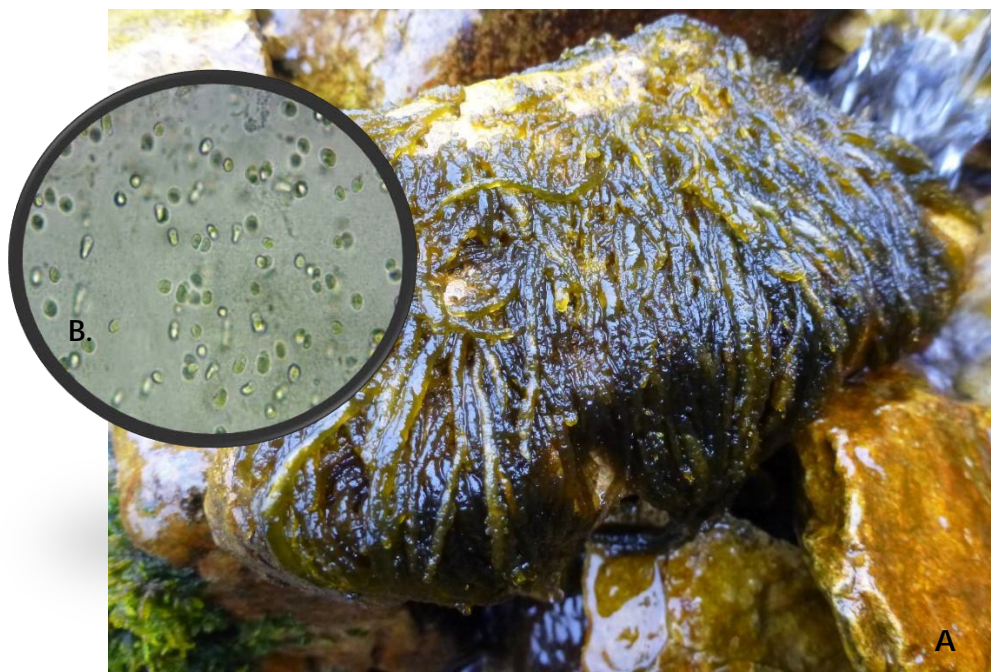
Fig. 8.A. Macroscopic and 8.B. microscopic appearance of a Hydrurus foetidus (Villars) Trevisan