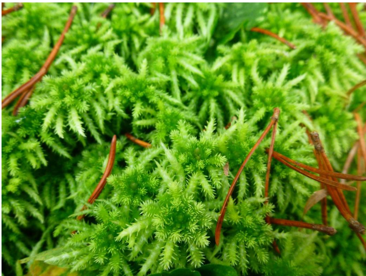
Fig. 9. Bryophyte from genus Sphagnum build peatland ecosystems on Vranica Mountain