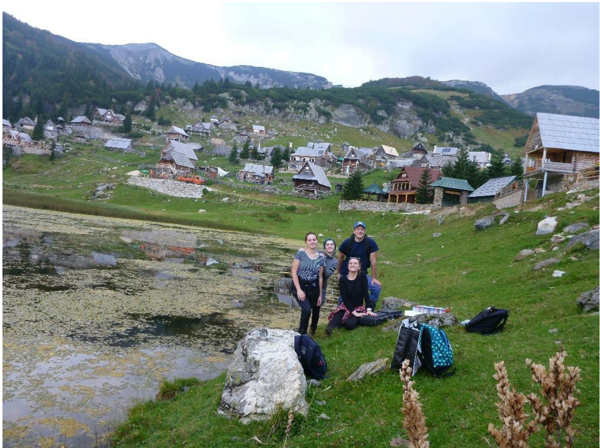
Fig 6. Second session of training of young researchers