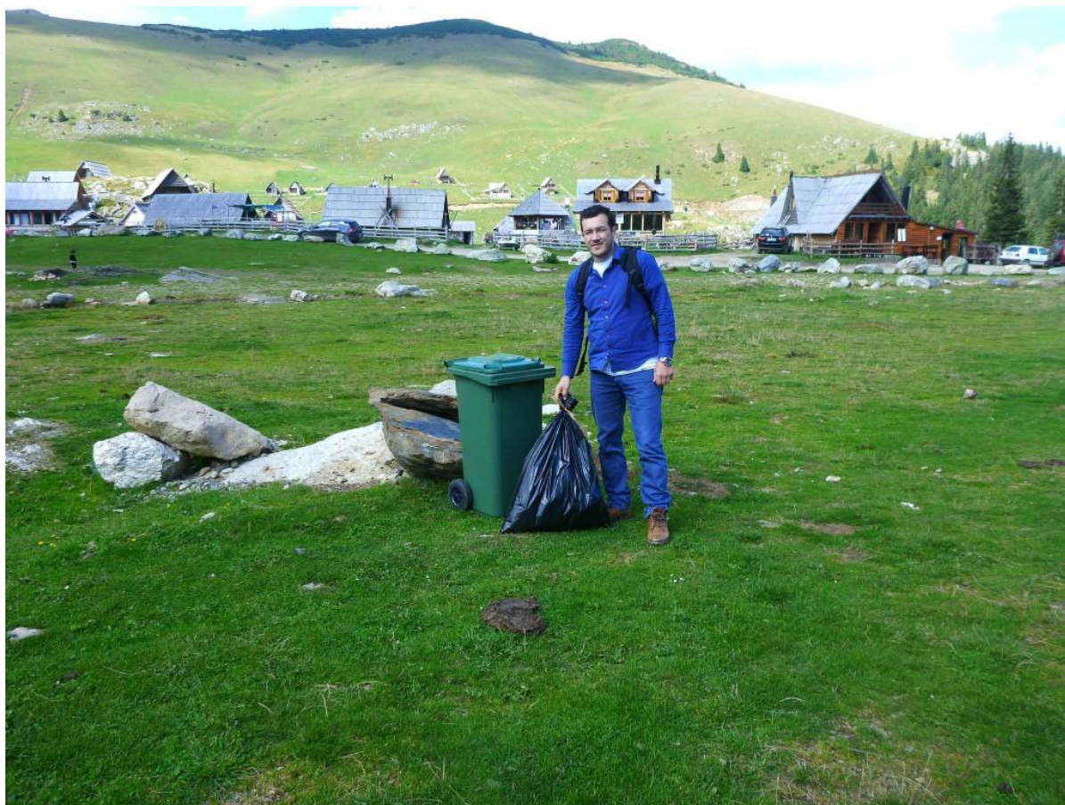
Fig. 4. Plastic and other types of waste were collected in the near of Prokosko Lake