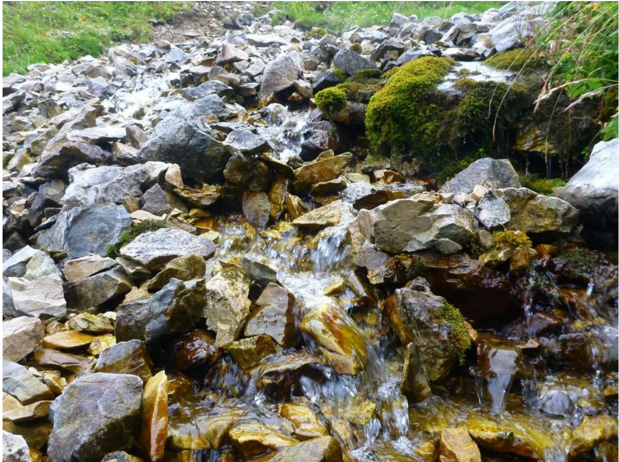
Fig. 7. Mountain spring as habitat a very rare algal species Hydrurus foetidus (Villars) Trevisan