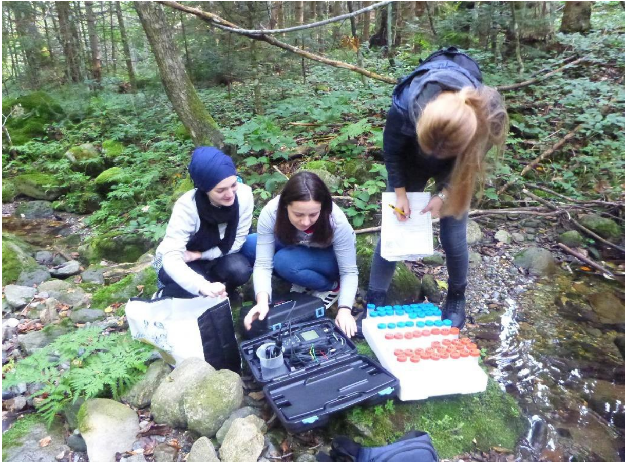
Fig. 5. Training of young researchers on the field