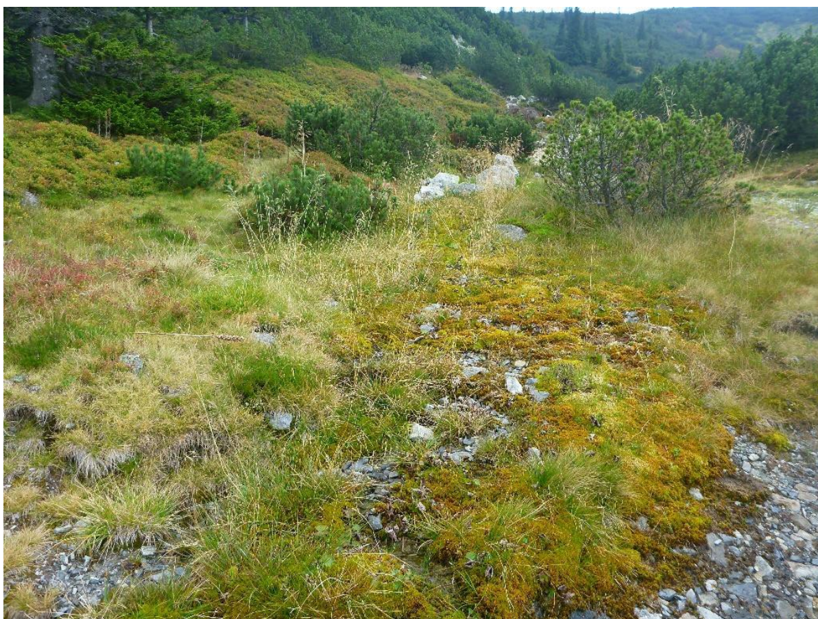
Fig. 10. Peatland ecosystems on Vranica Mountain