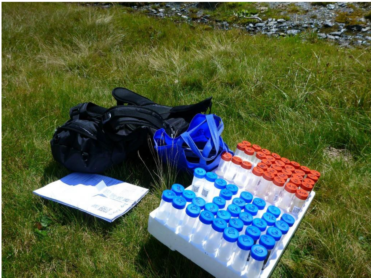
Fig. 2. Basic equipment for sampling of phytobenthos