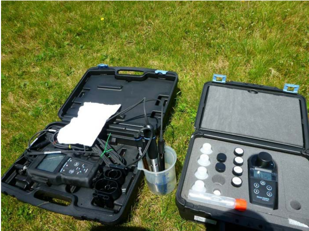
Fig. 1. Equipment (Portable multimeter - Orion Star A329 and Portable turbidimeter AQ3010)

Progress about our project is also available on ResearchGate.