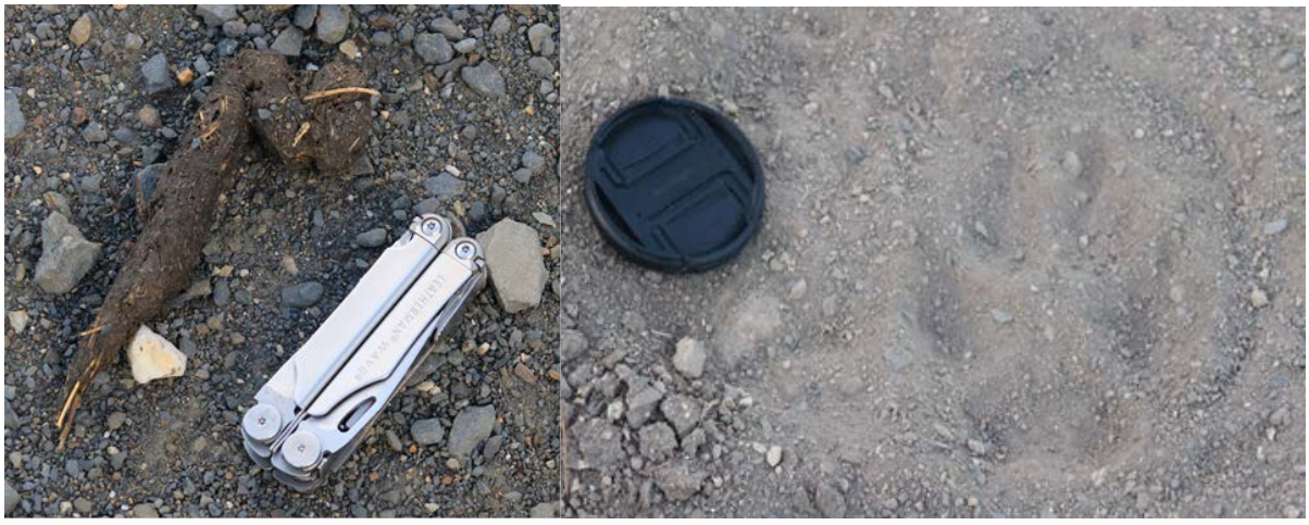
Fig 3: Shows the Himalayan wolf scat and pugmark assessed during the field visit in Annapurna Conservation Area

As shown in [Fig.3] , sign survey was the method used when there is absence of visual confirmation of the species and is a commonly used method for monitoring the large carnivores and determination of presence in the studied areas.