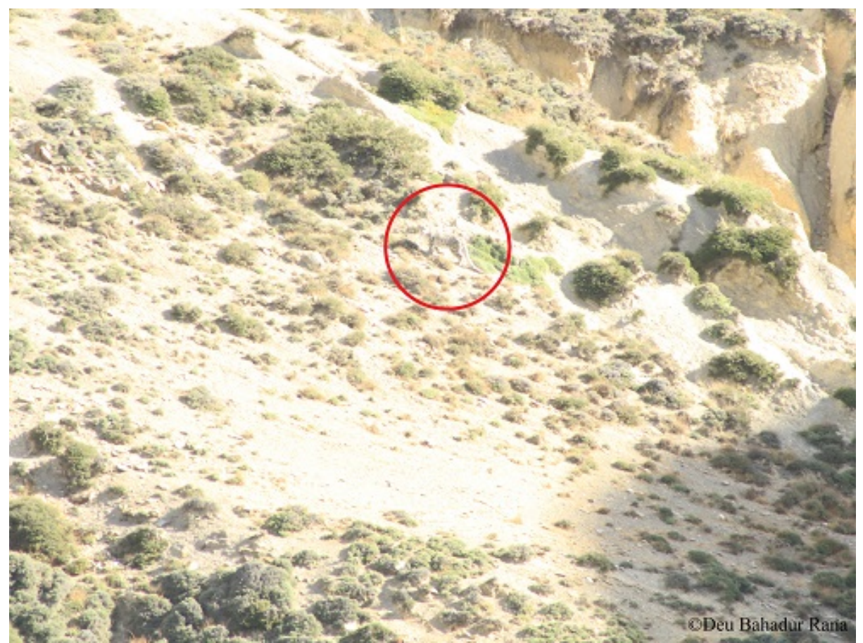
Fig 5: Photograph of Snow leopard (Uncia uncia) at 29007'47"; 840 09'25" nearby Samjhong village 30m distance to water resource, Annapurna Conservation Area, Nepal.

Considering on update till October, further field work and data analysis are yet to be done. Awareness campaigns for the students/ herdsmen are still on the process. After the initial analysis of field data, the key conflict areas will be identified based on which further field studies and awareness campaign will be conducted. All the occurrence location collected during the studies reveals that the existence of Himalayan wolf in the area. Furthermore, the data analysis on potential habitat of wolf and its occurrence will be assessed by Maximum Entropy (MAXENT) model.