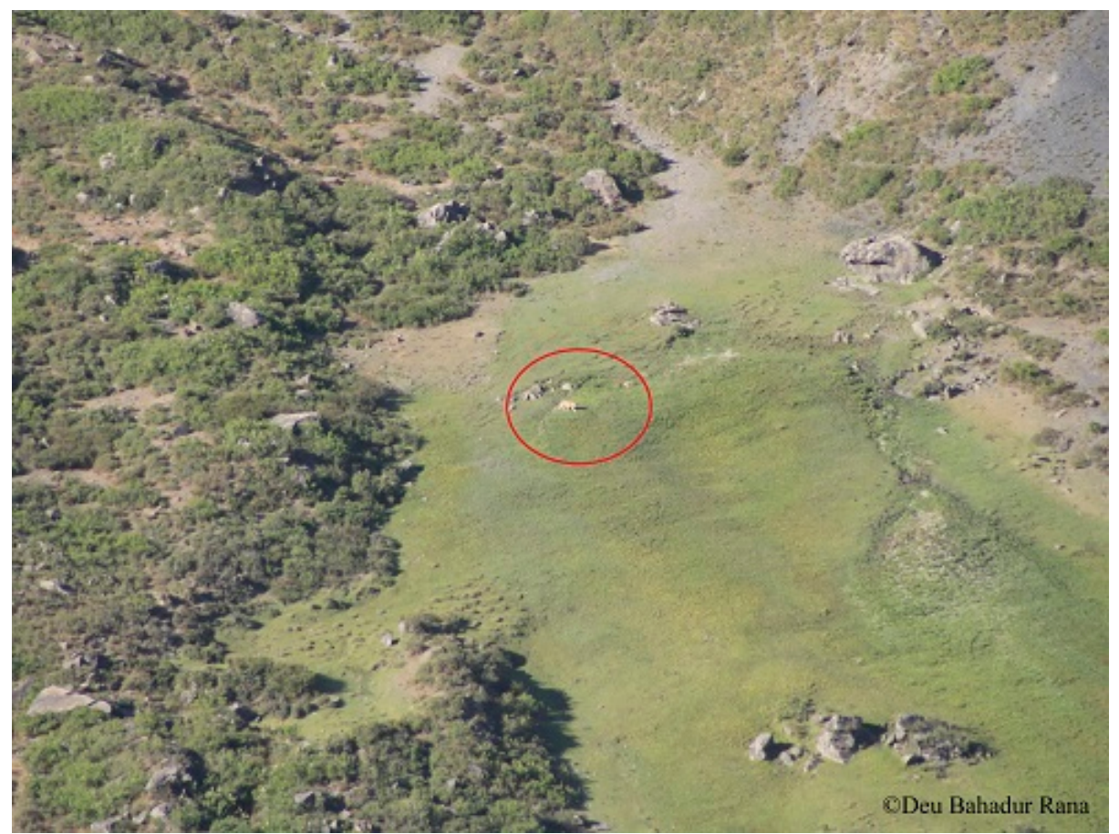
Fig 4: Himalayan wolf (Canis lupus chanco) sighted in Dhakmar, Upper Mustang, Annapurna Conservation Area, Nepal.

Livestock kill sites were mostly found in the flat undulating grassland in busy nature such as Carex spp , Kobresia spp with Caragana spp . Sibbaldianthe buifurca which are largely dominated respectively.