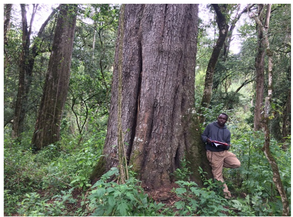
Recording of plant data in Masorta section of Kaptagat forest.

Some photographs from the fieldwork in Kaptagat forest (from 4th-9th April 2018)