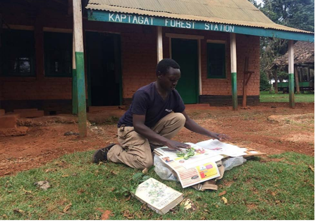
Pressing of collected plant samples for further identification and preservation.