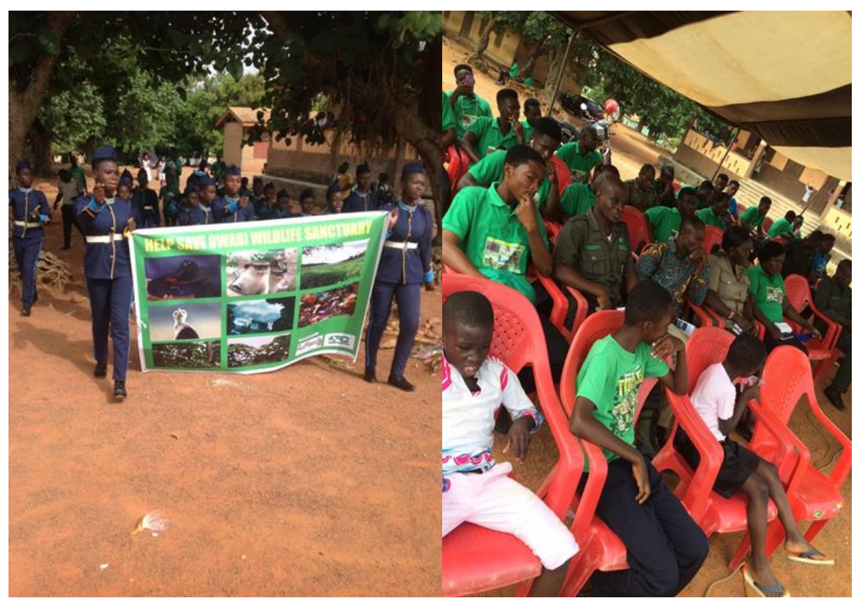
Left: Students floating in project communities to promote awareness. Right: Wildlife Division together with community members during education.