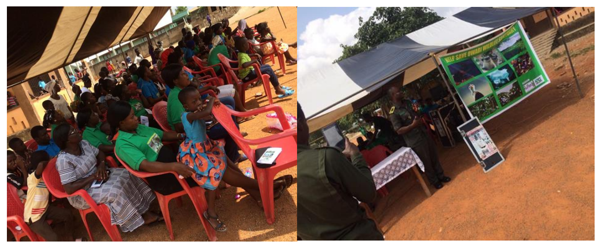
Left: Community members with Owabi T-shirts during education. Right: Wildlife Manager educating project communities about sustainability of the Sanctuary.