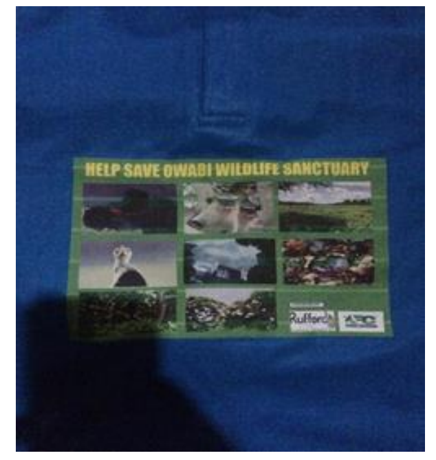
Left: Project T-shirt 1. Right: project T-shirt 2.