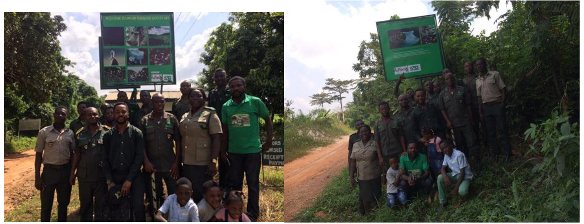
Left: Project team together with Wildlife Division launching sign post 1. Right: Project team together with Wildlife Division launching sign post 2

A more visualised information about the activities can be seen in the appendices below.