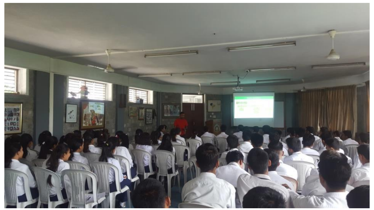
Vulture Conservation Awareness Program at SOS Herman Gmeinar School (Grade XII students)