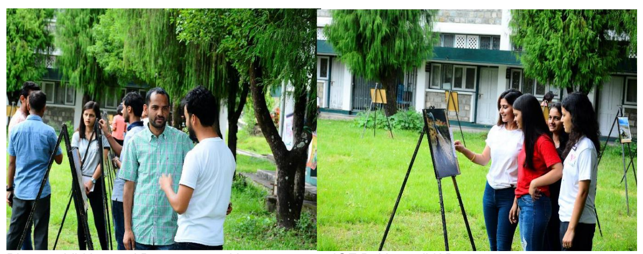
Photo exhibition and Poem competition program at IOF Pokhara, IVAD 2018