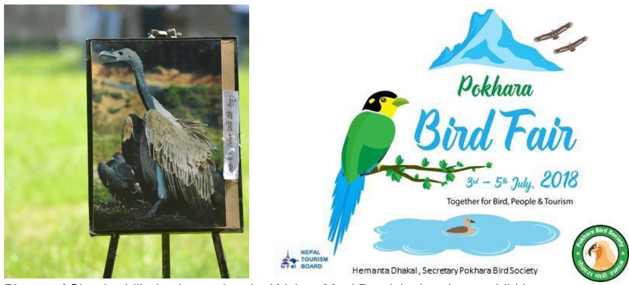
Picture of Slender-billed vulture in the photo exhibition

During the 1<sup>st</sup> Pokhara Bird Fair 2018, organized by Pokhara Bird Society, 45 pictures of birds in and around Pokhara including Slender-billed vulture and other vultures were framed and presented in Photo Exhibition of the program. The program was for 3 days. More than 3000 people (Students, Local people, government representatives, bird lovers and researchers) visited the photo exhibition program. There was poem competition also. Mr. Hemanta Dhakal (Me) was the master of ceremony in the program. I also presented a paper on status of birds (Vulture) in Pokhara valley.