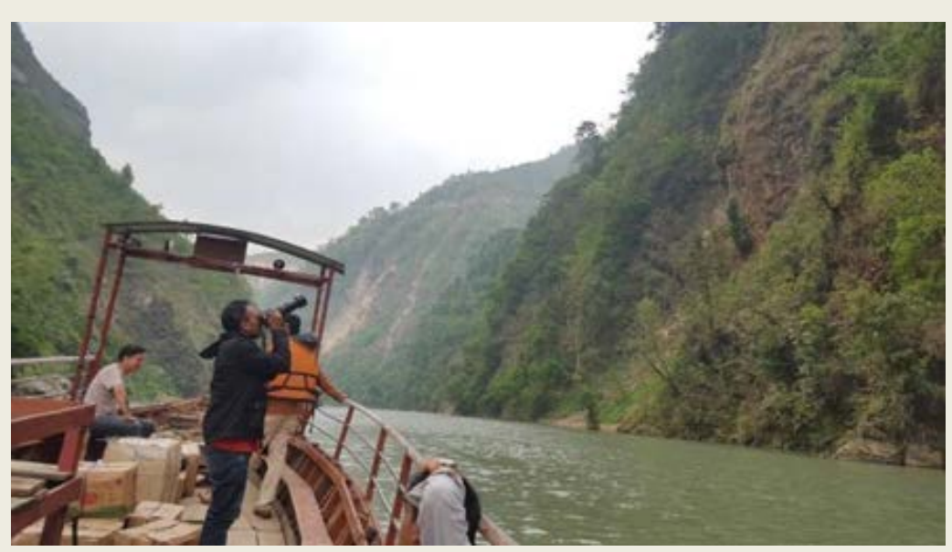
Figure 5: Palpa Visit

Strengthen and extension of Participatory Conservation of Critically Endangered Slender-billed Vulture Gyps tenuirostris in Western Mid-hills of Nepal.