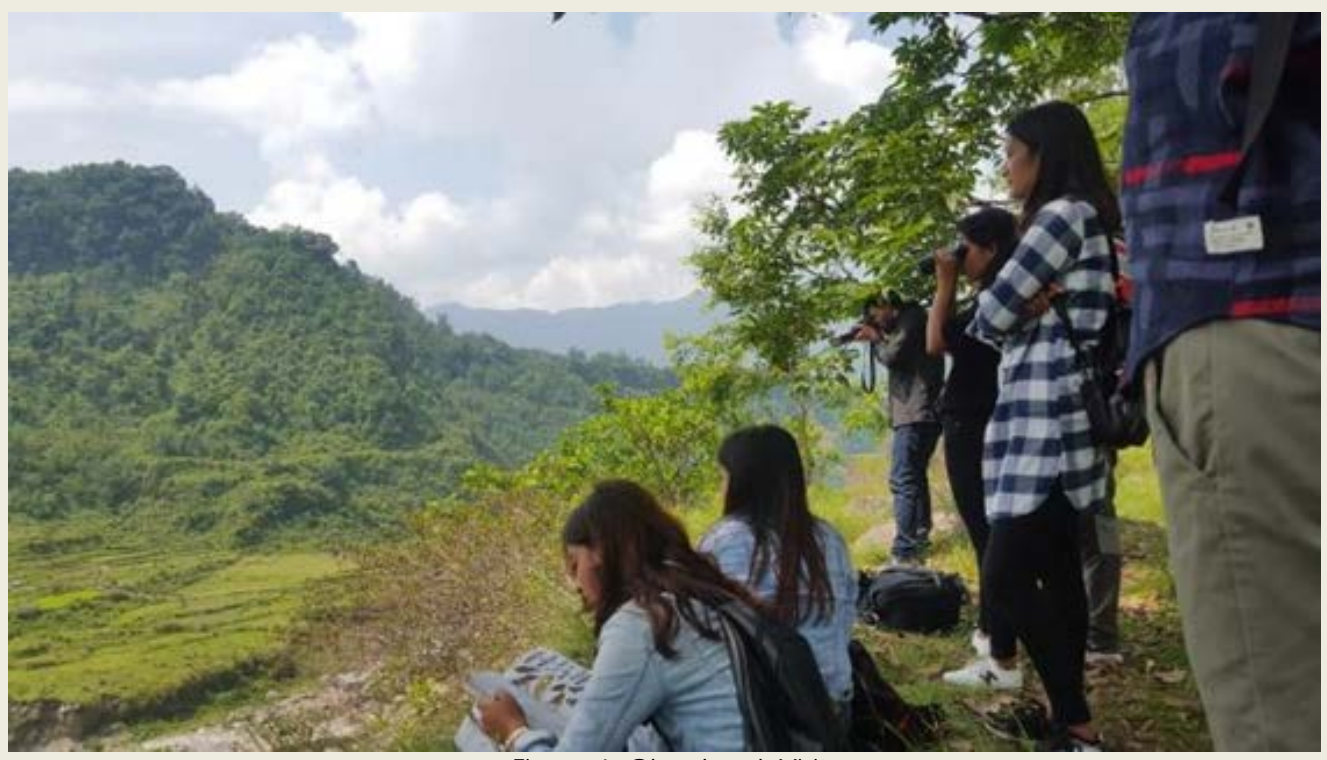
Figure 6: Ghachowk Visit

On 23<sup>rd</sup> June 2018 second visit was done for vulture movement monitoring and questionnaire survey. In second visit, 7 selected students from B.Sc. 2<sup>nd</sup> year Biology of Prithivi Narayan Campus and 3 experts from Pokhara Bird Society participated. Total 78 vultures of 6 species (Red headed, Slender-billed, White-rumped, Cinereous, Egyptian and Himalayan griffon) and 9 of them were SBV sighted during the carcass feed during the first visit.