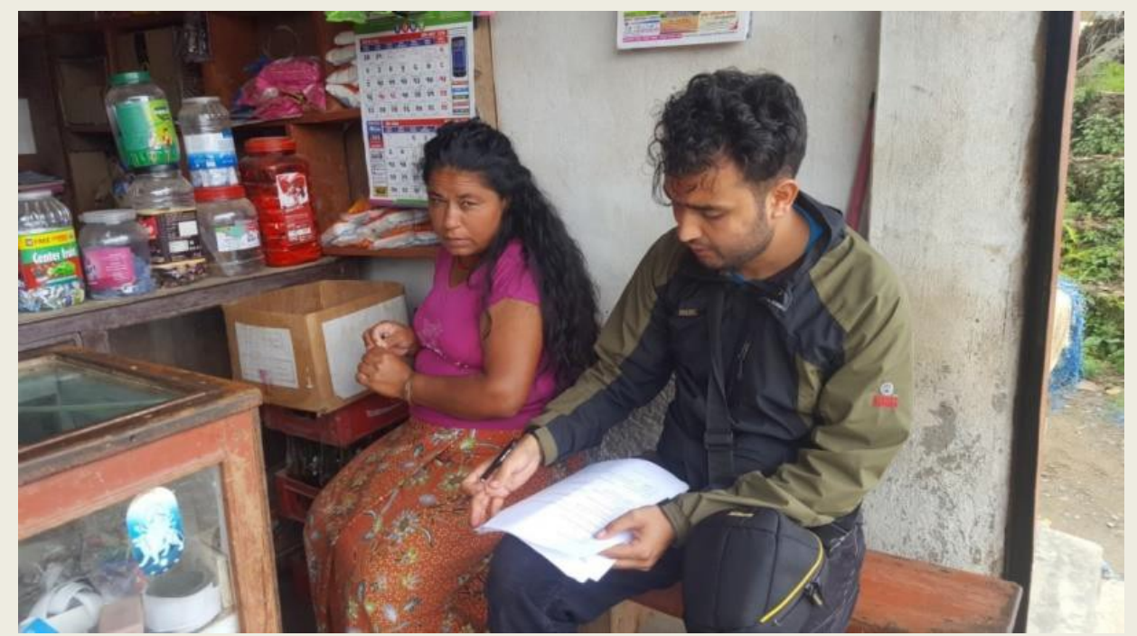
Figure 10: Questionnaire survey, Field assistant taking questionnaire survey at Lamagaun, Tanahau.