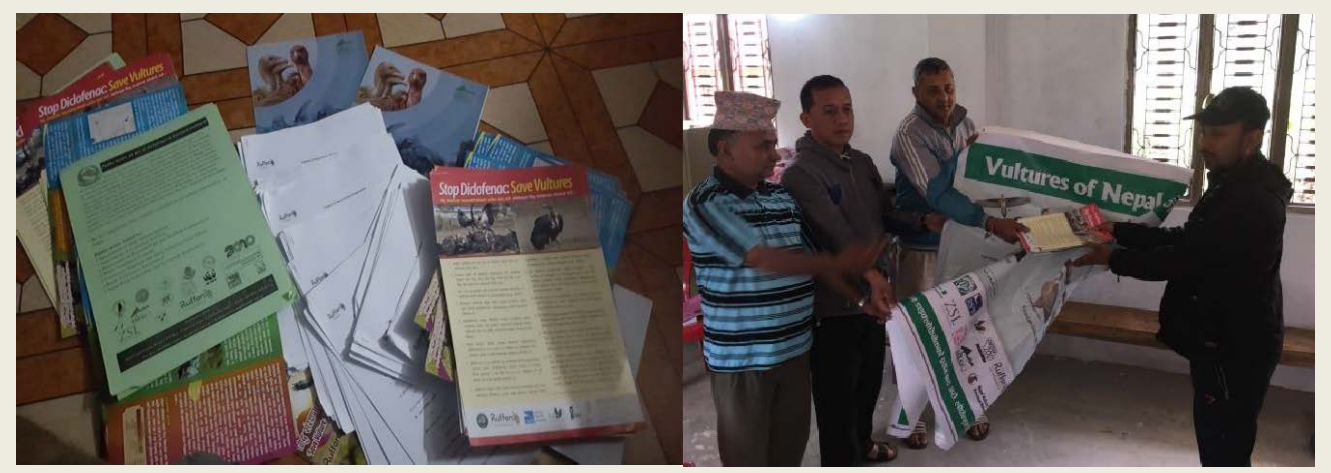
Figure 4: Vulture Conservation Awareness materials and free distribution of those materials.

During the visit we distributed 500 broachers, 200 leaflets, 10 posters and 2 flex prints, which included the information about vultures.