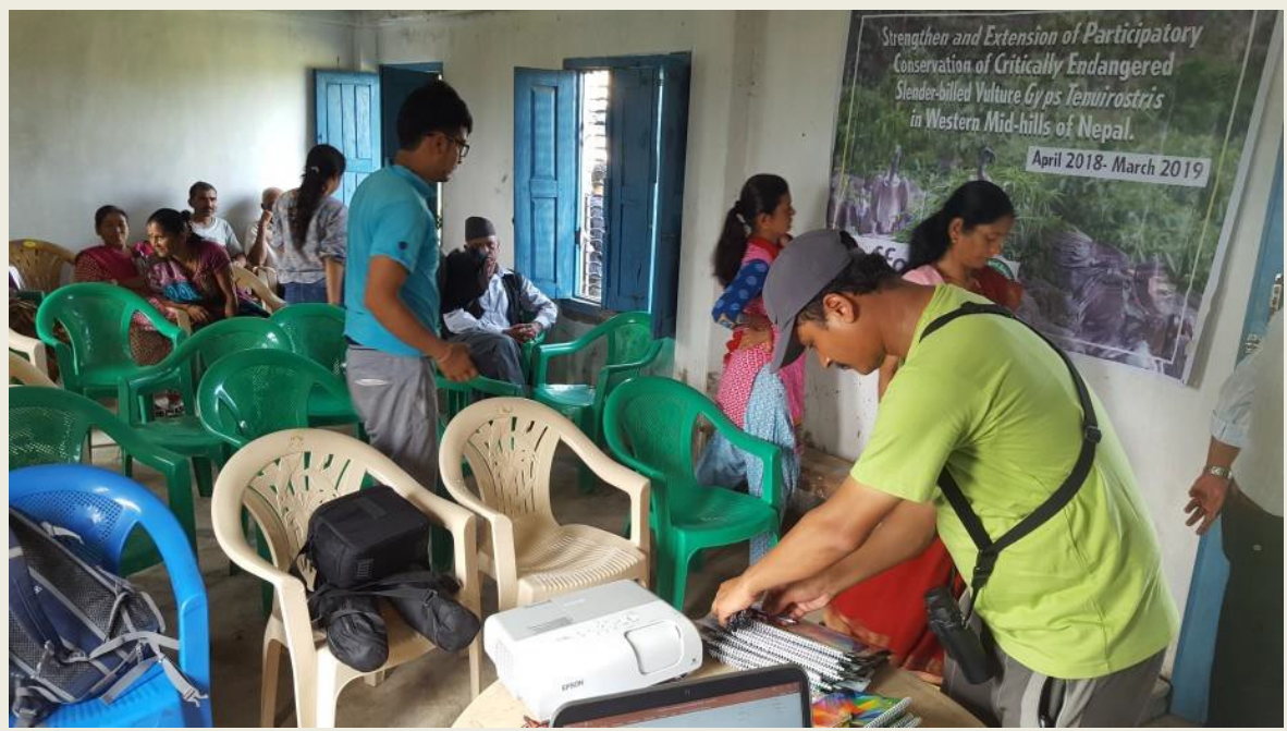
Figure 7: Vulture Conservation Awareness Camp at Baajhi Pokhari, Kaski.

Together with Institute of Forestry, Kaski, National Wildlife week was celebrated conducting a rally. During the program information regarding SBV was also presented in banners (Figure 8). Vulture Awareness camp was also conducted in Bhujrung Khola among school students.