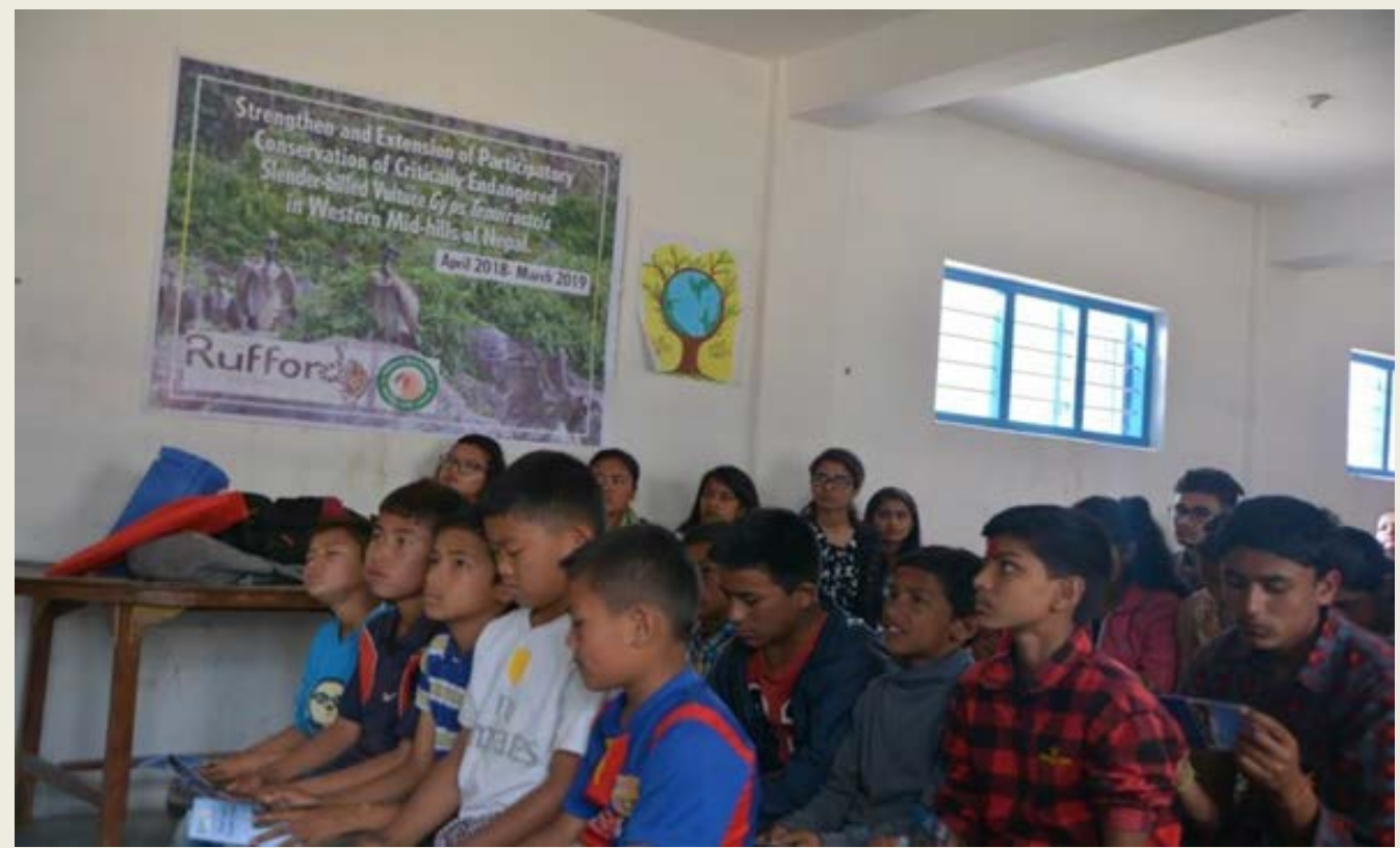
Figure 9: Vulture Awareness program during Wildlife week 2018 in Bhujrung Khola