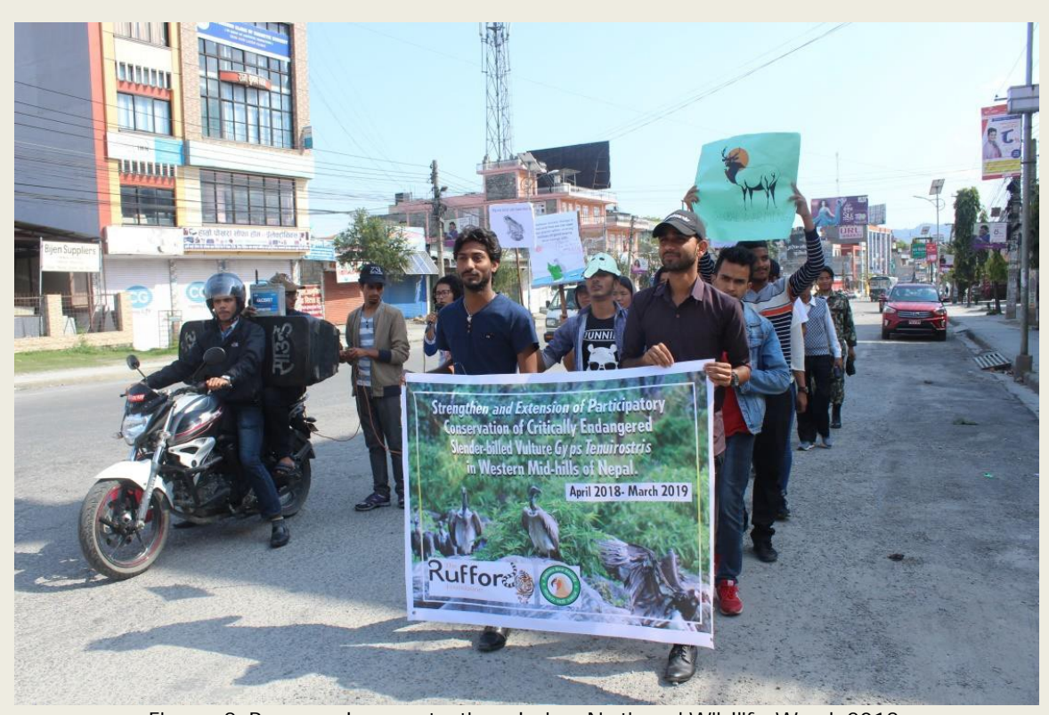
Figure 8: Banner demonstration during National Wildlife Week 2018.

Together with Institute of Forestry, Kaski, National Wildlife week was celebrated conducting a rally. During the program information regarding SBV was also presented in banners (Figure 8). Vulture Awareness camp was also conducted in Bhujrung Khola among school students.