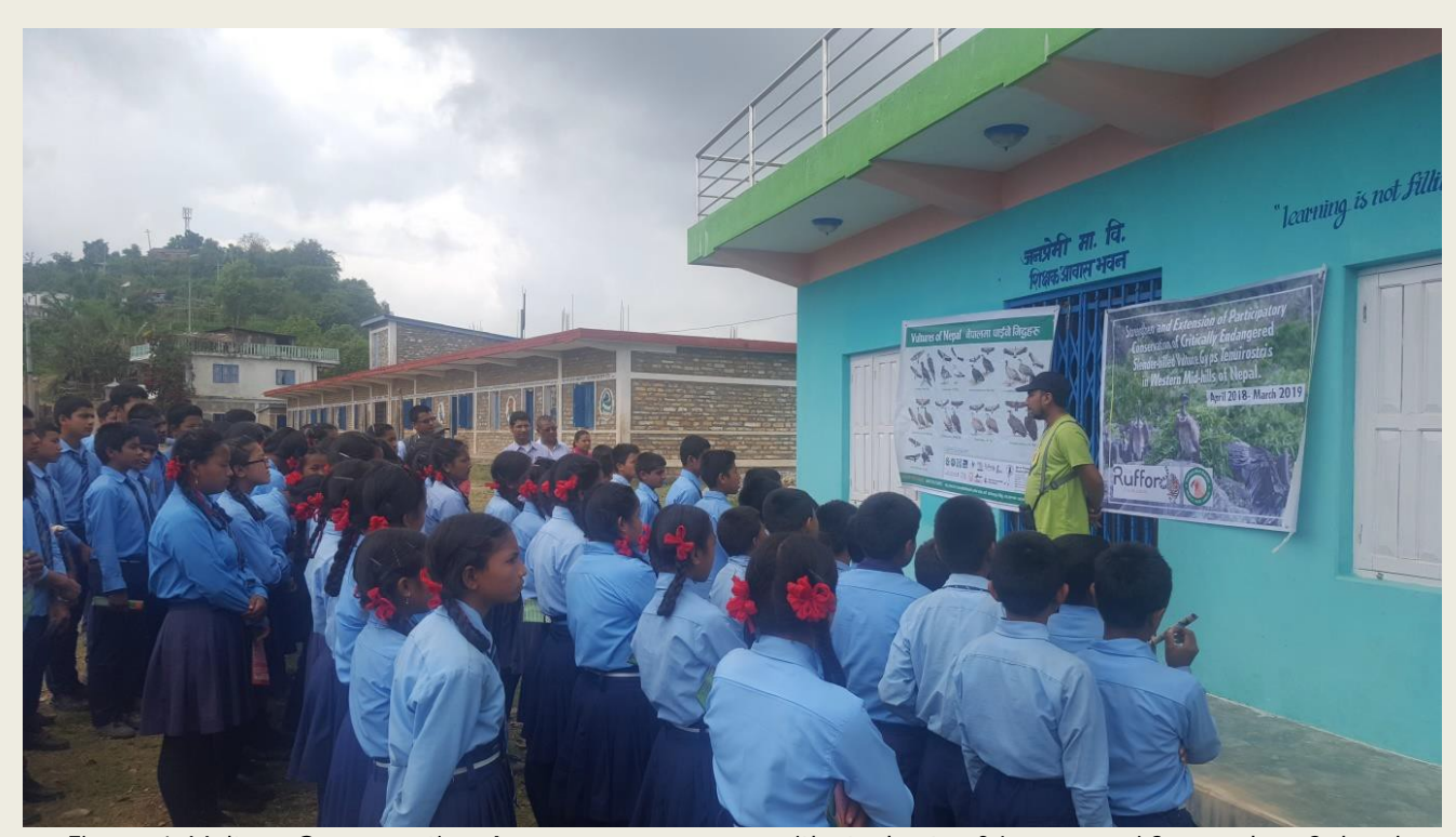
Figure 1: Vulture Conservation Awareness program with students of Janapremi Secondary School, Tanahu.