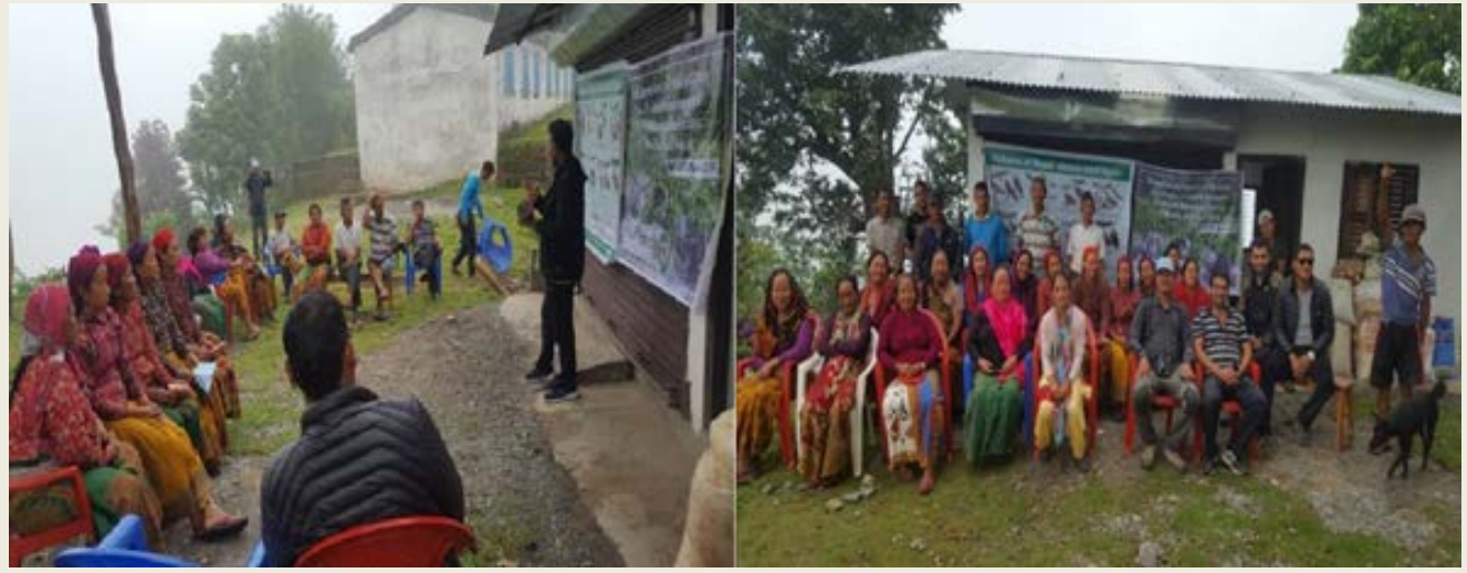
Figure 2: Program at Rajasthal,