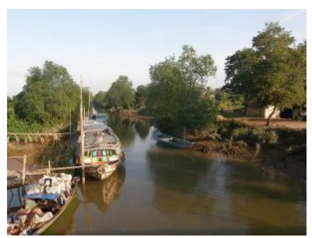
Condition of river in the settlement