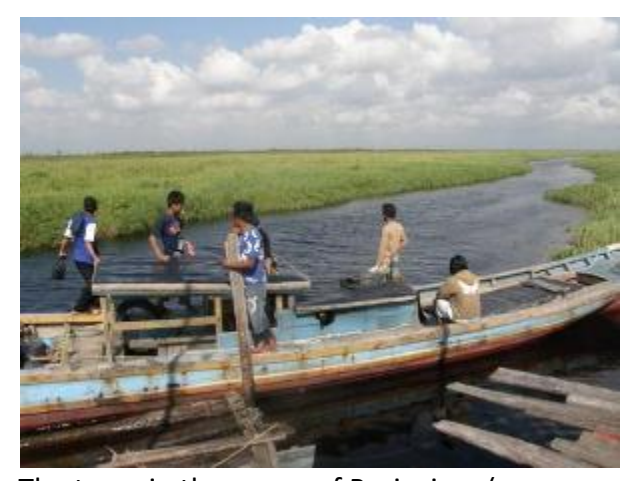
The team in the upper of Pasir river (a freshwater habitat)