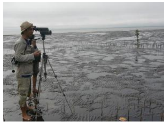
The team when Observing & counting Milky stork in the Tanjung (bay) Carat