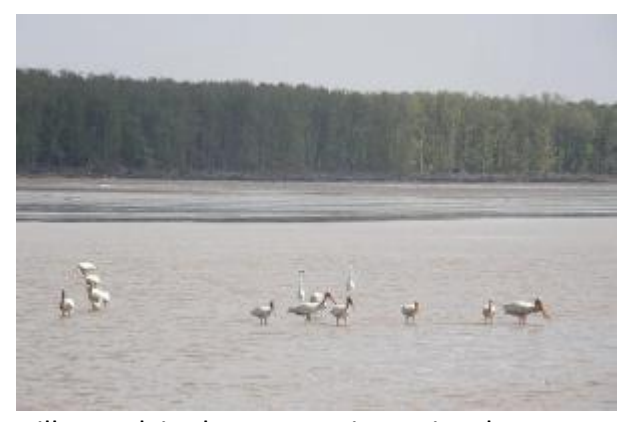
Milky stork in the Banyuasin peninsular