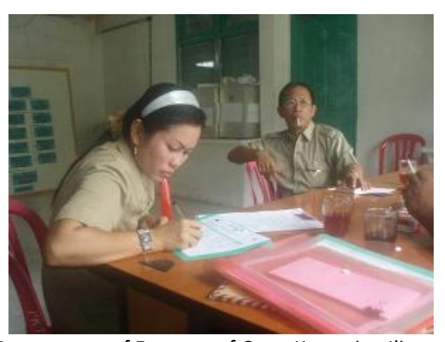
Office and some staffs of organization of Department of Forestry of Ogan Komering Ilir District