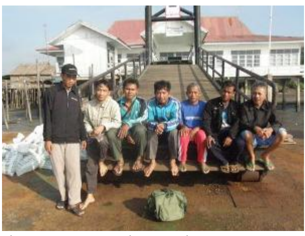
The project team when conducting survey in Sembilang and adjacent waters (without in the Applicant)