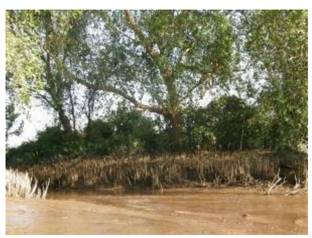
Mangrove type near Upang with Pneumatophor root