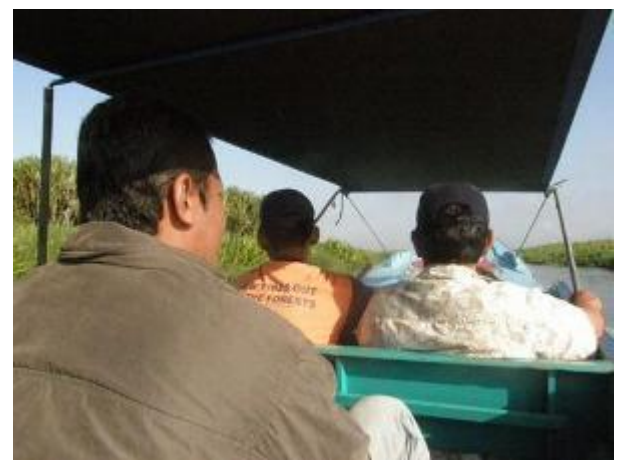
Searching breeding colony of Milky stork in Simpang Tiga

- Based on information from local people, we also visiting a location in the East coastal of Ogan Komering Ilir namely Simpang Tiga village. Unfortunately, we failed to discover breeding colony. A Milky stork was observed as bird keeping in a home of Simpang Tiga village, but this bird said by the owner bought from Sungai Kuala 12 (not from Simpang Tiga).