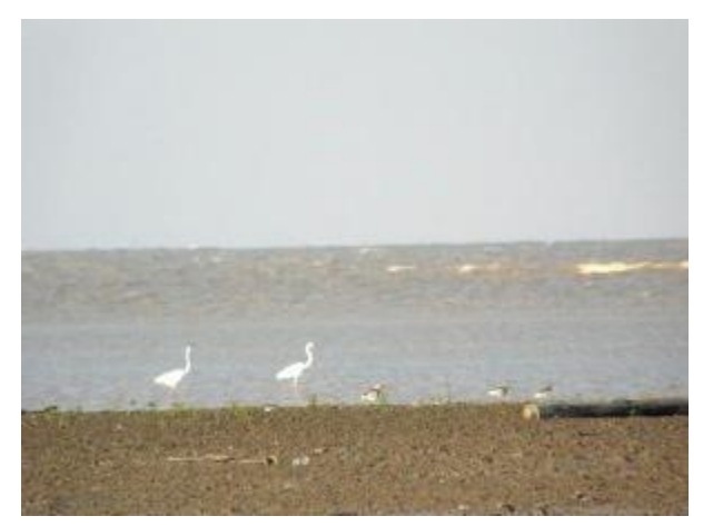
The mudflat of Pasir river

Conducting a survey for searching population and breeding colony of Milky stork in Pasir river.