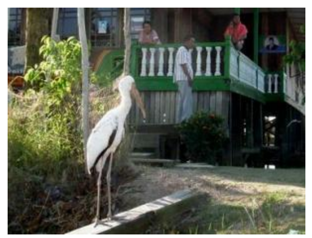
A Milky stork as bird keeping in Simpang Tiga