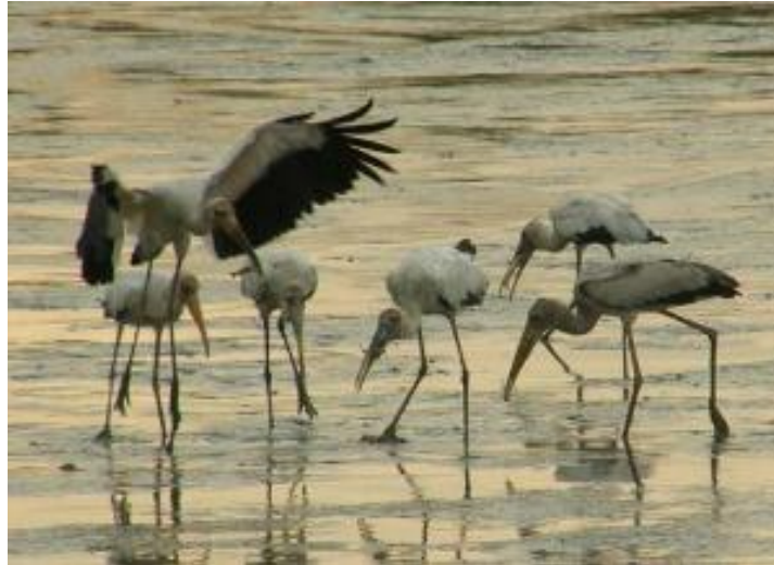
Figure 27. A flock of Milky stork feed catfishes together.