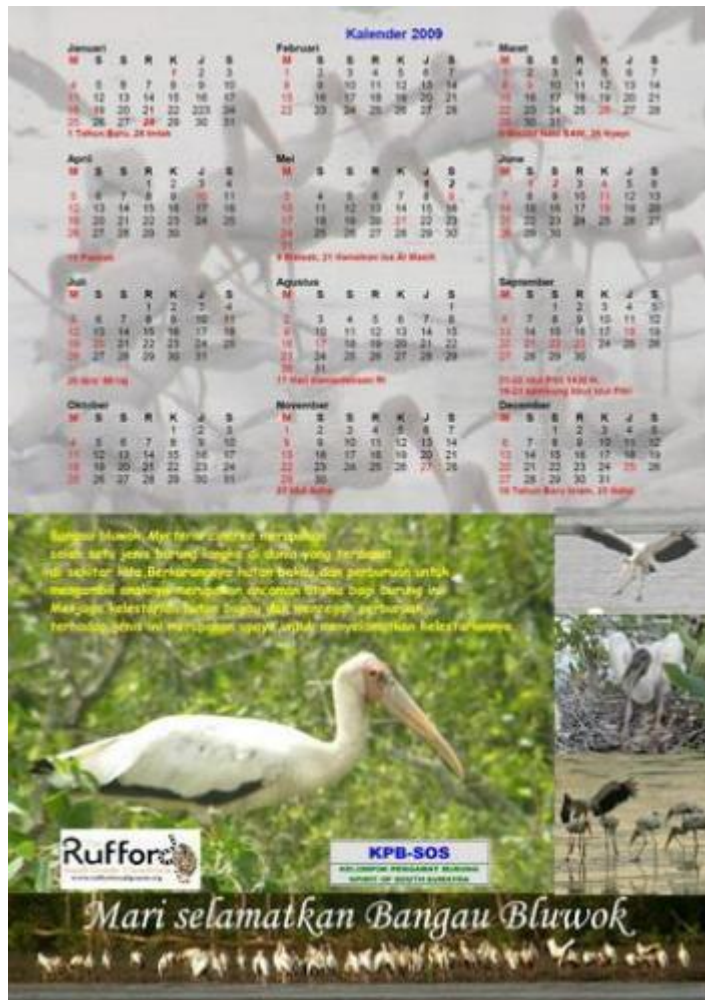
Appendix 1. Campaign calendar about conservation of Milky stork.