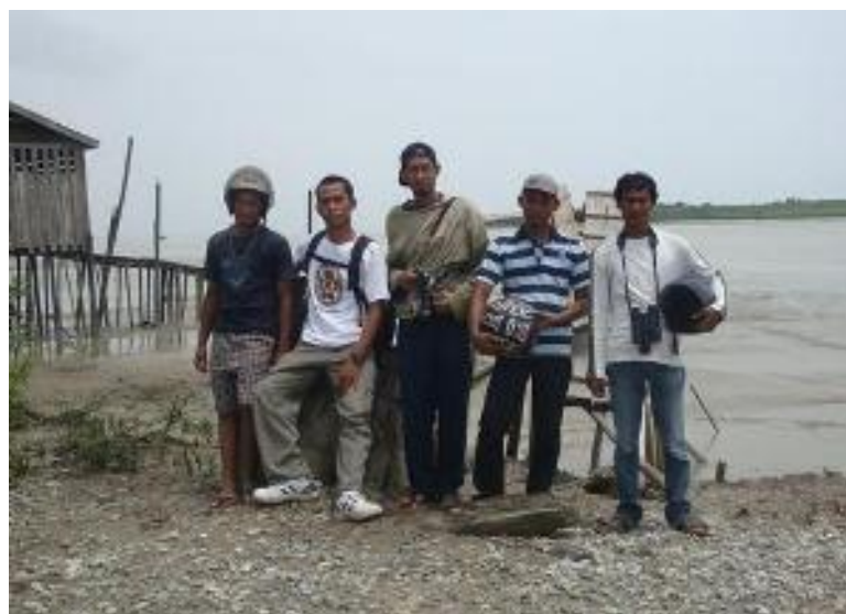
Figure 4. The fieldwork team in Sinaboi (Riau).