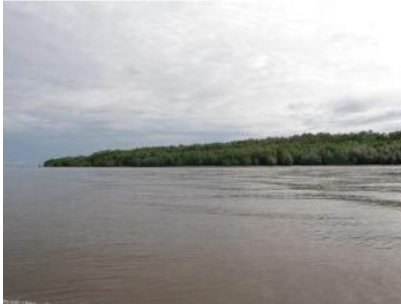
Figure 19. Tanjung Jumpul North Sumatra province on 3 January 2008.

foot for 4 hours from the coast. These might be identical with the ones reported by Danielsen et al. (1991). In 2001, Wetlands International Indonesia Programme searched for Milky Stork breeding sites in the Banyuasin peninsula, South Sumatra, without success (Goenner & Hasudungan 2001).