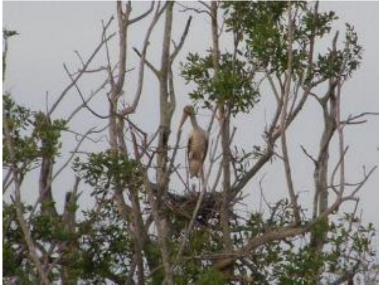
Figure 13. A nest built more than 10 m up with adult and a single chick.