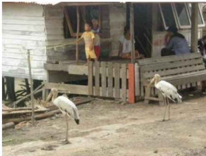
Figure 28. Two young Milky storks collected from a breeding colony kept as pet in Simpang PU, South Sumatra.

In Aceh, although there was no report on breeding colony of Milky stork but local people from two localities reported that they shoot the birds when they found this birds. For them, Milky stork is a preferred bird for consumed among other waterbirds. Conducting a campaign and support local stakeholders to implemented law inforcement to the hunters are urgently needed.