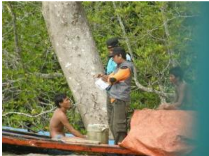
Figure 39. As possible, through our local counterpart, we warning and give ultimatum to people who conducting illegal logging in protected area.