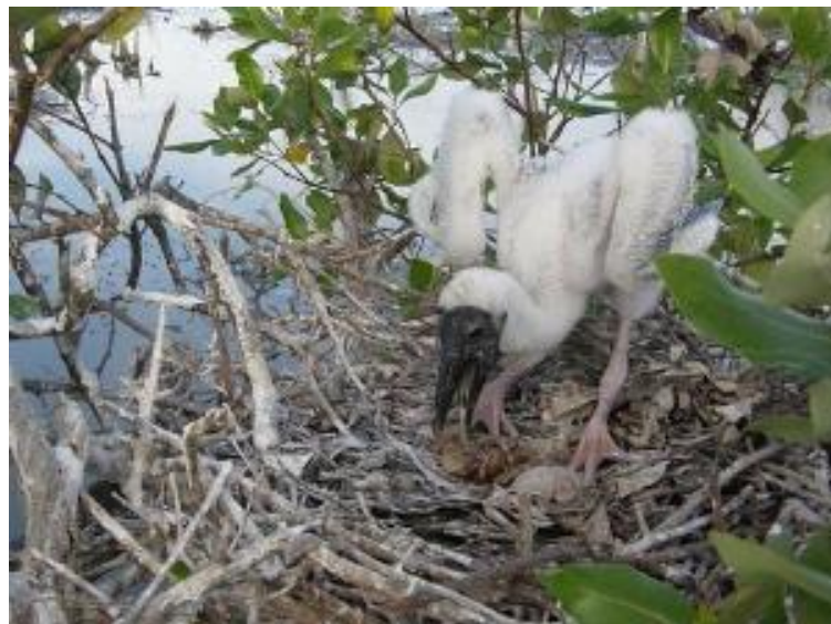
Figure 14. Nest with single chick approximately 20–25 days old and an unhatched egg.