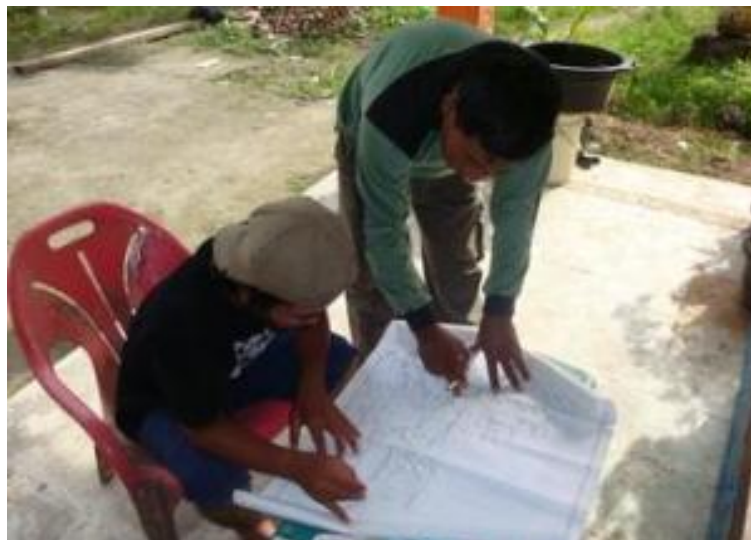
Figure 9. Preparing an effective survey with the head of Karang Gading Langkat Timur Nature Reserve, North Sumatra.