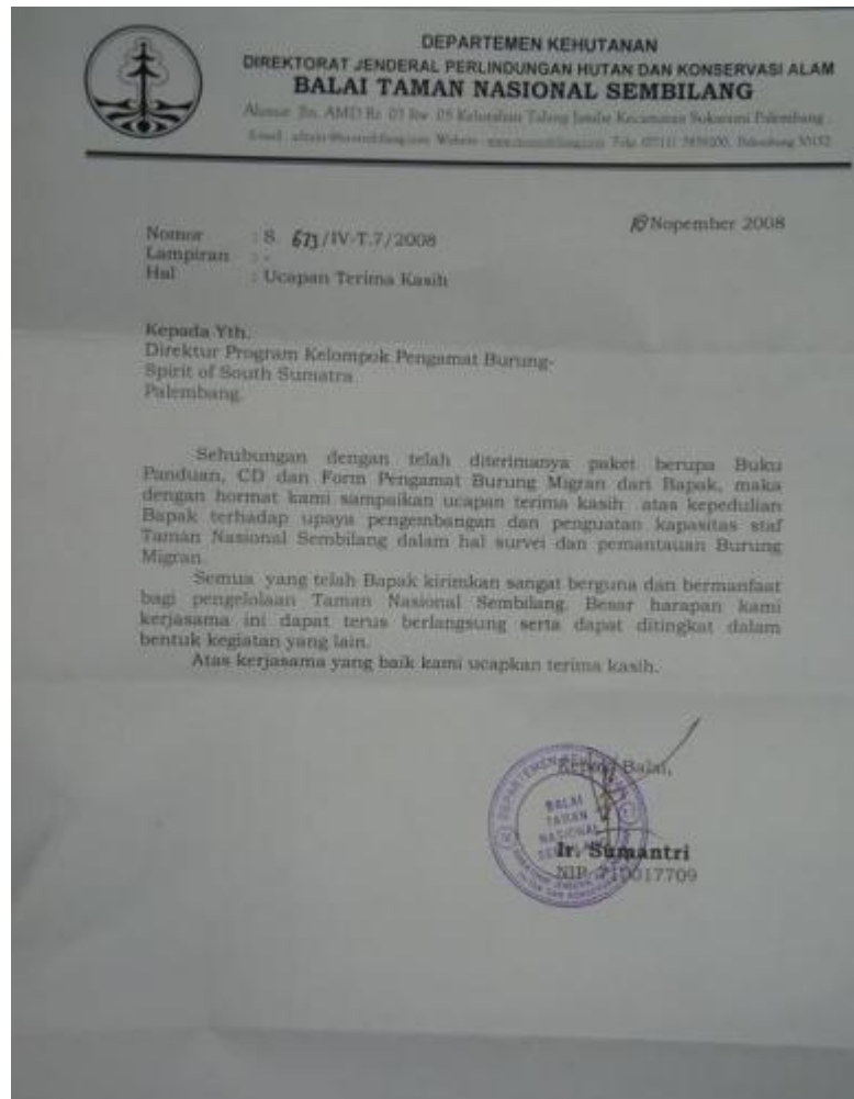
Figure 35. Acknowledgement letter for project team from Sembilang National Park office.