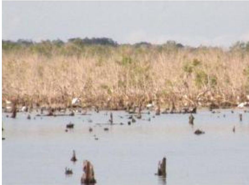
Figure 11. The Kumpai colony, located in open mangrove backswamps 6–7 km from the coast with mostly dead trees within a flooded area, June 2008.

dendrophylla and Brahminy Kite Haliastur indus . At Pulau Kelumpang, Malaysia, although there were no direct observations of eggs or young, it was reported that Brahminy Kites were disturbing the nesting Milky Stork and that monitor lizard and common palm civet Paradoxurus hermaphroditus were other potential predators and may have contributed to the zero survival rate (Li et al. 2006).