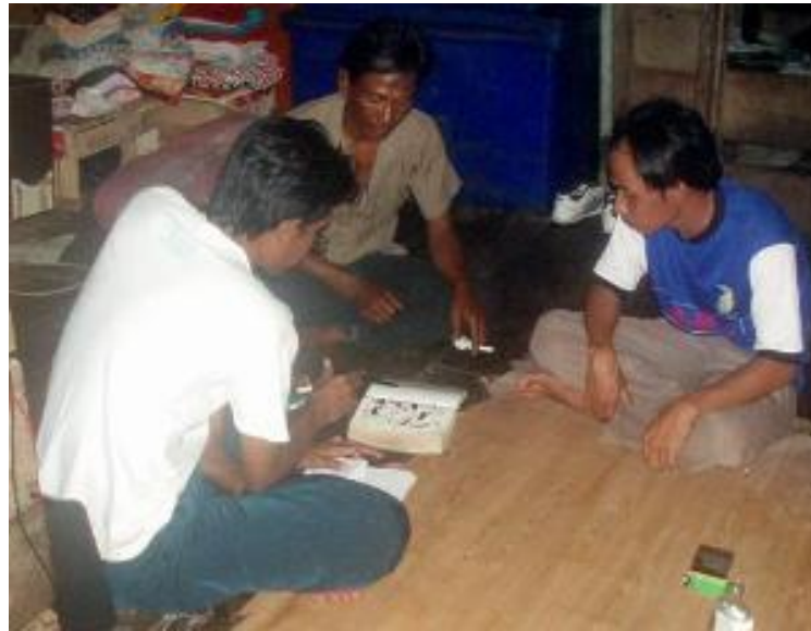
Figure 8. Local people is main source for exploring local knowledge of Milky stork.

Based on interviewee with local people, the main threats to the survival of the species are human disturbance and hunting. In Aceh, it is reported that Milky stork was shoot by local people in Lhokseumawe and Kuala Raja. In all potential remaining breeding sites of Milky stork were reported in Sumatra, Milky Stork was became a common caught bird by local people and they took care the bird as a cage bird. When the young bird grew up and flew, most of birds returned again to the people who took care them. Local people used to collect young bird from the nest where the bird breeds. The phenomenons were similar in all reported breeding areas of Milky stork in North Sumatra, Riau and South Sumatra. If they caught the bird, sometime they sold the young bird or took care the bird as bird cage. The Milky Stork as not sold as fresh meat or cooked meat, but people sold the bird in live condition. The price of young bird ranged between Rp 25.000-30.000 ( \pm $2,5-3).