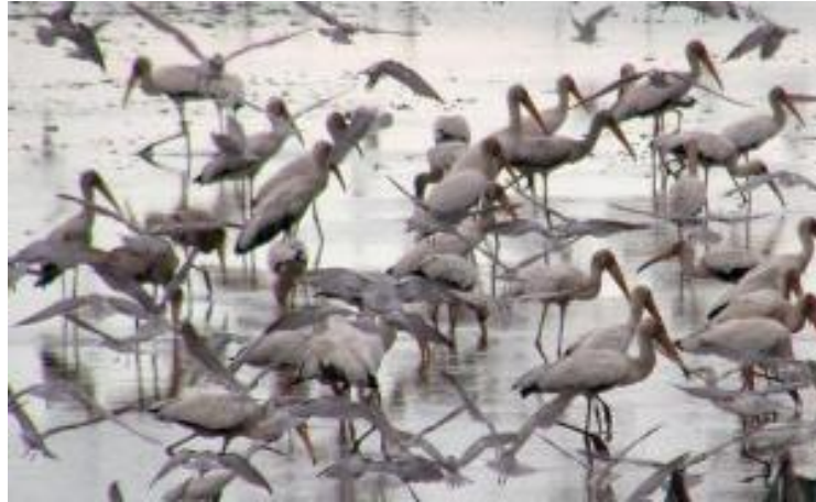
Figure 23. Flocks of Milky stork feed with young Milky stork but adult Milky stork was dominated.