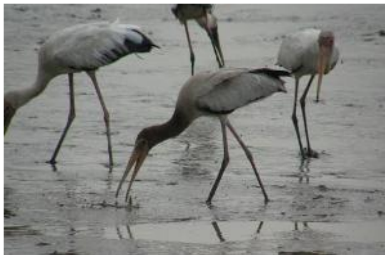
Figure 25. An individual Milky stork feed a catfishes