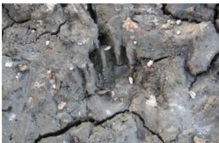
Figure 18. The track of a monitor lizard at the site, a potential predator of young Milky Stork.