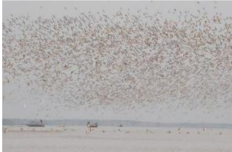
Figure 29. Shorebird migration in Sembilang National Park.