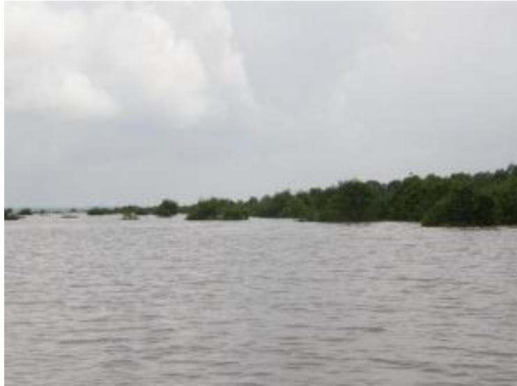
Figure 21. Kuala Puntian South Sumatra province on 2 November 2008.