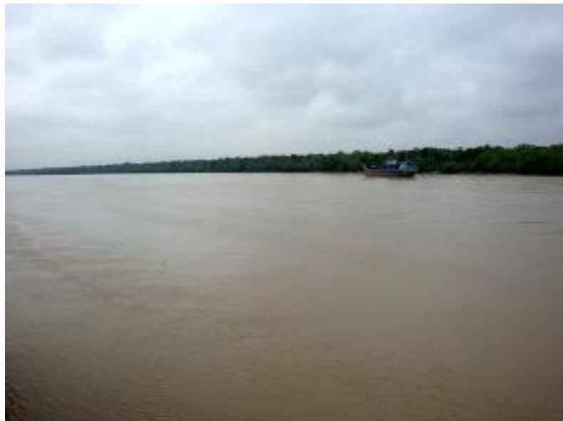
Figure 20. Pulau Berkey Riau province on 26 March 2009.