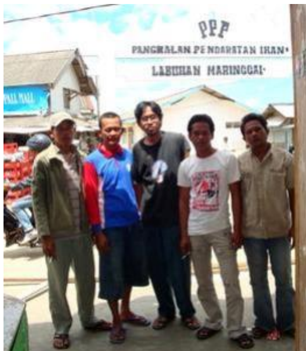
Figure 7. The fieldwork team in Labuhan Maringgai (Lampung province) on November 2008.