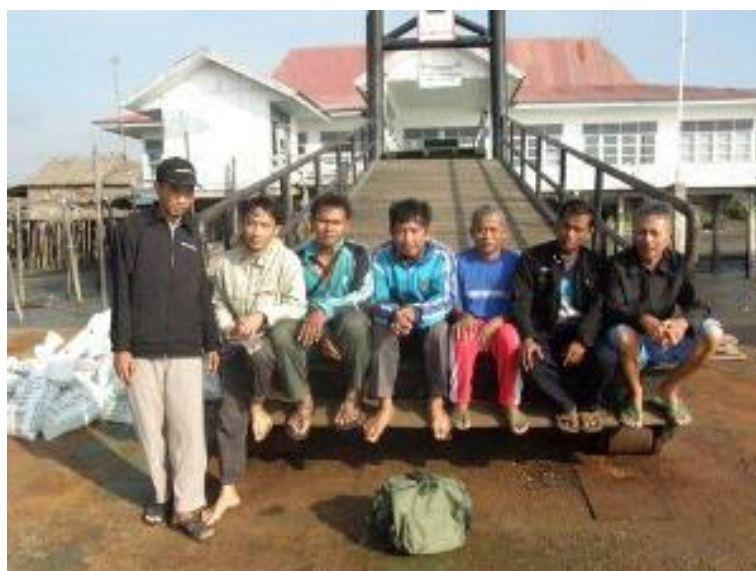
Figure 6. The fieldwork team in Sembilang National Park office on July 2008.