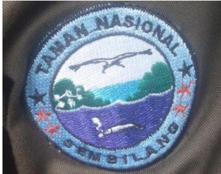
Figure 33. Logos of Sembilang National Park, with a Milky stork flying.