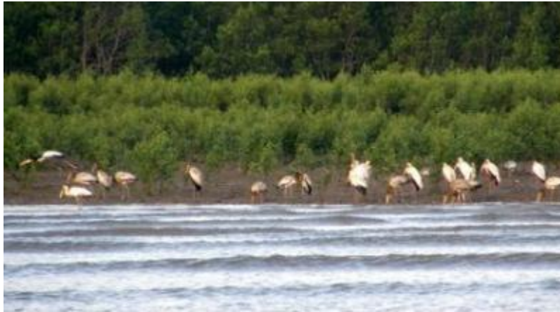
Figure 24. Flocks of Milky stork which dominated by young Milky stork.