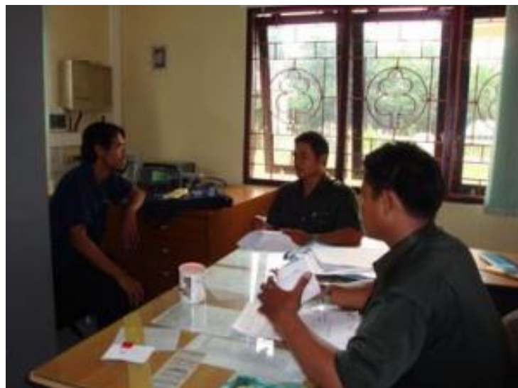
Figure 10. Exploring local knowledge of Milky stork from local field staffs of Department of forestry.