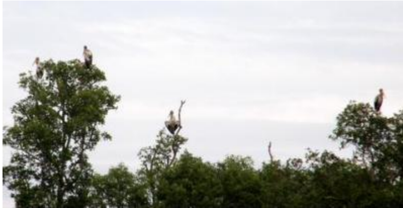
Figure 26. Young Milky storks were observed resting at mangrove trees in Lumpur river