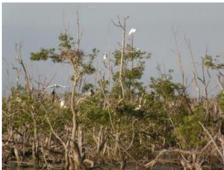
Figure 17. Other nesting waterbirds are Great Egret, Intermediate Egret, Little Egret and Little Cormorant.