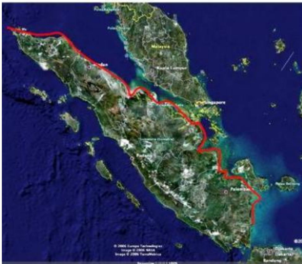
Figure 1. Map of Sumatra and survey areas covered in the east coastal of Sumatra (showing by red line).

The east coastal of Sumatra is located in the eastern coast of Sumatra Island, Indonesia. Administratively, the area located at six provinces Aceh, North Sumatra, Riau, Jambi, South Sumatra and Lampung. The east coastal of Sumatra mainly comprising mangrove forest. The main covering survey areas can see in Figure 1.