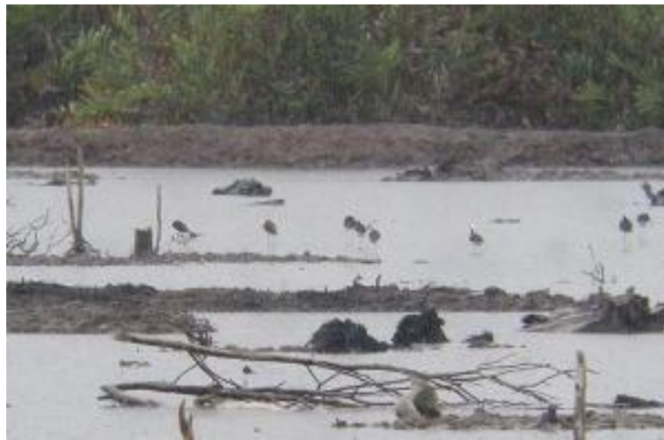
Figure 30. Mature and immature White-headed Stilt.