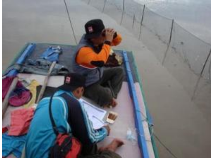
Figure 38. Transfer skill and sharing knowledge with Department of forestry and nature conservation.