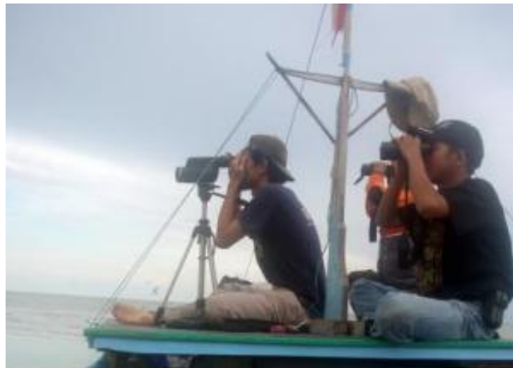
Figure 37. Skill transfer and sharing our knowledge with local people and student from University