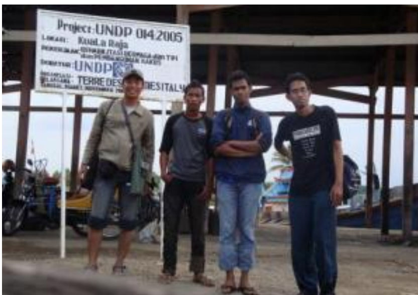
Figure 3. The fieldwork team in the boat terminal of Kuala Raja, Aceh.