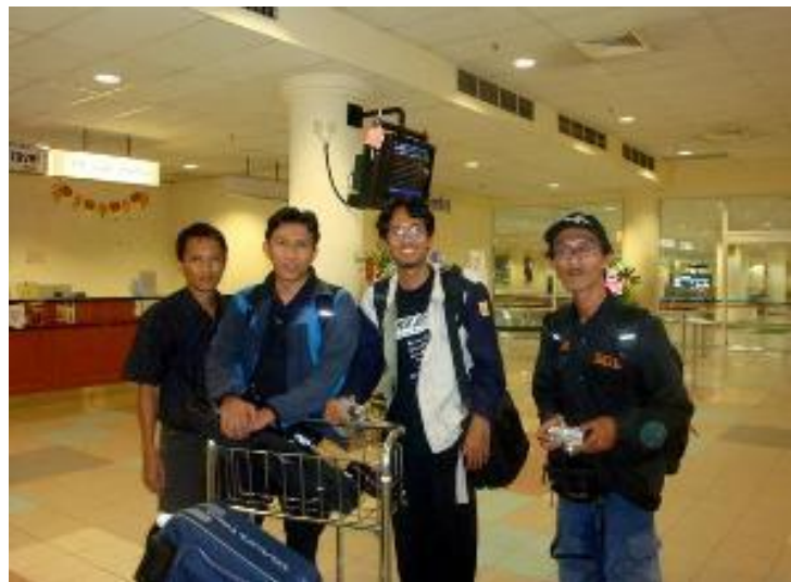
Figure 34. Delegation of Indonesia in International AWC training on 26-28 Februari 2009 in Miri (Sarawak, Malaysia)