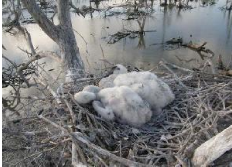
Figure 15. Nest with two chicks.