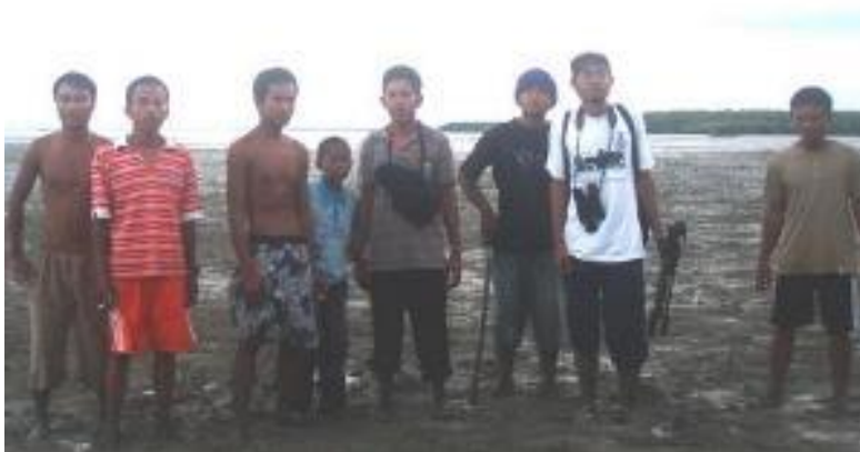
Figure 5. The fieldwork team in Pasir river on March 2008.