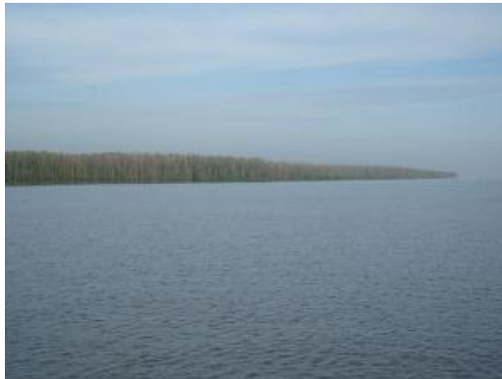
Figure 22. Banyusin peninsular South Sumatra province on 31 October 2008.