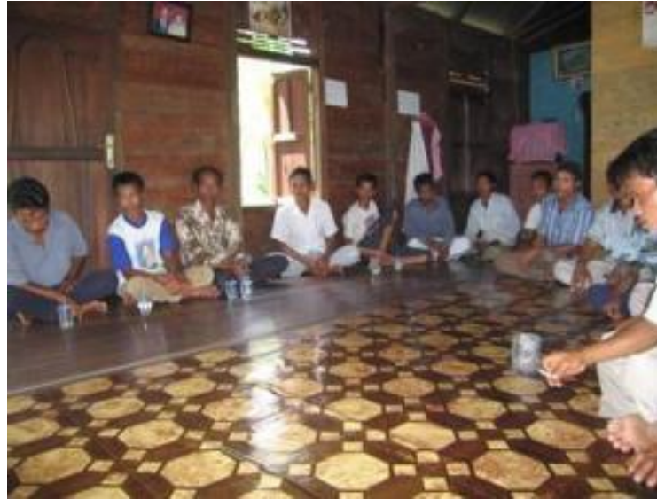
Figure 36. Met the local community, discussed and explored their knowledge about Milky stork.