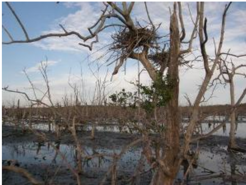
Figure 12. Two nests built 2 m up in a dead tree.