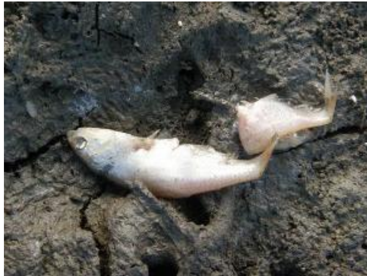
Figure 16. Dussumier's thryssa Thryssa dussumieri was found to be part of the diet of young Milky Stork.