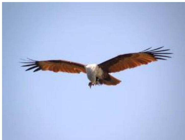
Figure 31. Aerial feeding Brahminy kite in Banyuasin peninsular.