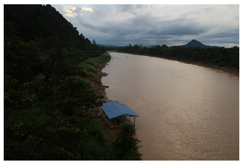
Fig. 2. Limestone hills at Lower Kinabatangan – the study area