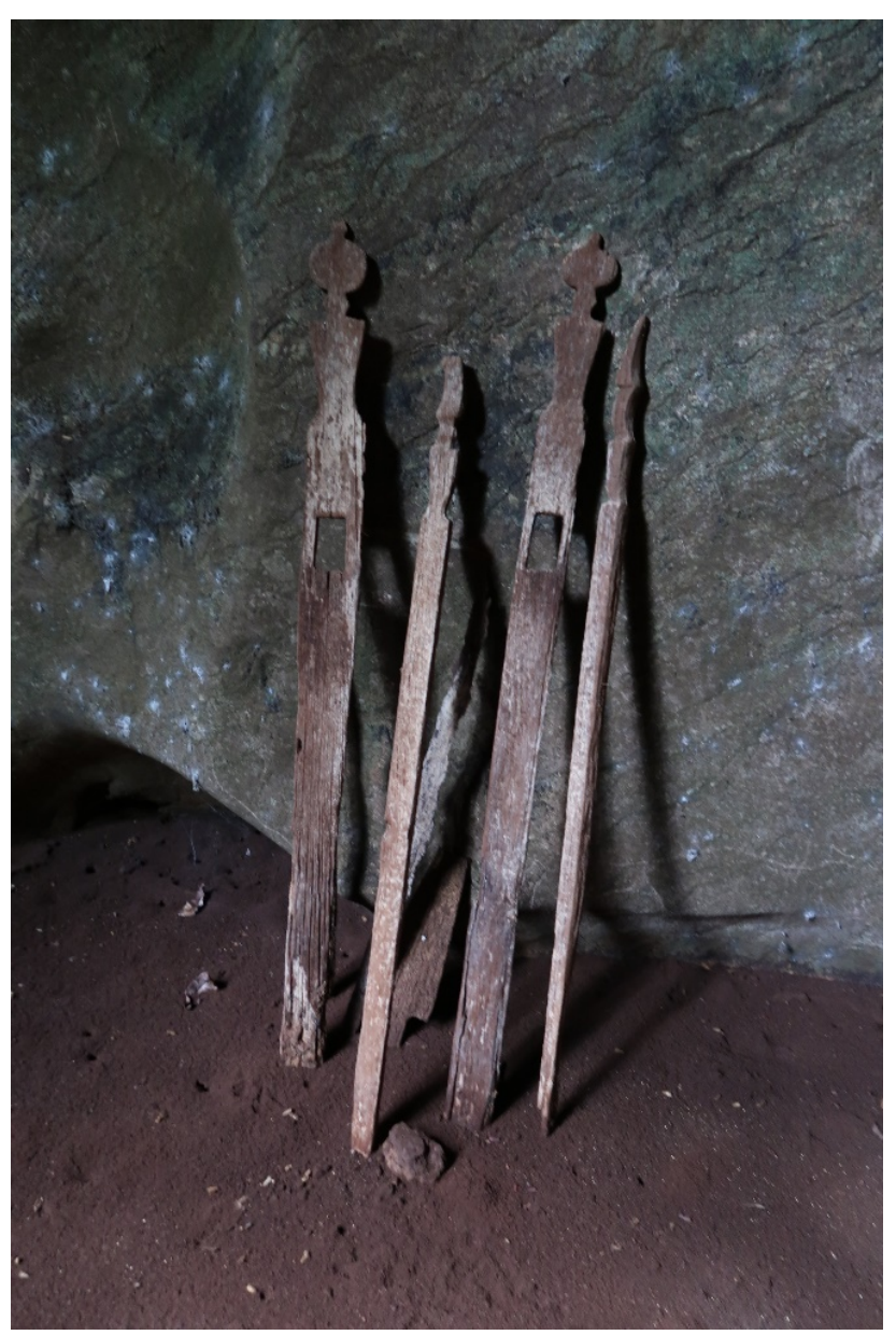
Fig. 1. Remains of coffins found in Supu

We organised a workshop for local community at Batu Puteh village and gave a lecture for students and staff at Danau Girang Field Centre.