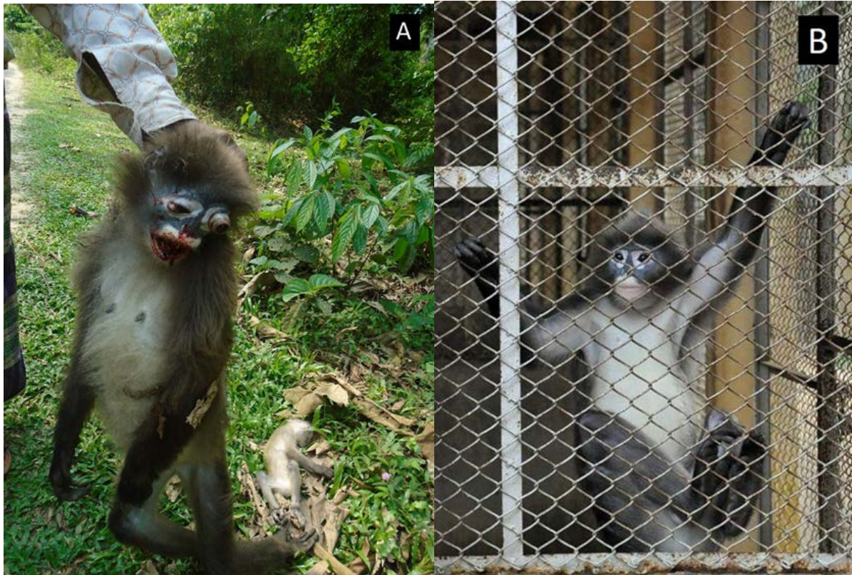
Figure 3: (A) Roadkill of 2 Phayre's Langur in Satchari National Park. © Abu Hanifa Mehedi), (B) The species in a local zoo at North east Bangladesh & © Unregulated Bamboo extraction.

bamboo. Besides, lack of public awareness, poor law implementation, electrocution and trading for zoos were also recorded affecting population in long term survival.