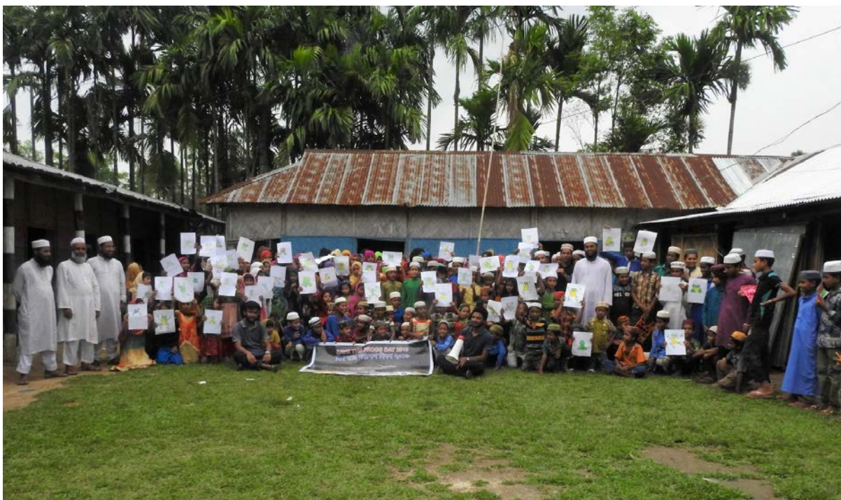
Figure 5: Awareness campaign towards biodiversity conservation with SAVE THE FROGS! Bangladesh.