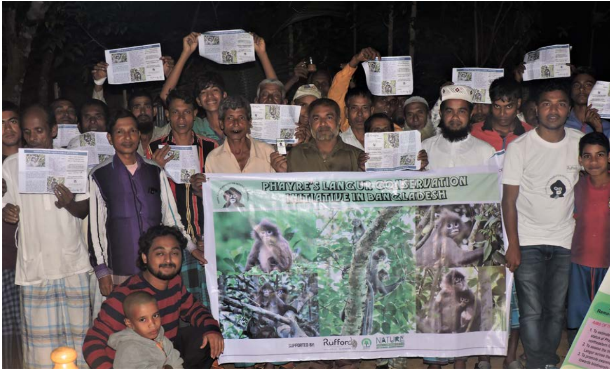
Figure 4: Ending session of Community Consultation Meeting at Rajkandhi Reserve Forest.