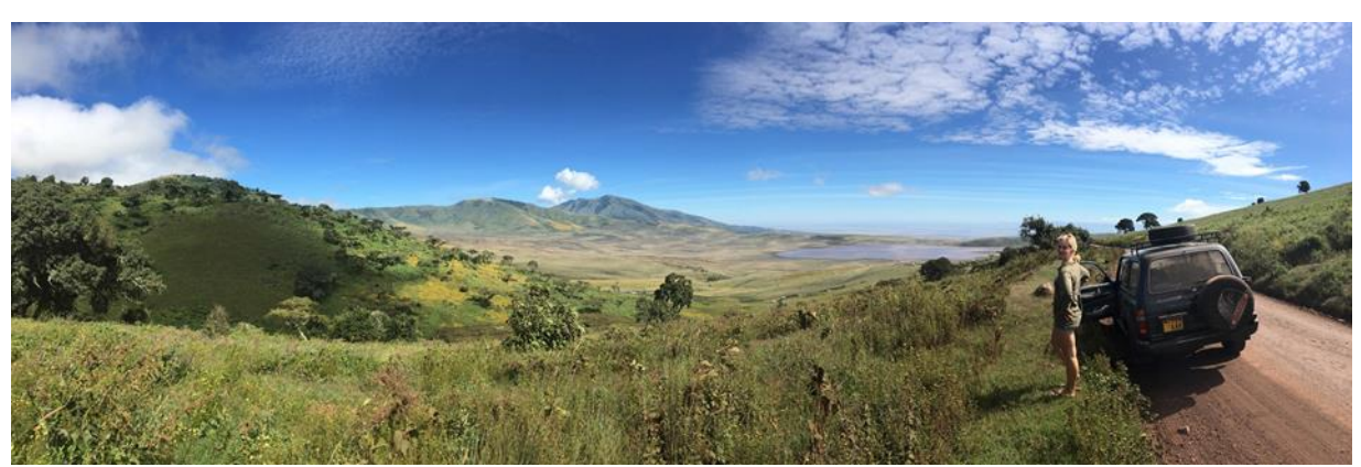
Me and the car on the way to work.