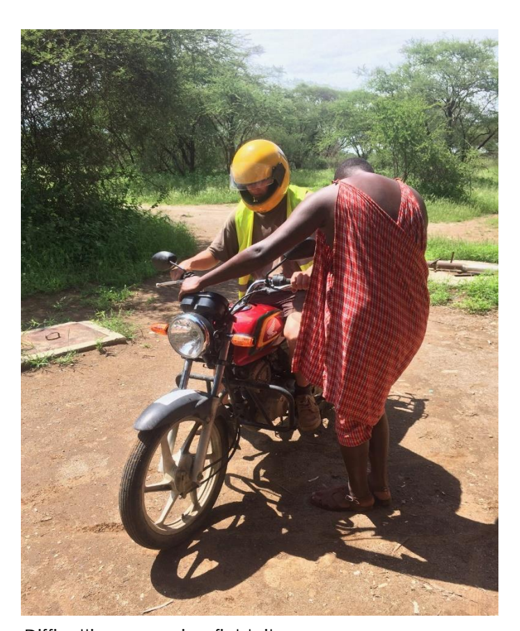
Difficulties accessing field sites

Work is currently underway training research assistants at three field sites in Zimbabwe, in the Hwange/Victoria Falls area. Data collection will be undertaken here until January 2019, when work will move across to Botswana.