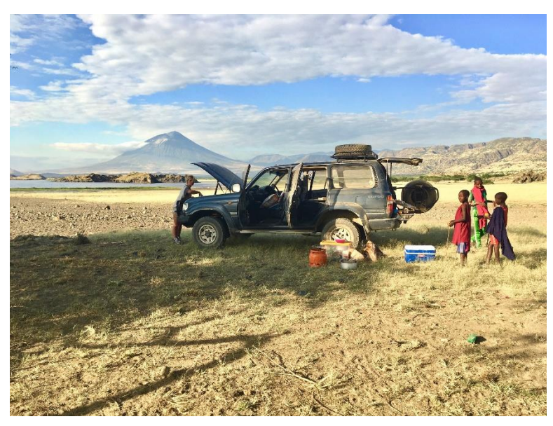
More difficulties accessing field sites

Work is still on track for a move to Tanzania in April 2019, and initial results look likely to have significant practical value. As work moves forwards, I will be revisiting each individual site to explore their results with both the NGOs operating and locally local communities, to ensure this information is translated into practical improvements in livestock management and ultimately a decrease in human-predator conflict.