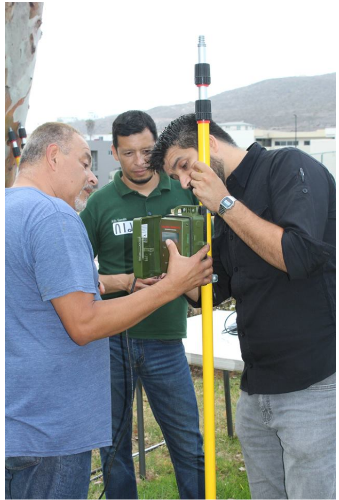
Learning to install acoustic detector SM4™