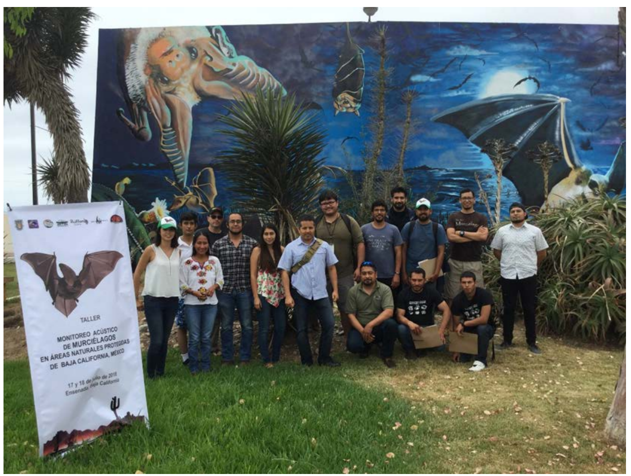
First workshop on acoustic monitoring of bats in natural protected areas of Baja California (ANPs), Mexico.

A total of 18 attendees took part in this workshop, including rangers and technicians of Parque Nacional Sierra de San Pedro Mártir, members of non-governmental organisations Terra Peninsular A.C. and Pro Natura A.C., as well as students of UABC. We discussed the importance of bats in natural protected areas of Baja California and identified threats for this mammals in northwest Mexico. The next step of the project is to install acoustic detectors for monitoring bats in ANPs with the support of rangers and technical staff of protected areas of Baja California.