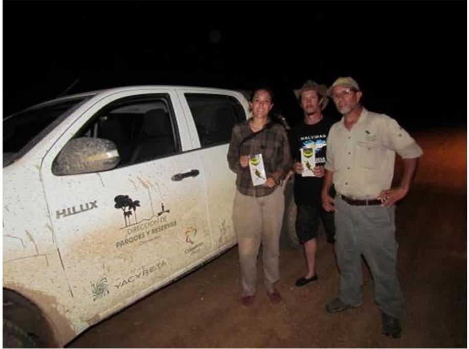
Collaboration in the prospections together with Corrientes' local government and Park rangers.