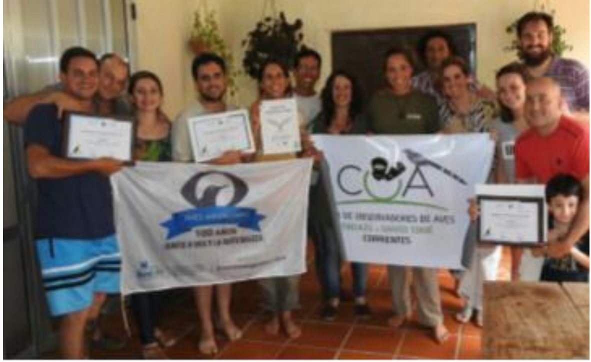
Part of the team with the Birdwatching Club (COA) of Santo Tome town in Corrientes by the end of the season on the 23^{rd} of December 2017.