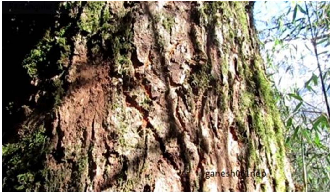
Fig. 5: Distinctive red panda scratch marks on a tree trunk at Nakhola fada.