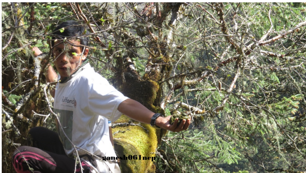
Fig. 4: A member of the field team collecting fresh Red panda droppings from a tree at Nakhola fada. The team member is wearing a Red panda awareness T-shirt produced as part of the Rufford project.