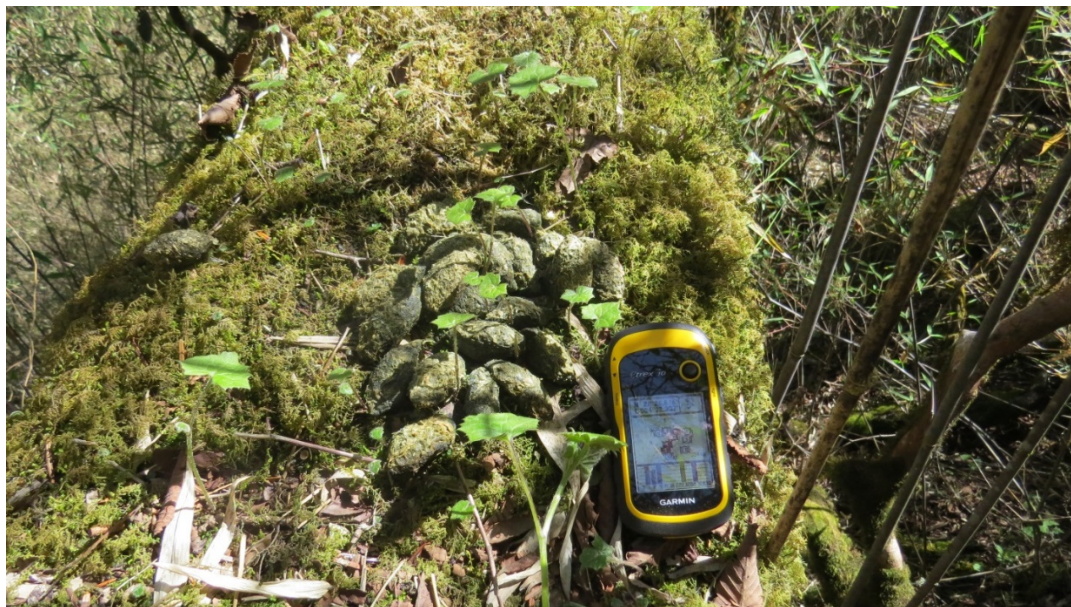
Fig. 6. Forest Guardians were trained in the use of GPS to record the co-ordinates of localities where evidence of Red panda activity, such as fresh droppings (above), had been observed.

First stage training of Forest Guardians involved an explanation of GPS and instruction in how to use hand-held GPS units and how to record location points.