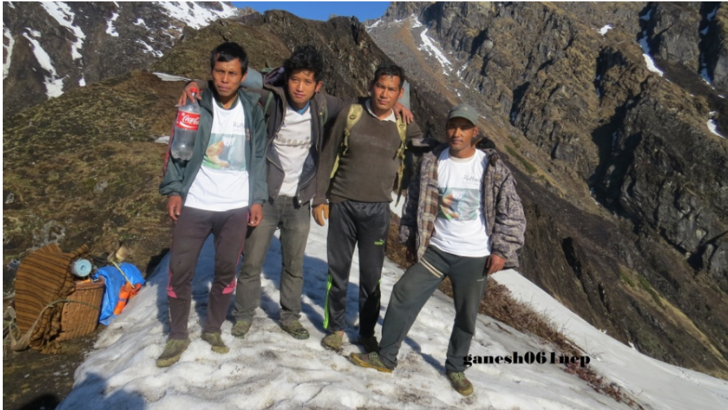
Fig. 1: Members of the field survey team at the top of Moga danda after a series of line transects.

As the first two field surveys produced no evidence of red panda activity, I enlisted local people to help guide the survey team to areas where villagers had reported seeing red pandas. This approach was more successful and resulted in the team's first sighting of a red panda in the forest at Nakhola fada (Bhulbhule VDC) at 3537 m.