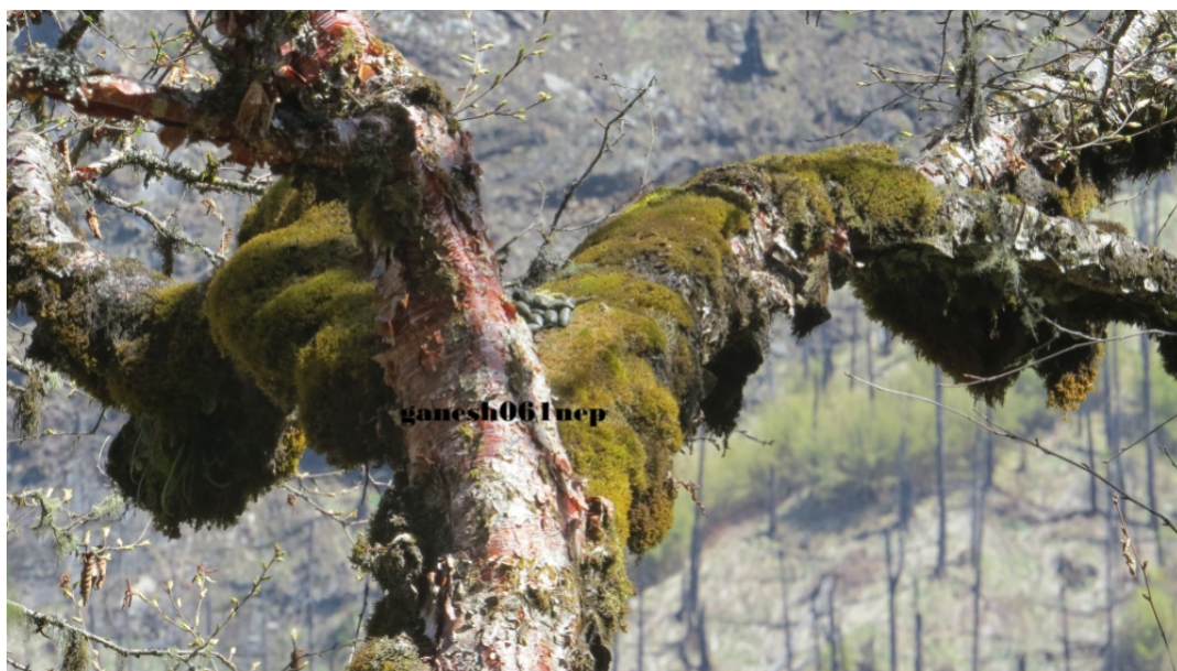
Fig. 3: Droppings of red panda in the fork of a tree at Kargu fada, Bhulbhule VDC, Lamjung District.