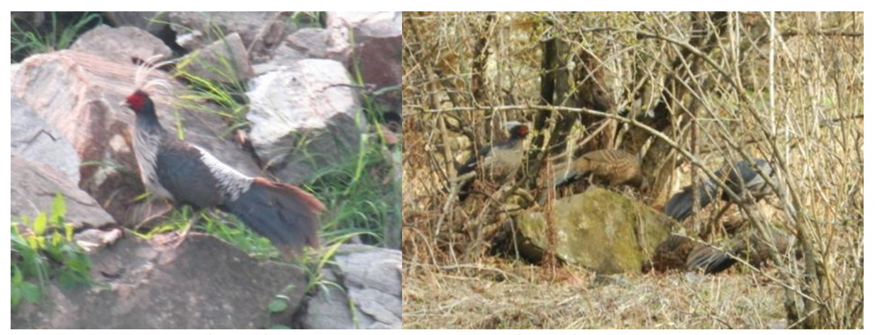
Left: Kalij Pheasant (Male). Right: Cheer Pheasant (Male).