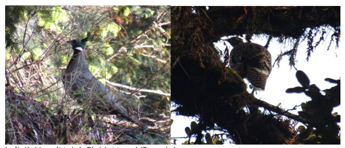
Left: Koklass (Male). Right: Monal (Female).