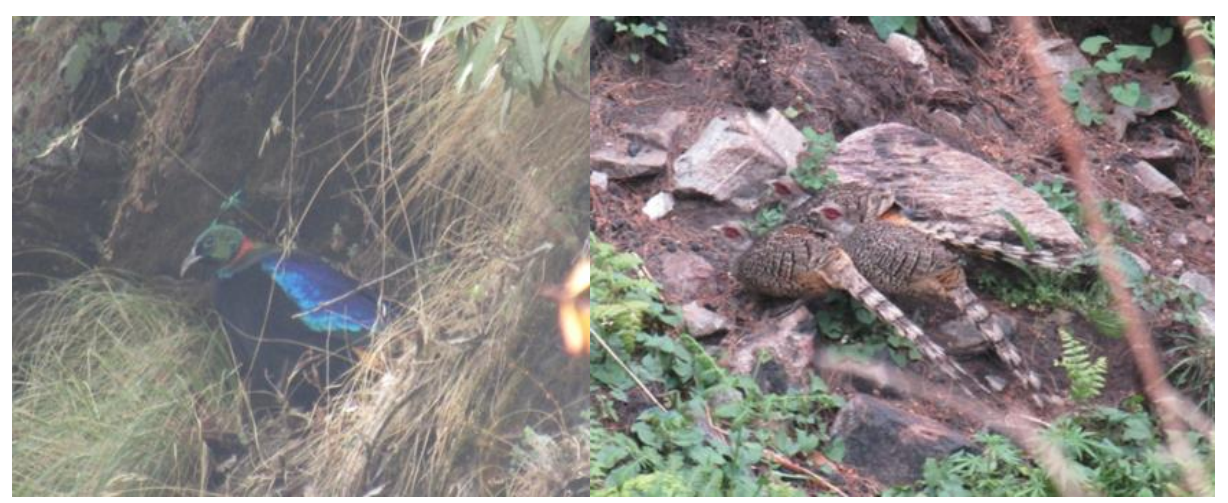
Left: Monal (Male). Right: Flock of Kalij Pheasant (3 Males + 4 Females).