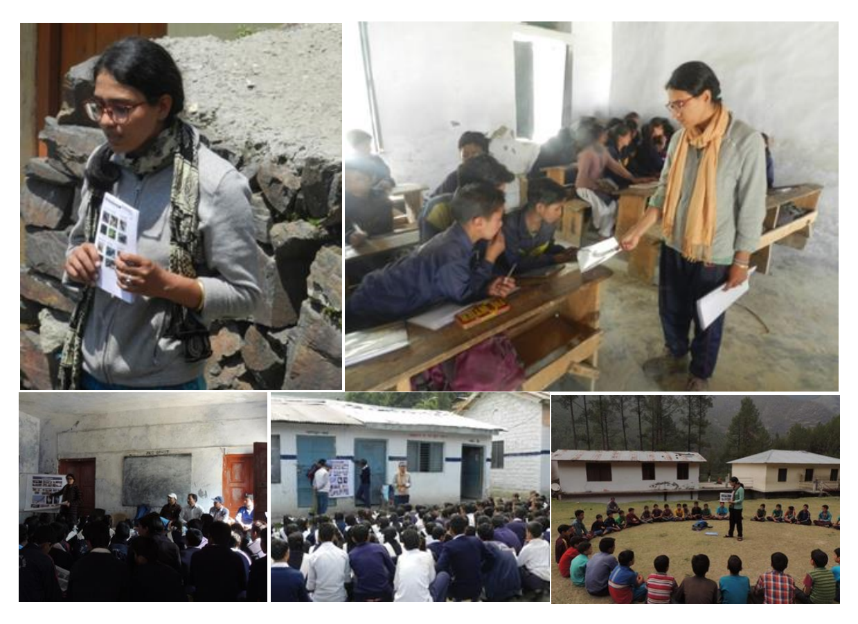
Workshop in Schools with the aid of Charts