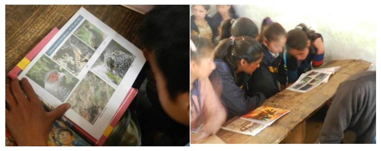
Species identification exercise for school students using coloured picture templates