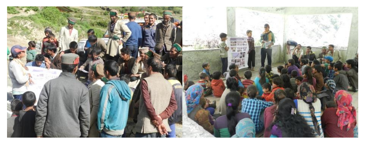
Workshop in Villages