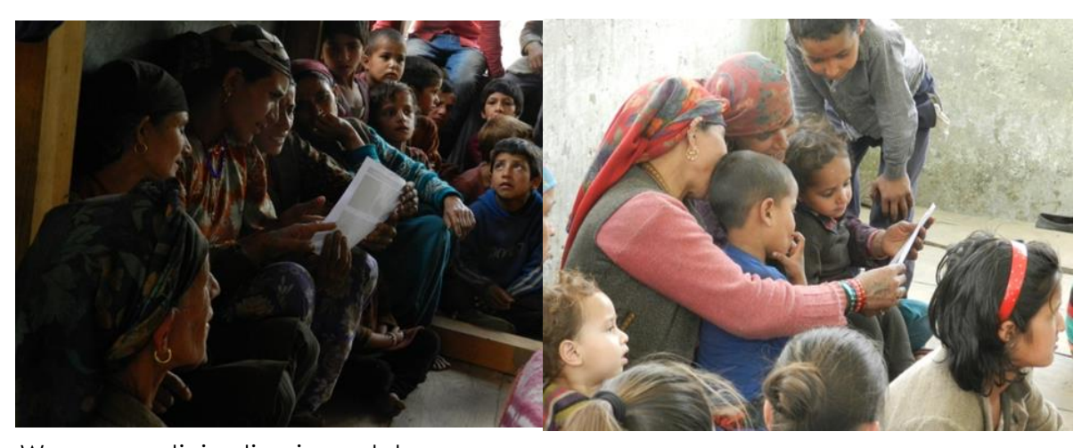
Women participation in workshop