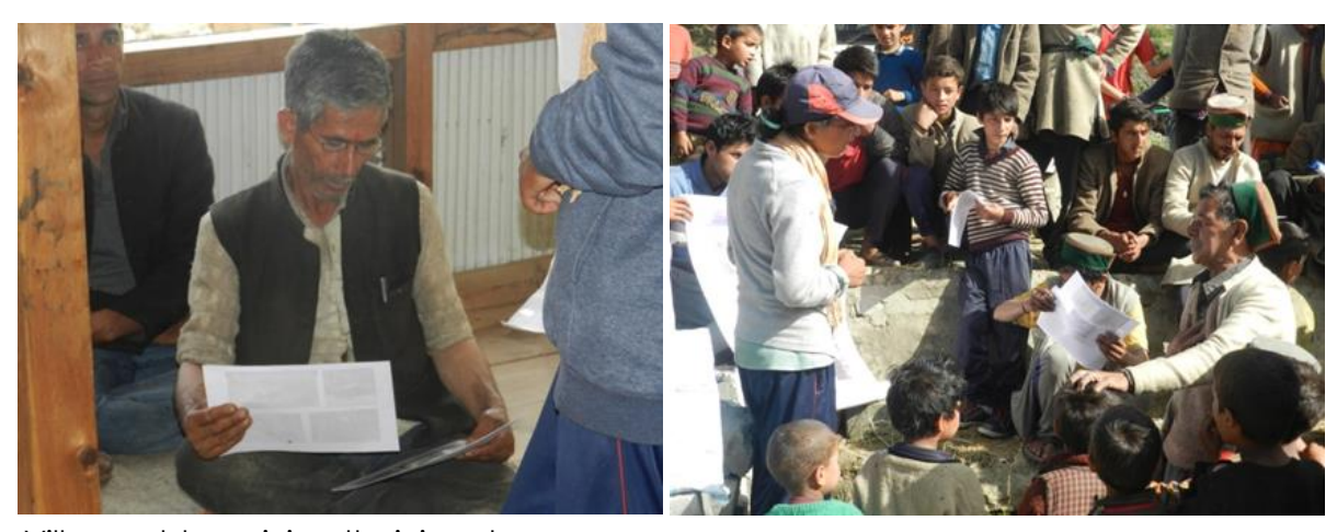
Village elders giving their inputs