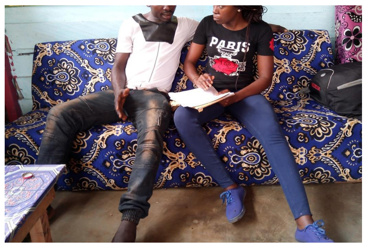
Training of a field assistant on how to record data on hunting form