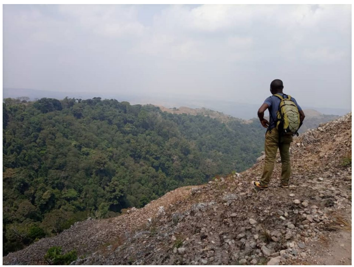
One of the views of the forest patch in the Bugamba village land forest reserve.