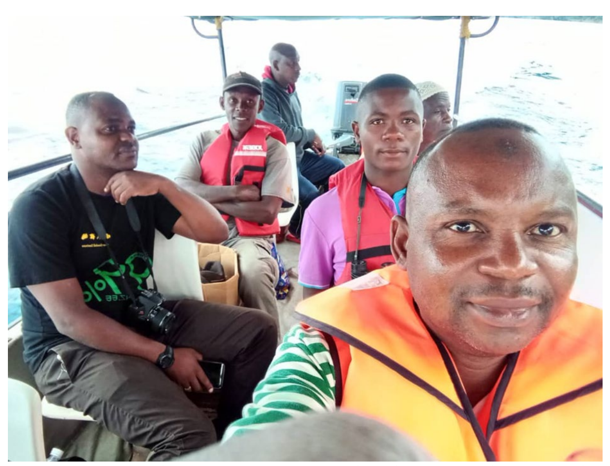
Research team travelling along the Lake Tanganyika using a boat going to camp in one of the lakeshore villages within the Greater Gombe Ecosystem.

I am currently working on the data entry and prepare tables for analysis.