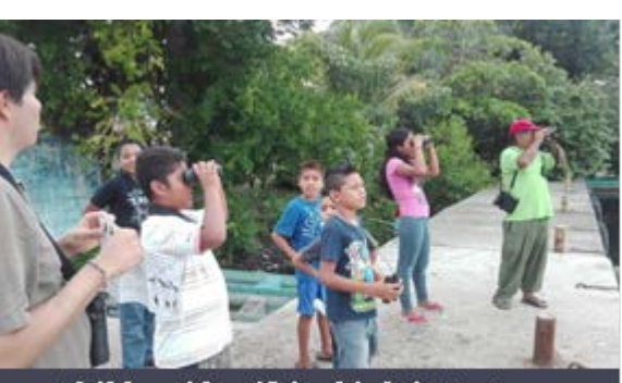
Children identifying birds in La Joya-Buena vista Lagoon.

We noticed that people in local communities had a close relationship with birds, they can distinguish, name them; use it to ornate, as food or in many songs and legends.