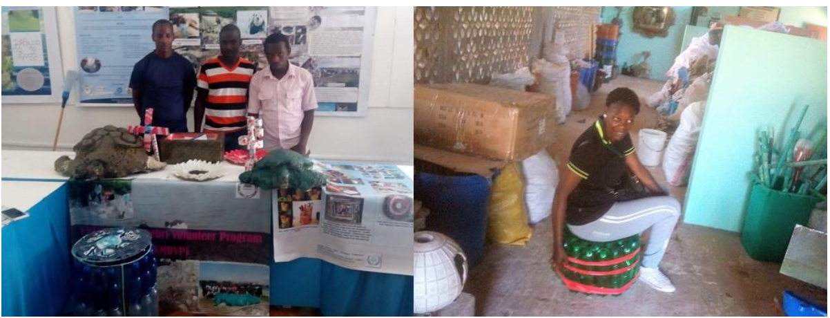
Left: KMFRI Marine Debris Volunteer Program (KMDVP) Showcasing products made from recycling of Marine Litter at the ASK Show, Mombasa, Kenya. Right: Testing a stool made from marine litter (plastic bottles) at EcoWorld Watamu.