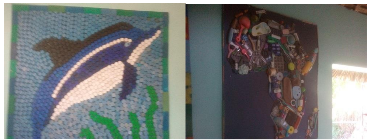
Left: Dolphin made from marine litter (bottle tops) at EcoWorld Watamu. Right: Map of Africa made from marine litter (bottle tops) at EcoWorld Watamu.