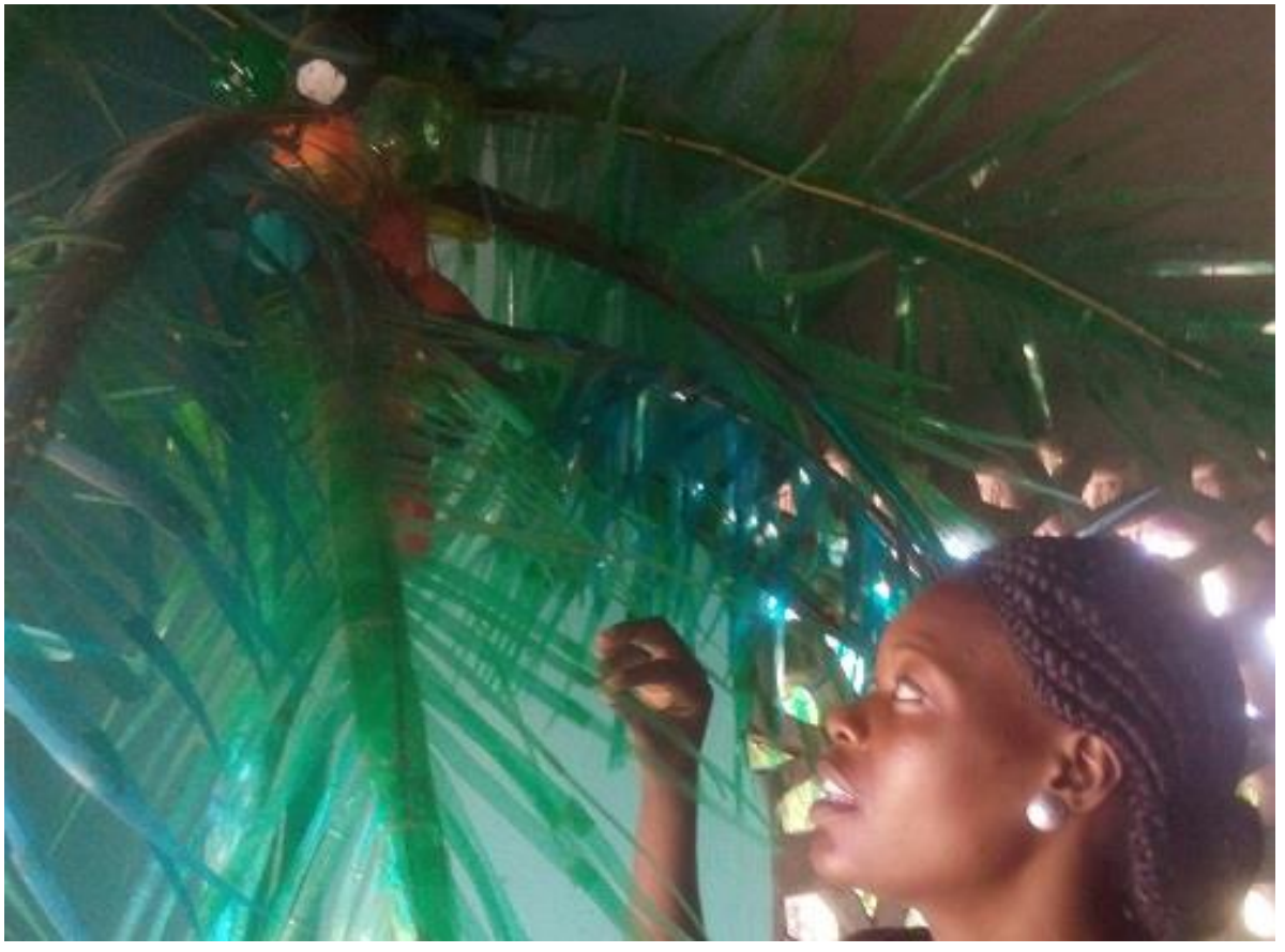
Viewing a Coconut tree made from Marine litter at EcoWorld Watamu.