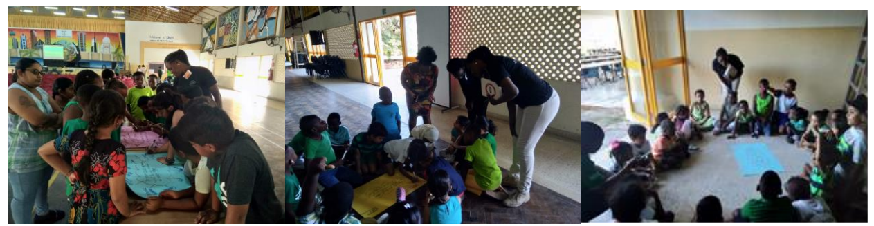
Student group discussions on Sources, Impacts and Management of Marine Litter