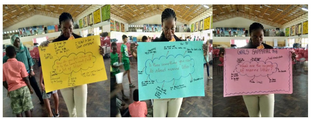
Displaying the charts developed by the students during the group discussions