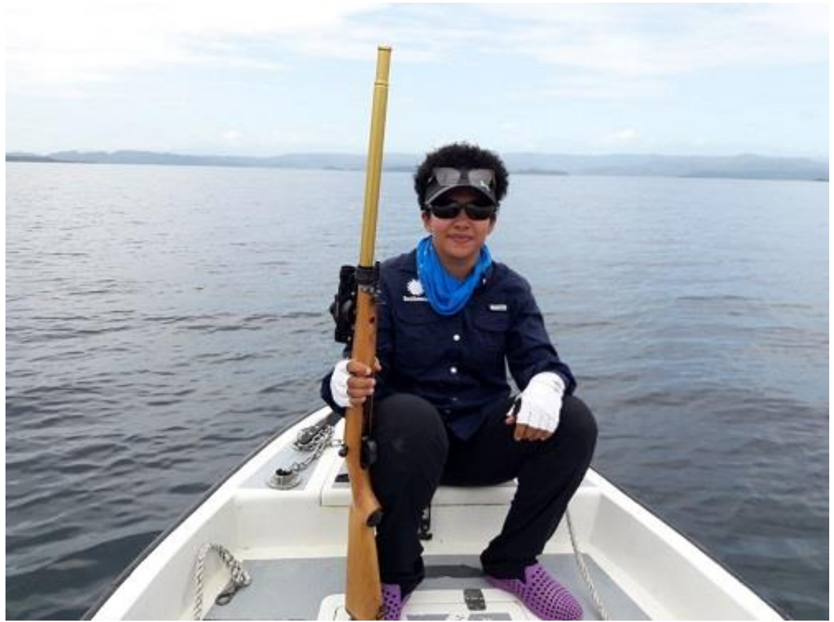
The PAXARMS system.

As I mentioned in previous reports, the support that generously the Rufford Small Grants has provided us allowed the generation of relevant data for conservation bottlenose dolphins in the Bocas del Toro Archipelago in Panama. Therefore, we are really grateful for all support and confidence that the RSG board committee has given us to achieve the most important outcomes in our project. We really appreciate your support in conservation projects in developing countries, since you are contributing to conservation of many species and ecosystems in our continent, and also you are empowering young Latin American researchers to follow their careers and promote conservation issues in developing countries. Thank you for all.