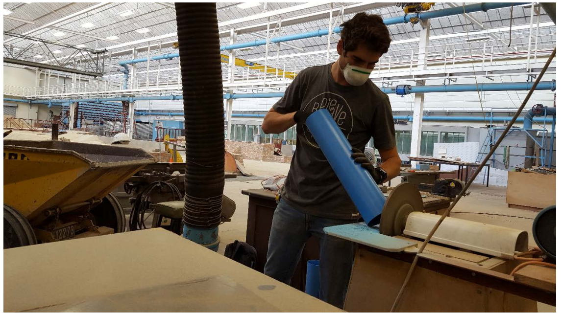
Each silo was carefully altered to allow an adhesive surface, used to connect the PVC pipe with its corresponding PVC sheet, the foundation of individual silos.

2017/08/22 - 2017/09/02 Reworking of the cut PVC silos to combine drainage and foundation.