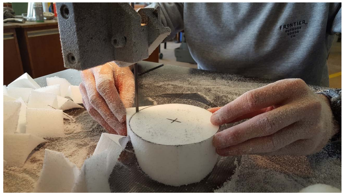
In total 120 mould were cut from Iso-board which supported the drainage pipes with the silos.

2017/09/07 – 2017/09/21 Cutting the shapes that will protect the plants within the plant combination experiment.