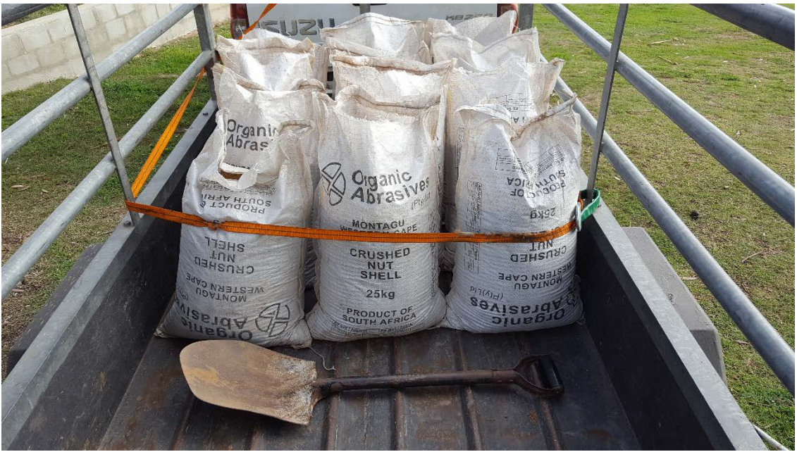
The soil from the area where Renosterveld naturally grows is collected and transported back to Stellenbosch University.

The amount of soil medium needed for the experiment has been calculated as 1 cubic meter.