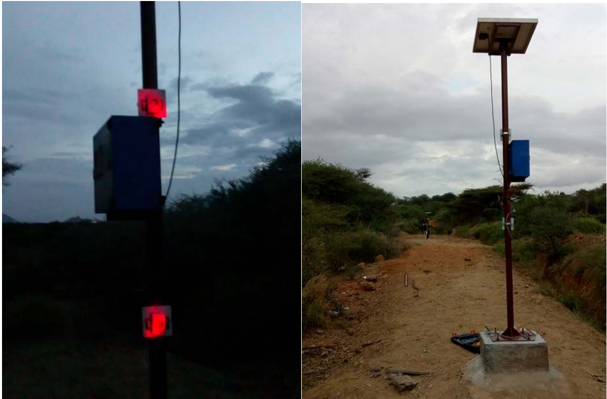
Left: Receiver at night. Right: Transmitter and receiver.