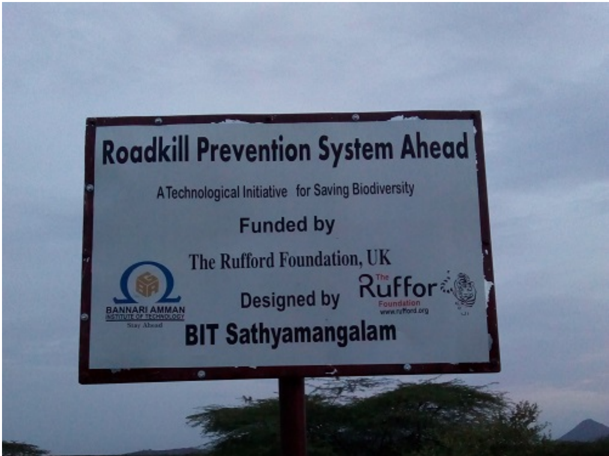
RPS Notice Board