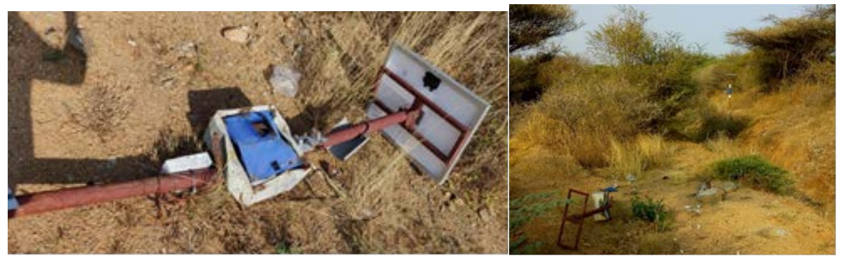
Fig. 3: Pole totally damaged by elephant. Fig. 4: Restored pole at farther distance after trench which is presently inaccessible by the elephants.