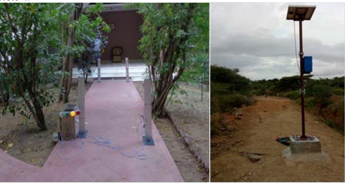
Fig. 1: Demonstrated Prototype of Roadkill Prevention System at Rufford India Conference, 23rd to 26th April 2017, Ranthambore National Park in Rajasthan which has been developed under first round of Rufford funding. Fig. 2: Field implemented Roadkill Prevention System unit at Valamundi Reserve Forest area of Sathyamangalam Tiger Reserve, Tamil Nadu, India.