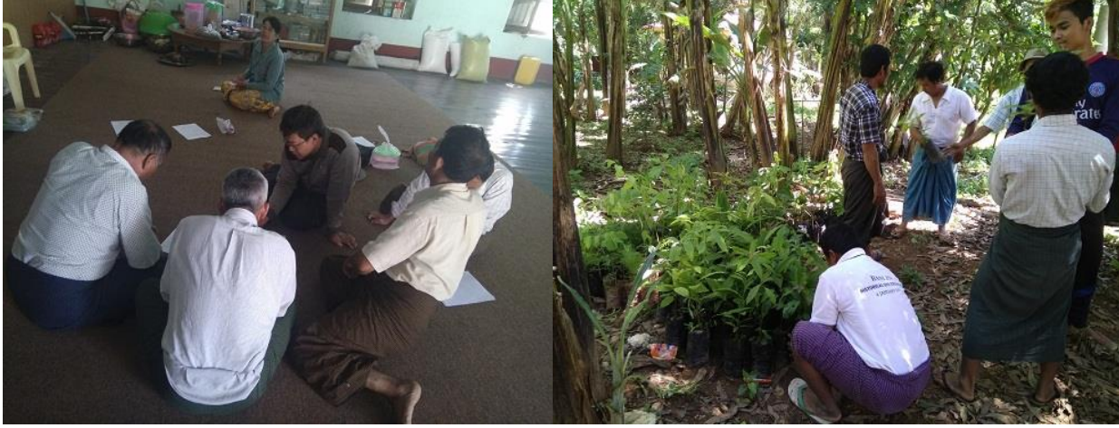
Left: Survey to rural community. Right: Propagation training to villagers.