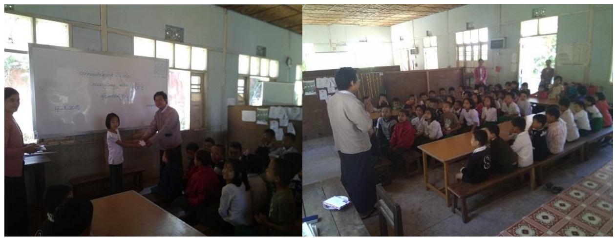
Left: Essay competition award to the students. Right: RCI education class with primary students.