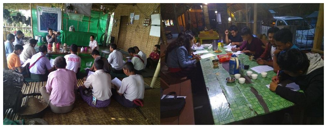
Left: Riparian class. Right: Brainstorming activates with local youth.