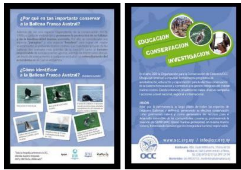
Printing: 6000 (six thousands).