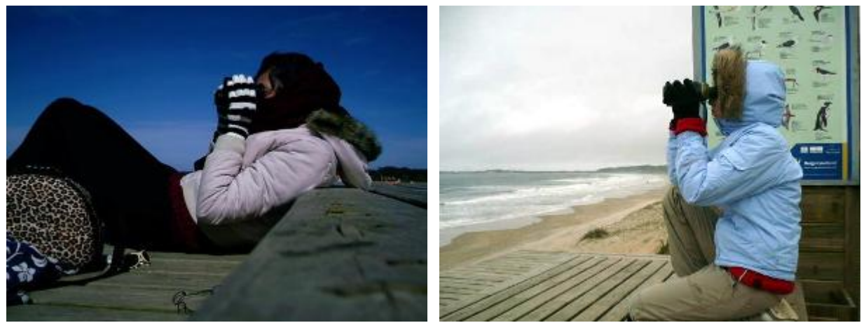
Two international volunteers from Brazil and Argentina, working two months from landbased platforms.

2: Working together a Brazilian team sighting, reinforcing regional metodologies.