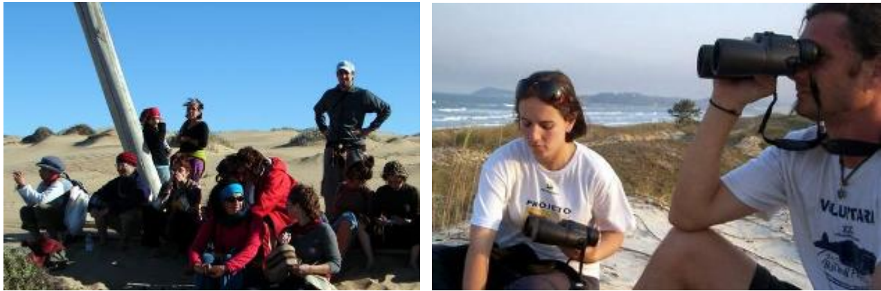
1: In the Barra de Valizas sight point, called "Punta del Diablo de Valizas" with workshop participants.

2: Working together a Brazilian team sighting, reinforcing regional metodologies.