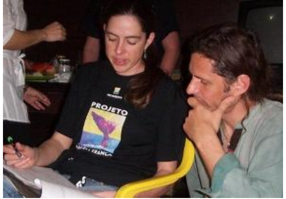
Working together Brazilian Team.