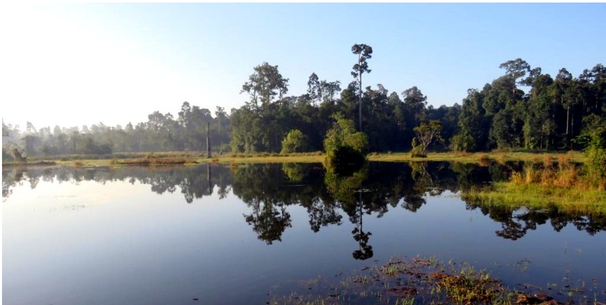
Habitat of White Winged Wood Duck

White-winged Duck Asarcornis scutulata is endangered, owing to destruction of riverine habitats including loss of forests across its range. Increasing human population and its growing demands for land and biological resources have further affected the Dehing-Patkai landscape to a great extent. Fragmentation of habitat has primarily occurred as a result of infrastructure development, widening of road, Oil Drilling, illegal logging and NTFPs collection from the Sanctuary. The small and fragmented populations are vulnerable to extinction from stochastic events, loss of genetic variability, hunting and collection of eggs and chicks. All these factors are led to decrease the white winged wood duck population. There has not been any comprehensive survey of recent status in Assam. The Dehing-Patkai Wildlife Sanctuary is one of the last strongholds of the species with an unknown population.