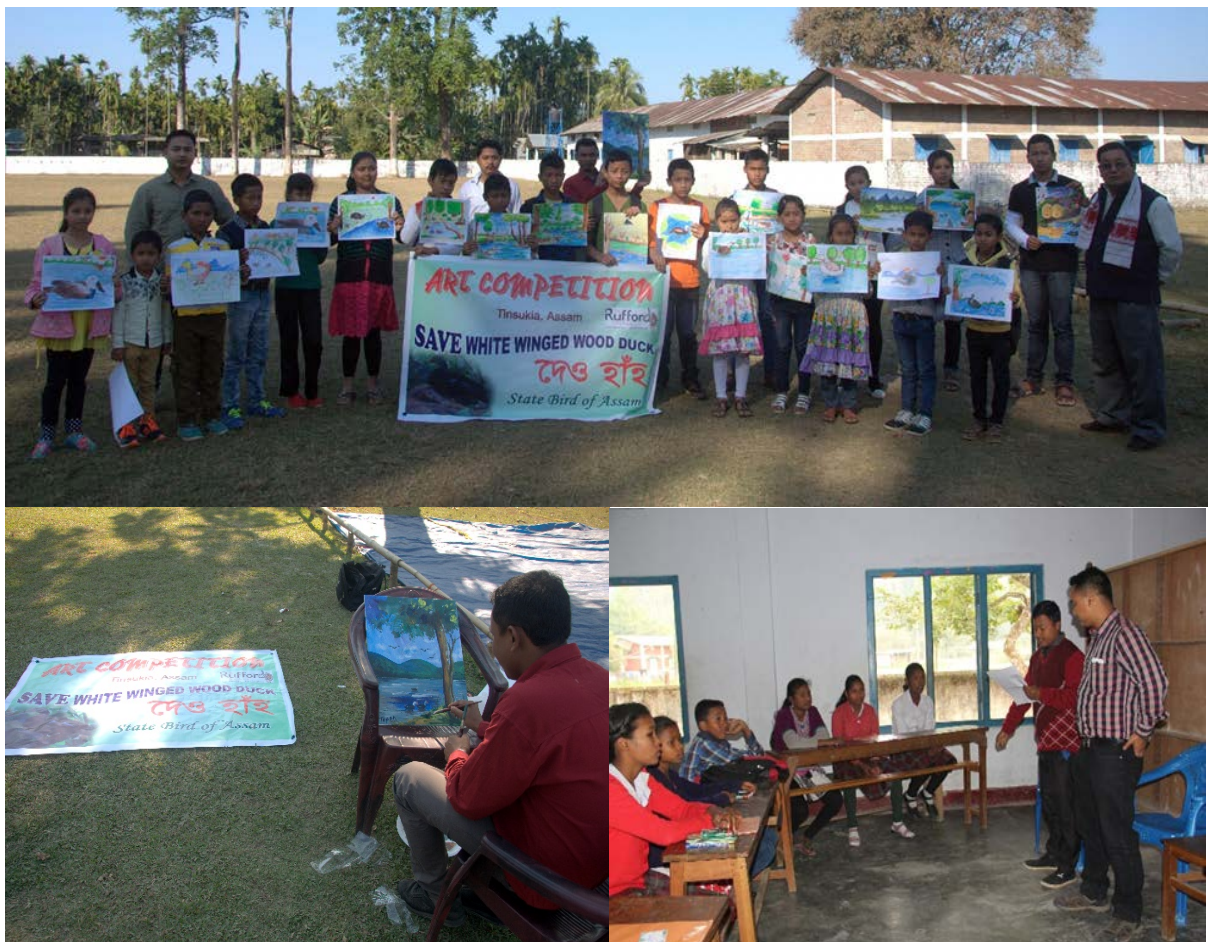
Art and Quiz Competition among the School Students