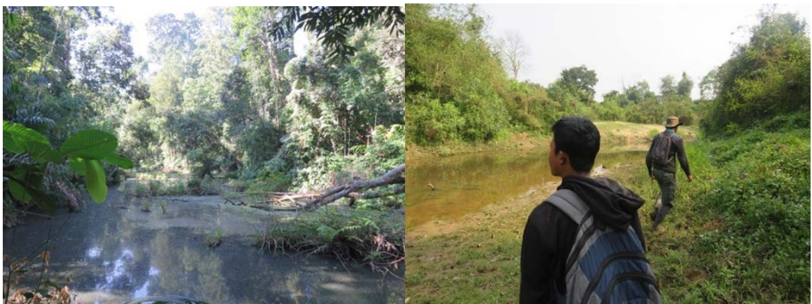
Left: Habitat of White Winged Wood Duck. Right: During Steam Survey.

Habitats assessments: We are studying the habitats by measuring different parameters including the water pH level and other associated environmental variables. The data will be analyzed during the last period of the study.