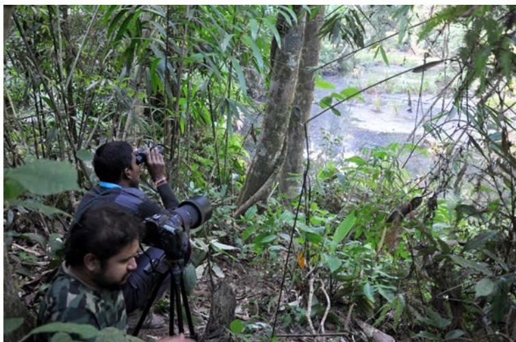
During the Survey

Initially, the study area has been gridded in 1 x 1 km 2 . During Nov 2017 to May 2018 we have identified 15 different spots where we have sighted 25 White winged wood ducks in 20 different occasions. 4 km transects are laid down through a small stream where 6 individuals were recorded