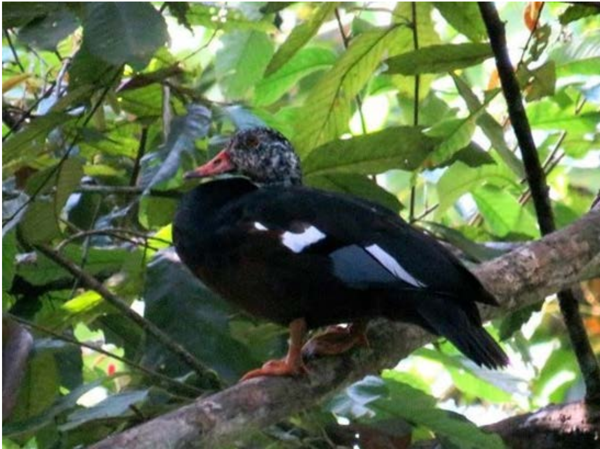
White-Winged Wood Duck

during the survey. These places are visited once a week in order to check their feeding and other habits.