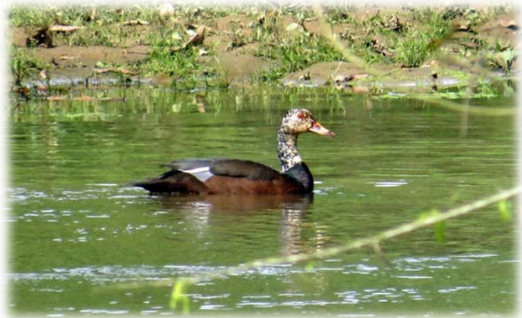
White-Winged Wood Duck

Team Members Rubul Tanti Bijoy Panica Sonu Bhumis Deep Sonowal