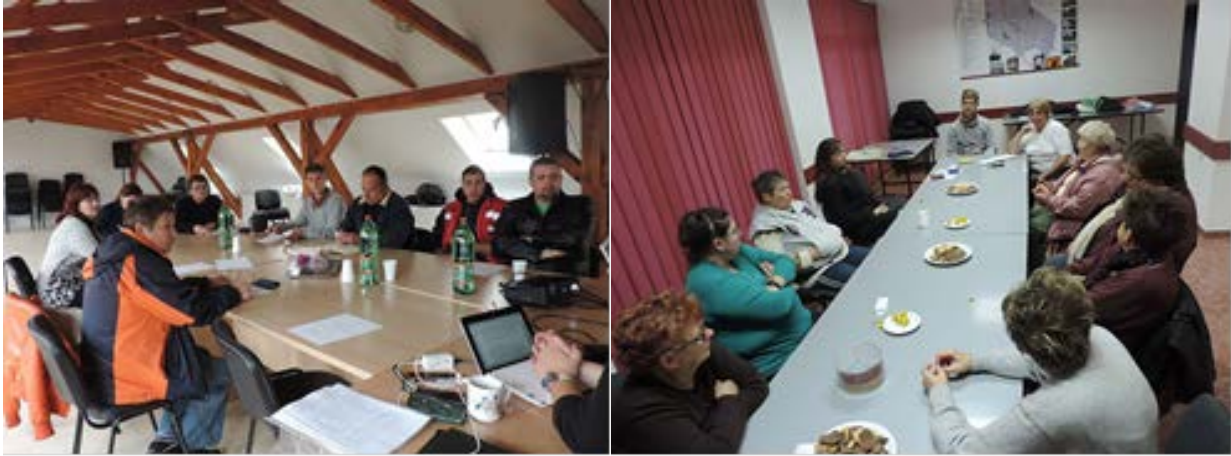
Left: Education for village's authorities in local culture home. Right: Education of woman who collecting medicinal and aromatic plants

After presentation, we conducted evaluation process. In general, all participants were very satisfied with education and they highlighted that these kinds of lectures should be often. Also, they estimate educators with high mark.