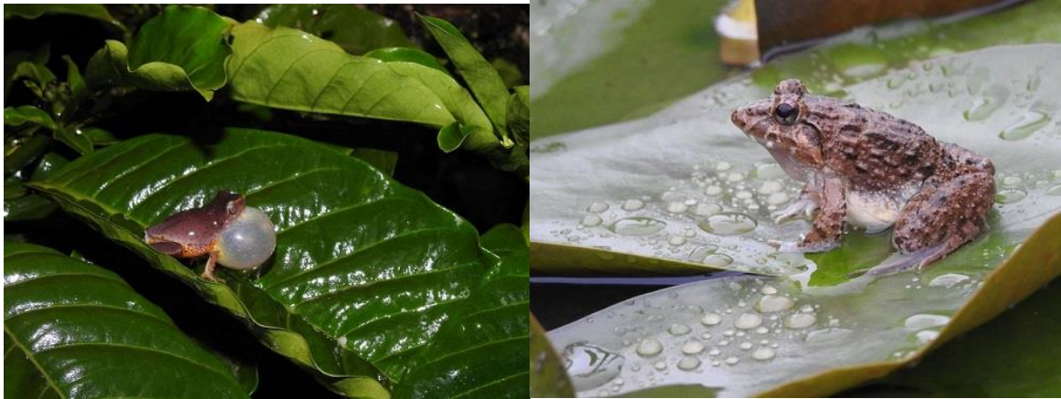
Left: Raorchestes glandulosus , Honey Valley. Right: Fejervarya mudduraja , Honey Valley.