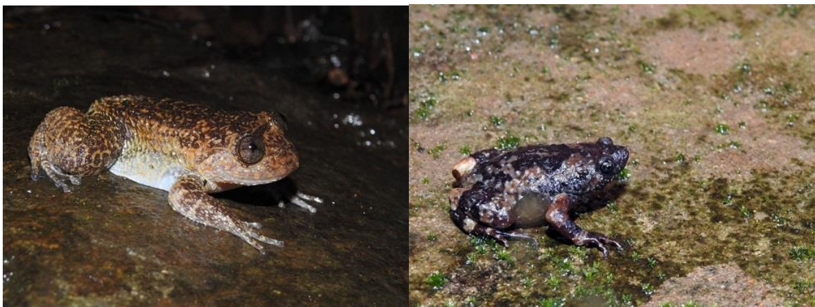
Left: Nyctibatrachus grandis , Honey Valley. Right: Uperodon marmoratus , Kaalur.