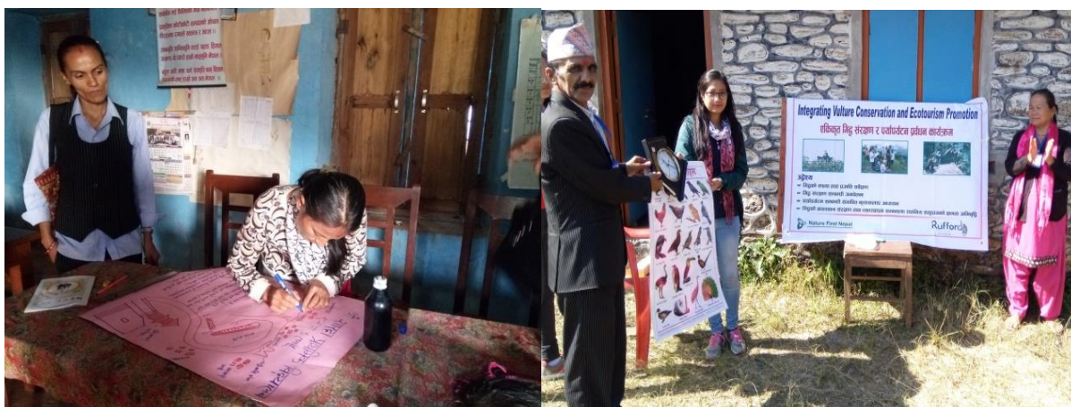
School awareness program activities at Rastal and Gurdum