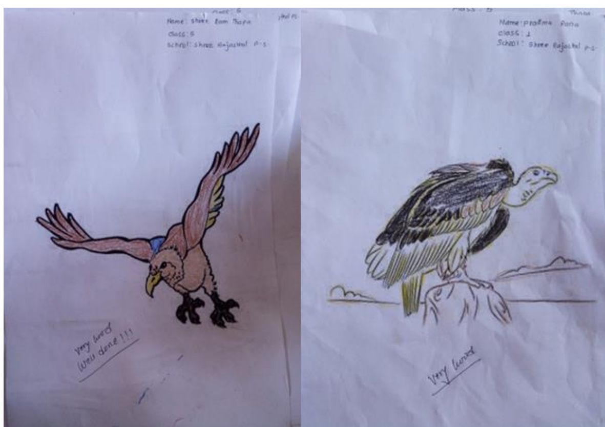
Sketch colored by students