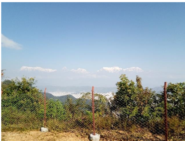
Mountain view from Kot Durbar