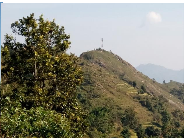
Bajasthala (vulture sighted area)