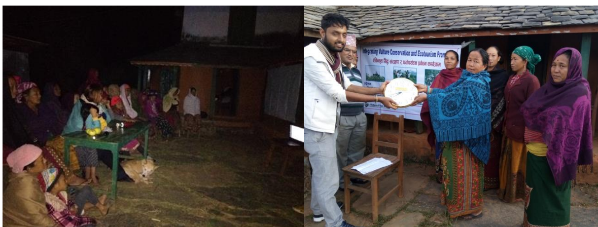
Community program activities (Women Group) at Rastal