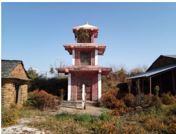
Temple at Kot Durbar

Important religious and natural sites along Millennium Trekking Route