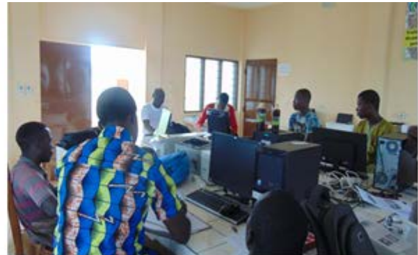
Sensitisation of stakeholders (researchers, extension agents, ONG agents & students) on the conservation of melliferous plants for the sustainable production of therapeutic honey.