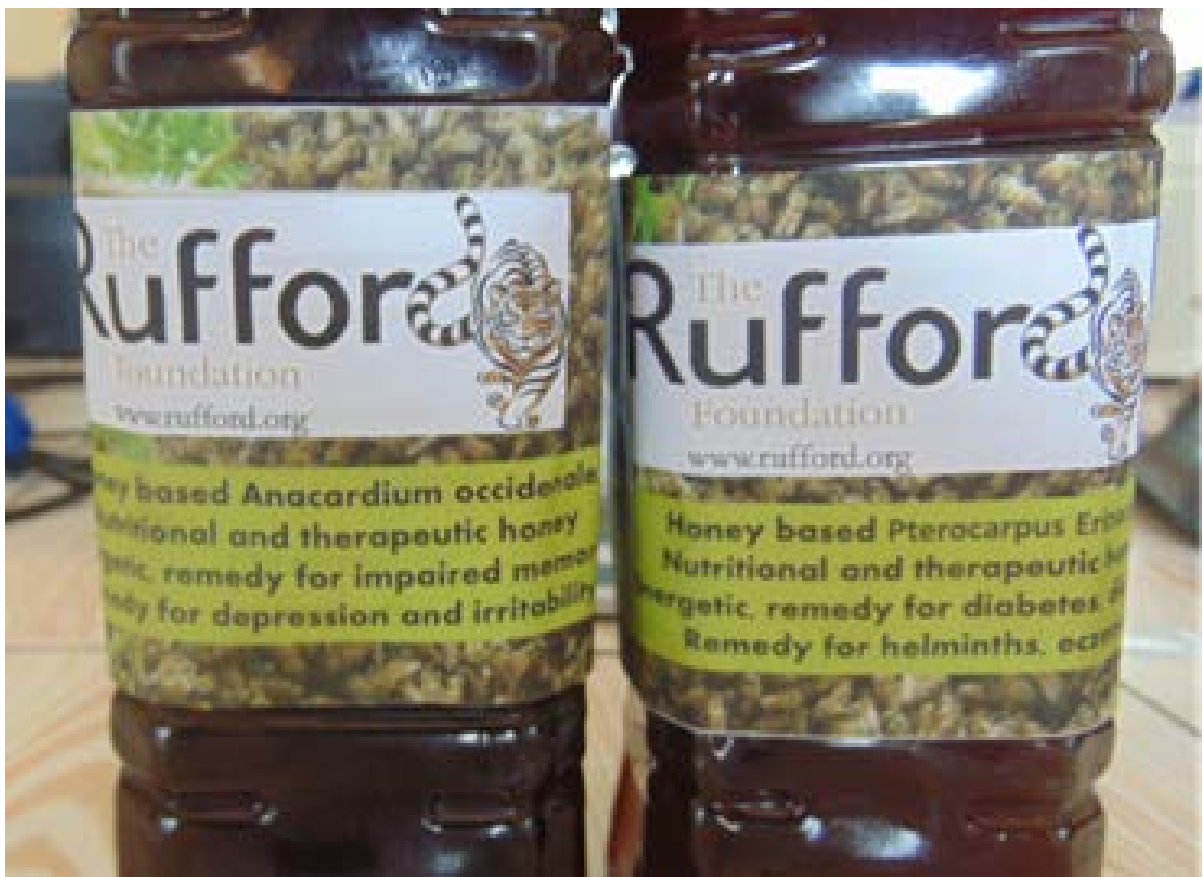
The Pterocarpus erinaeus and Anacardium occidentale based therapeutic honey produced by honey farmers trained in the Rufford project.