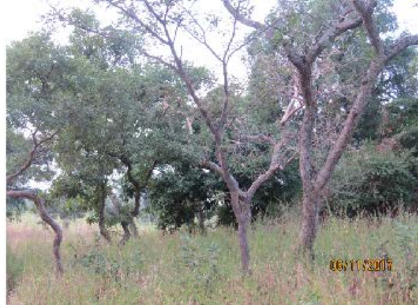
Habitat of study area.