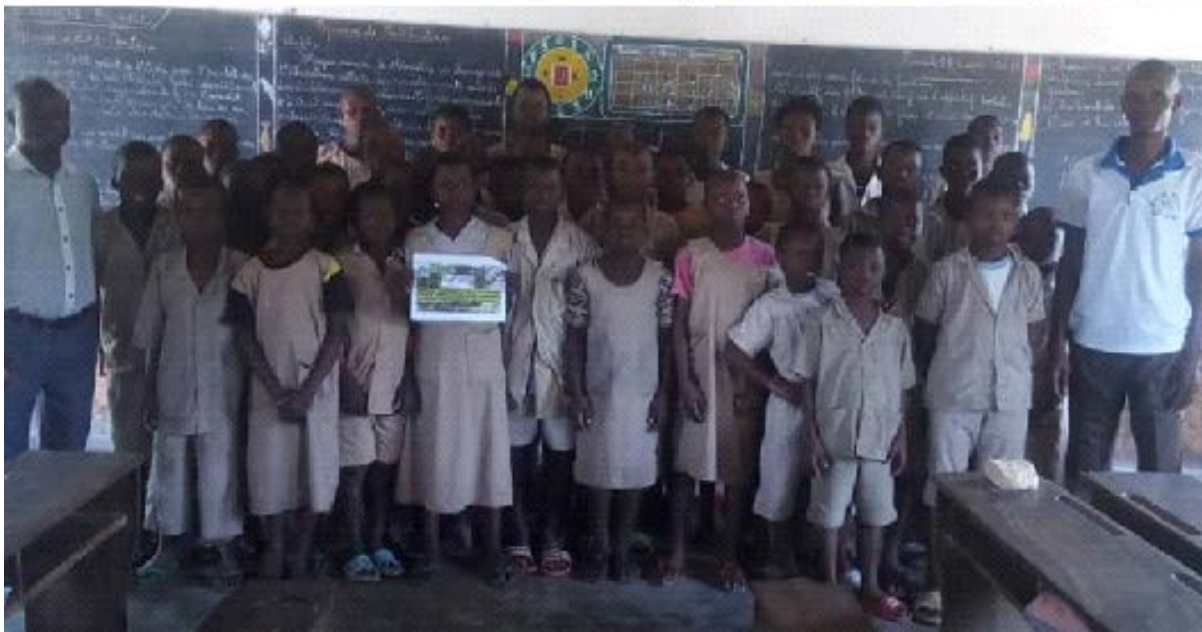
Sensitisation of primary school students about medicinal and food utilities of the therapeutic honey.