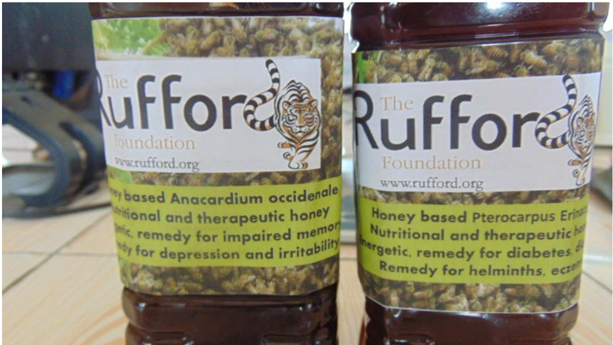
The stakeholders (researchers, extension agents, ONG agents & students) were enjoying the taste of therapeutic honey.