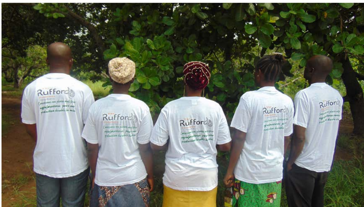
Sensitisation of honey farmers on the conservation of melliferous plants for the sustainable production of therapeutic honey: case of Pterocarpus erinaeus and Anacardium occidentale in Benin.