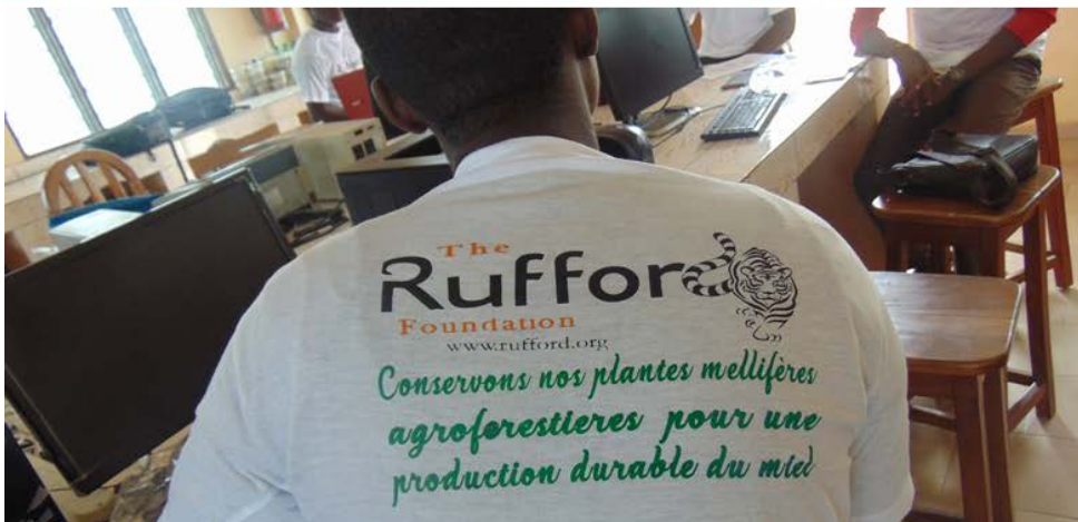
Stakeholders (researchers, extension agents, ONG agents & students) accepted to share with local populations the information on the conservation of melliferous plants.