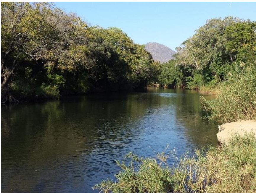
2. The Blyde River, where we did a 7-day survey, hoping to find new hooded vulture nests.