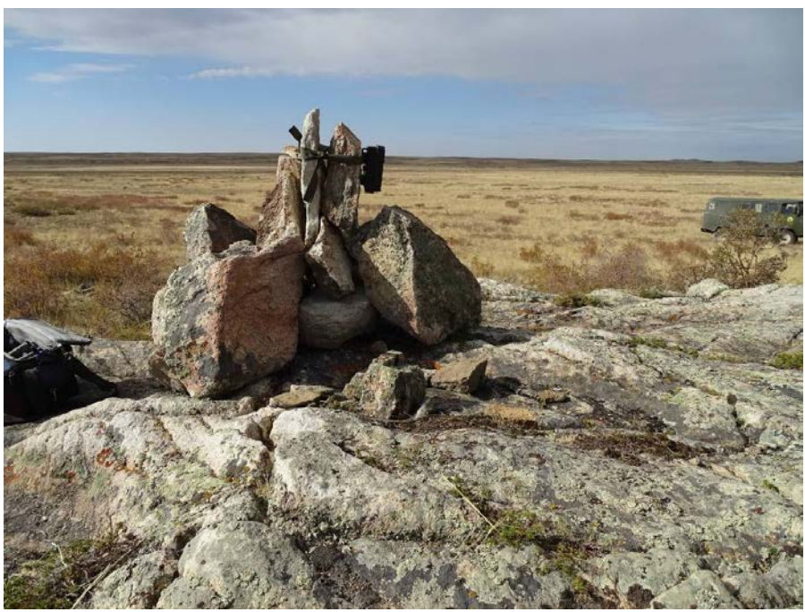
Camera trap set in Karaganda province, September 2017

All data obtained will be used for the updating of the conservation status of the species – in the report which is planned to be published in the special issue of the Cat News in the end of 2018.