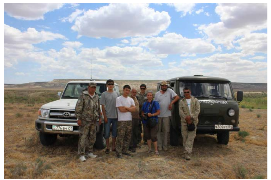
With the ACBK researchers on the Northern Ustyurt Plateau, June 2017