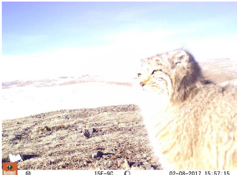
Pallas's cat in the Sailughem ridge, Altai Republic, Russia (Sailughem National Park)