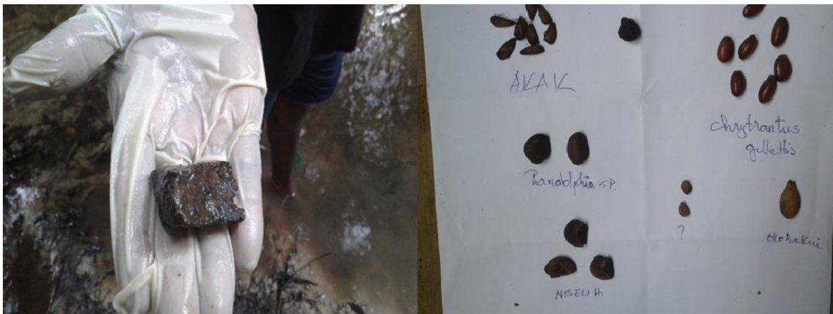
Left: Big stone found in fecal sample, swallow by gorilla. Right: Some seed found in gorilla fecal sample during watching process.