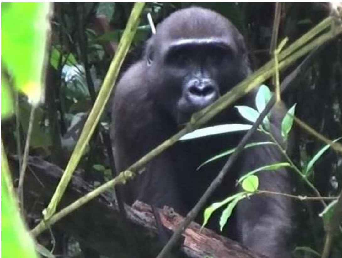
One of several females within the group we're currently habituating.