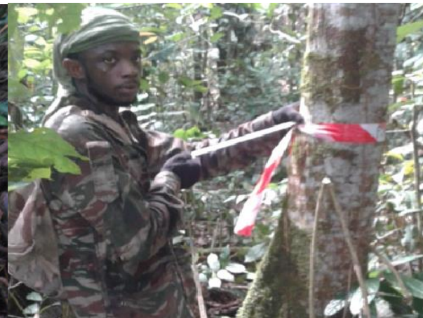
Left: Bark of Eyong ( Erikloma oblongum ) peeled and feed by gorilla group member. Right: Local botanist during measurement of DBH.