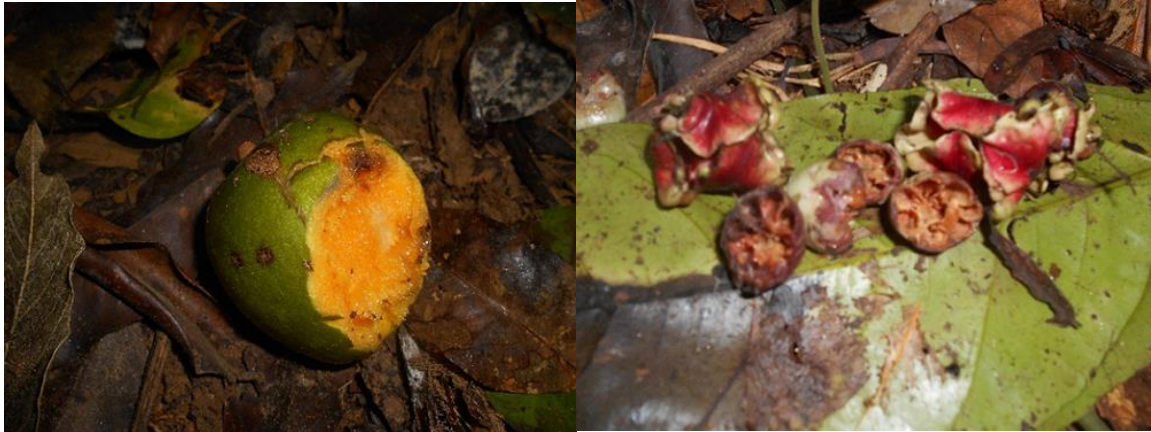
Left: Irvingia gobonensis (fruit) eat by gorilla group. Right: Diospyros sp. Fruit eat by silverback.