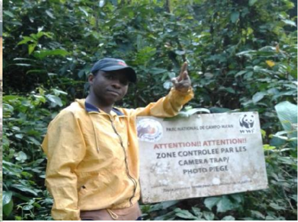
Left: Gorilla habituation camp. Right: Moving in the field.