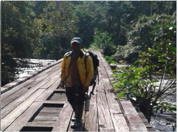
Left: Ntem River who surround the study site (Dipikar Island). Right: Crossing Ntem River Bridge.