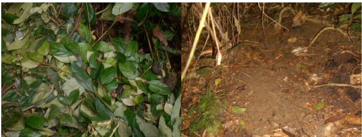
Left: Ground nest of silverback. Right: No vegetation nest.