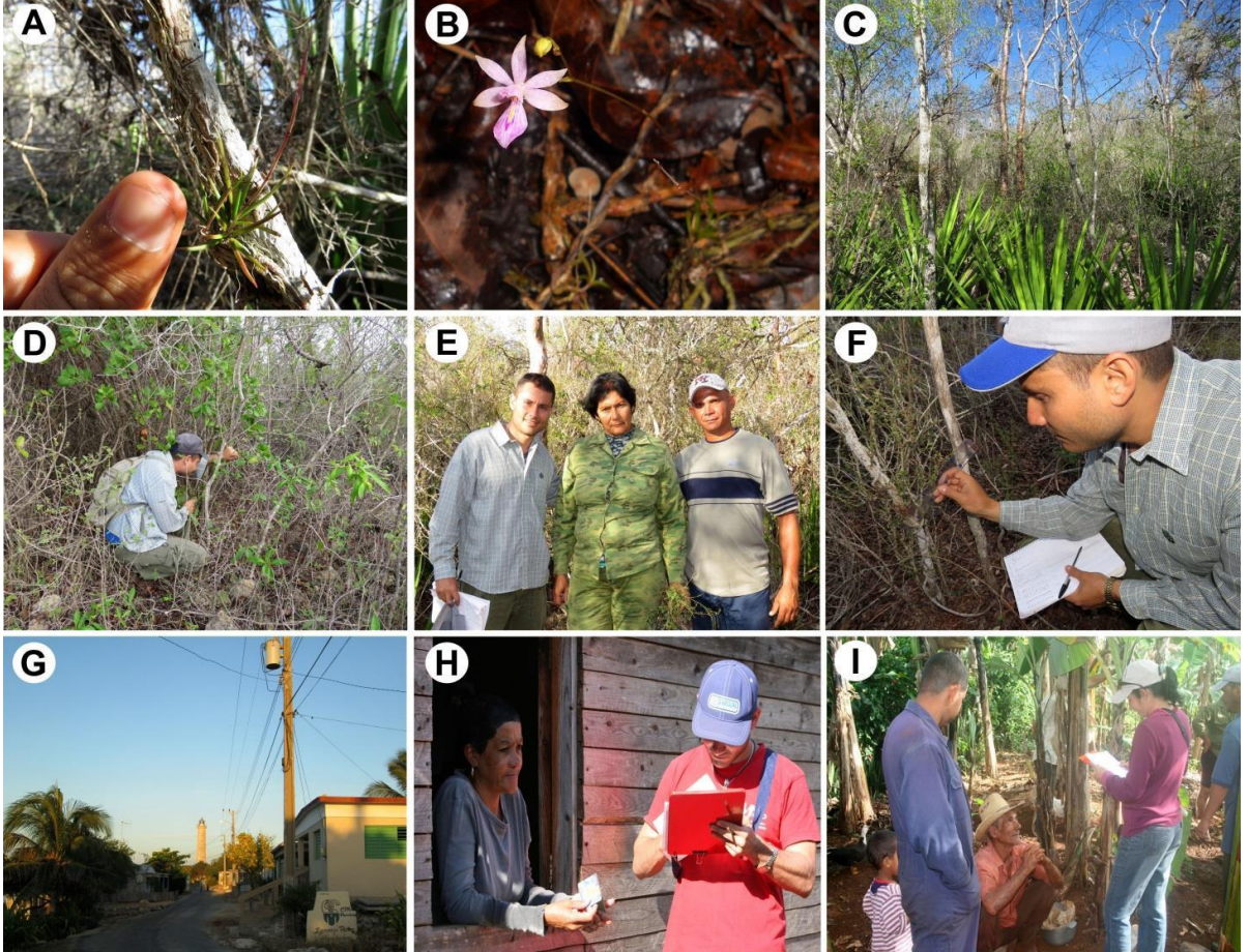
Figure 1. A: Tetramicra malpighiarum (Orchidaceae) individuals in their habitat, on the El Guafe trail, Desembarco del Granma National Park (DGNP), Cuba. B) Flower of T. malpighiarum C) Transition areas between semideciduous forest strips and coastal xeromorphic scrubland, where the population of T. malpighiarum lives in El Guafe. D) Conducting field explorations in search of T. malpighiarum populations, on the southeastern coast of Cuba. E) Part of the working team during field explorations. F) Taking ecological data from T. malpighiarum population in El Guafe. G) Cabo Cruz Community. H and I) Community work and environmental education activities with the residents of Cabo Cruz.