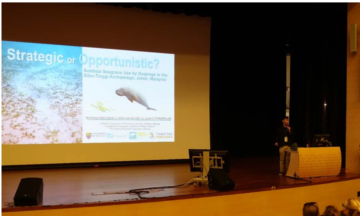
Presented at the World Seagrass Conference 2018 in National University of Singapore, Singapore, 11th – 13th June 2018.