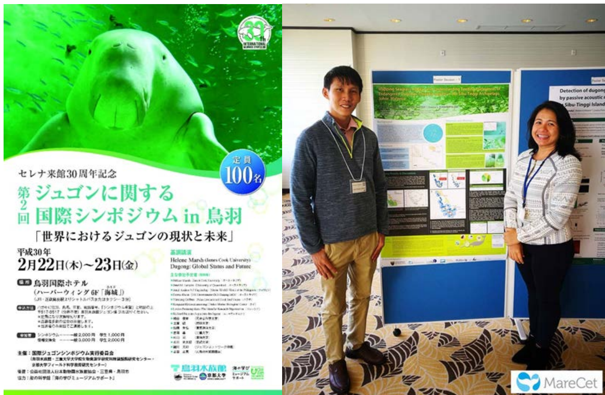
Poster presented at The Second International Dugong Symposium in Toba, Mie Prefecture, Japan, 22 nd – 23 rd Feb 2018.