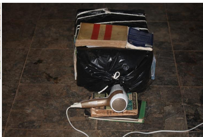
Figure 11: Drying samples by hair drier