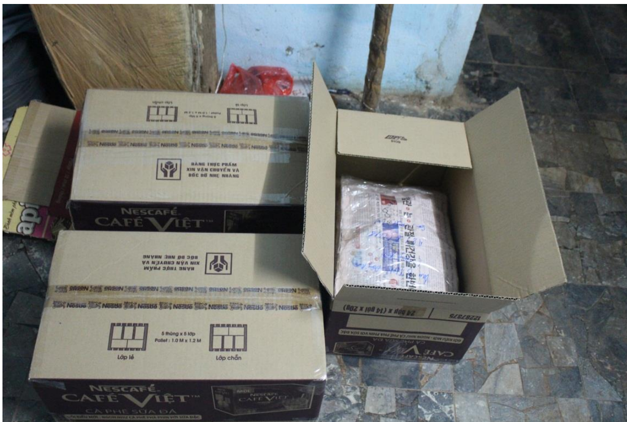
Figure 12: Packing samples for delivery to Silviculture Research Institute in Hanoi