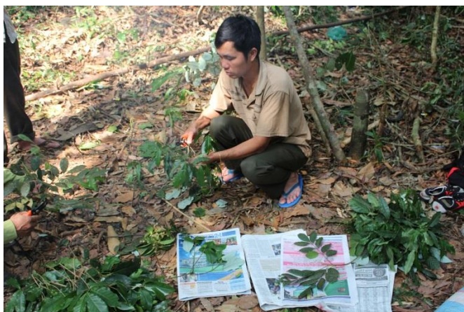
Figure 8: Collecting leaf sample on the site