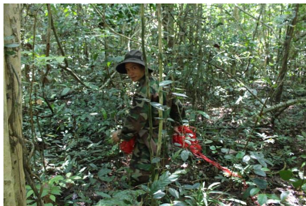
Figure 3: Sampling design