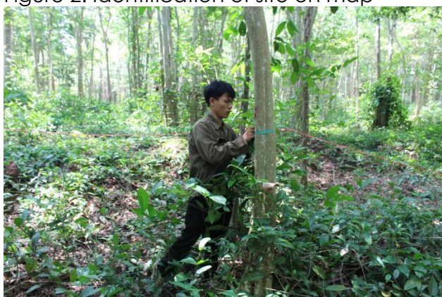
Figure 4: Tree measurement in sample plot