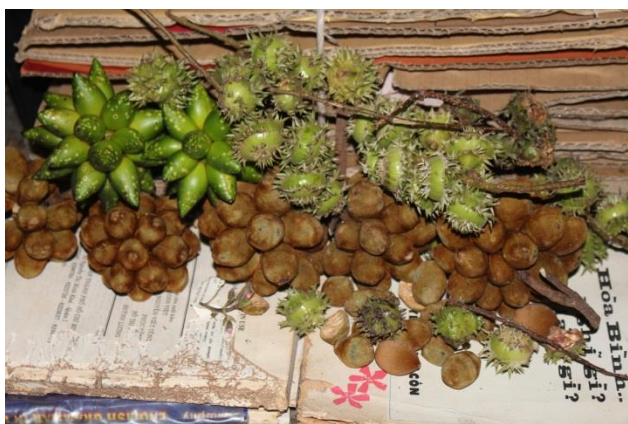
Figure 10: Fruit samples