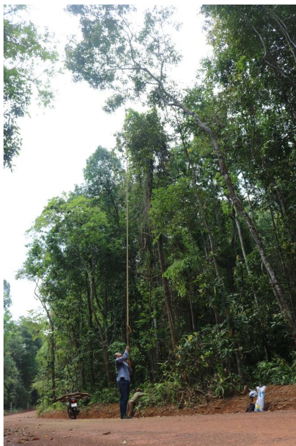
Figure 7: Collecting samples from tree crown