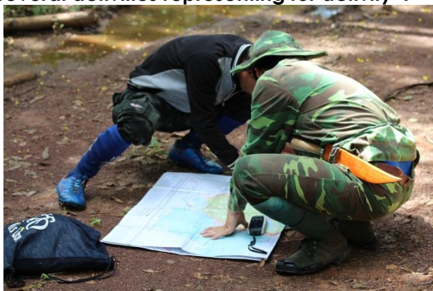
Figure 2: Identification of site on map