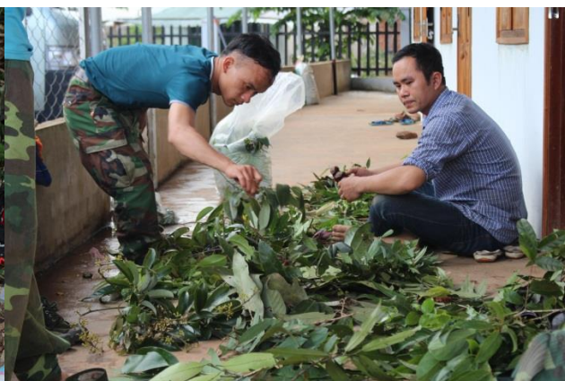
Figure 9: Selecting samples at home